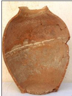
Yellow residue visible on a piece of a wine vessel from about 3150 BC