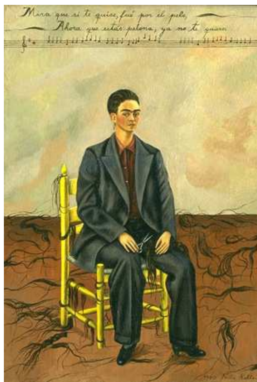
Self portrait with cropped hair, 1940