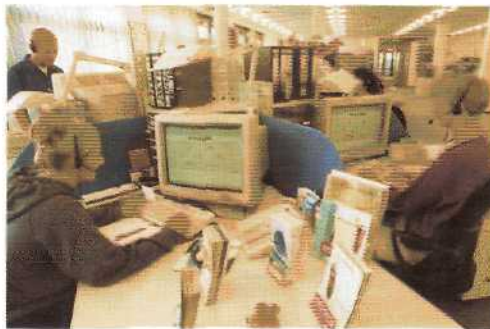
A call centre

6 People who come home to ten answerphone messages, all selling things, tend to hate it.