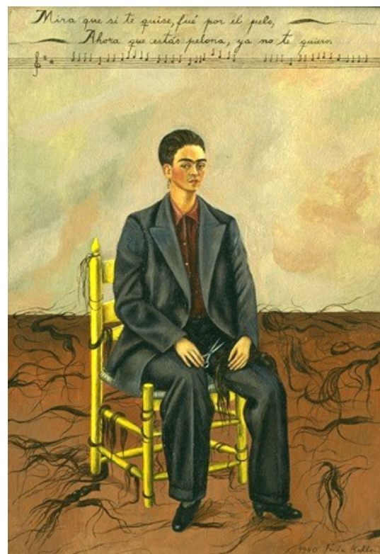
Self portrait with cropped hair, 1940