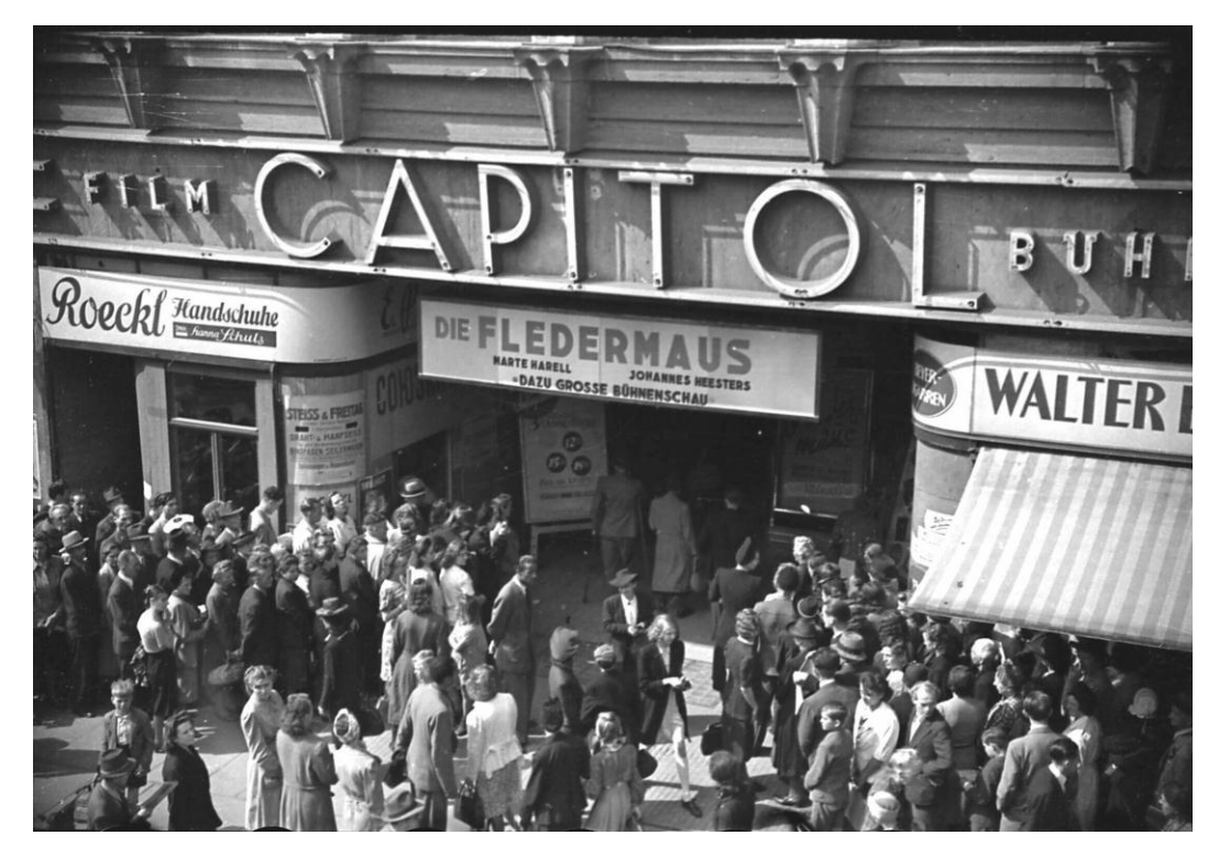
Figure 4: Capitol , an advertisement for the German movie Die Fledermaus ( The Bat ; 1945).

The alarmingly poor attendance of the Soviet movies triggered a specific distribution practice: double-features assembled from a highly popular German movie and a Soviet documentary or a Soviet feature – a practice which was hated by the audiences (and repeated later in Czechoslovakia and probably in other countries of the Soviet zone). The push from the Soviet administration to reach a certain share of cinemagoers for the Soviet movies led to the practice that the (usually high) attendance at the double-feature screenings was counted as an attendance of the Soviet movie – despite the audience attempting to stay just for the German feature and to skip the movie of the Soviet origin.