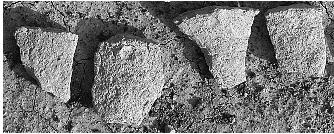
Fig. 5. BRB fragments from the surface of Qaleh Gelli.

The possible means by which these vessels reached, or were made at, Ghabristan are numerous, but they undeniably connect the site, however tenuously, with the world of Late Uruk Mesopotamia. Interest of the lowlanders in access to nearby copper sources, or rather to means of exchange with long-established communities who controlled copper extraction, smelting and casting, may well be materialised in some way in the form of the recovered bevelled-rim bowls.” (Matthews and Fazeli 2004: 65; Fazeli 2004: 197)