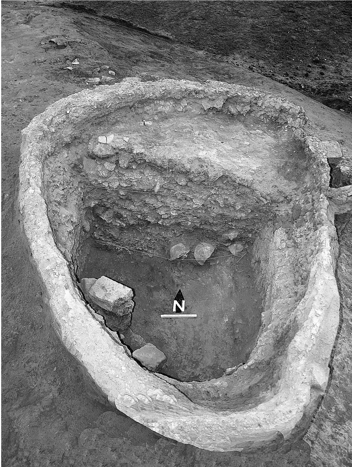
Fig. 6. Kiln with BRBs inside at the Middle Susiana site of Tall-e Abu Chizan, eastern Khuzestan.