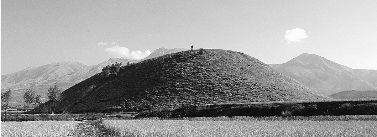
Fig. 4. View of Qaleh Gelli, November 2002.