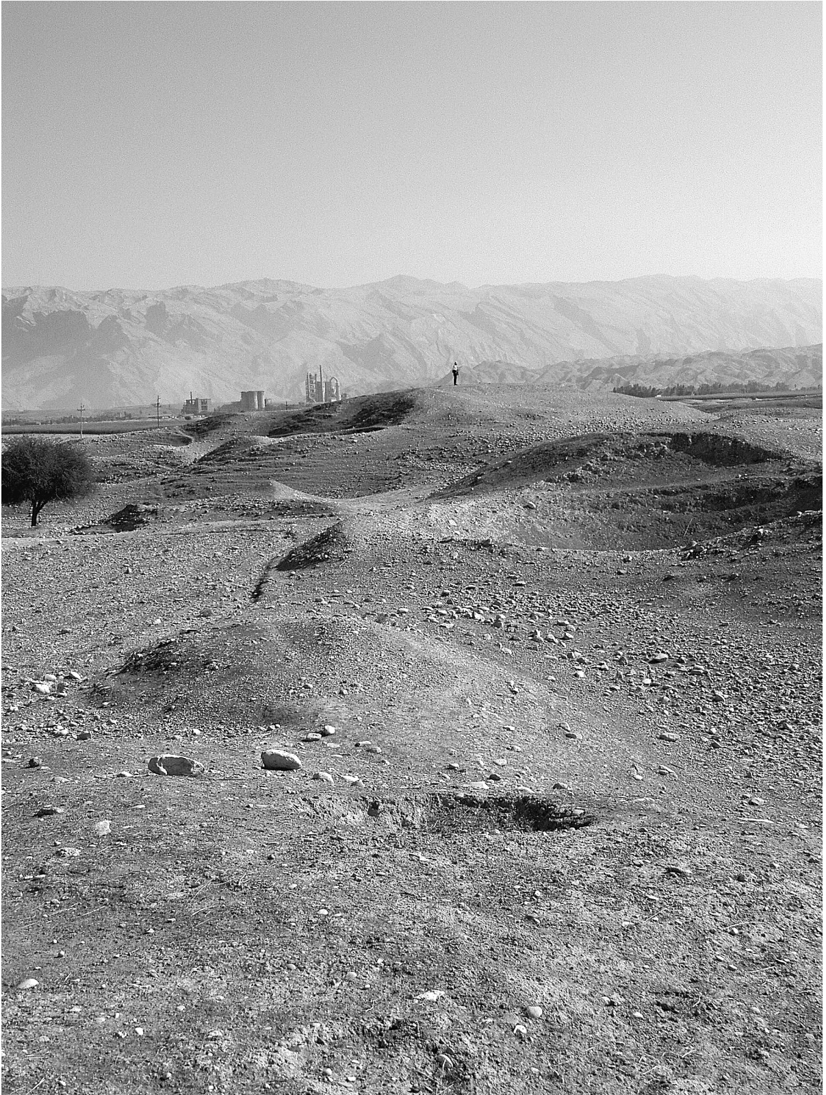
Fig. 2. View of the surface of Arjan, November, 2002.