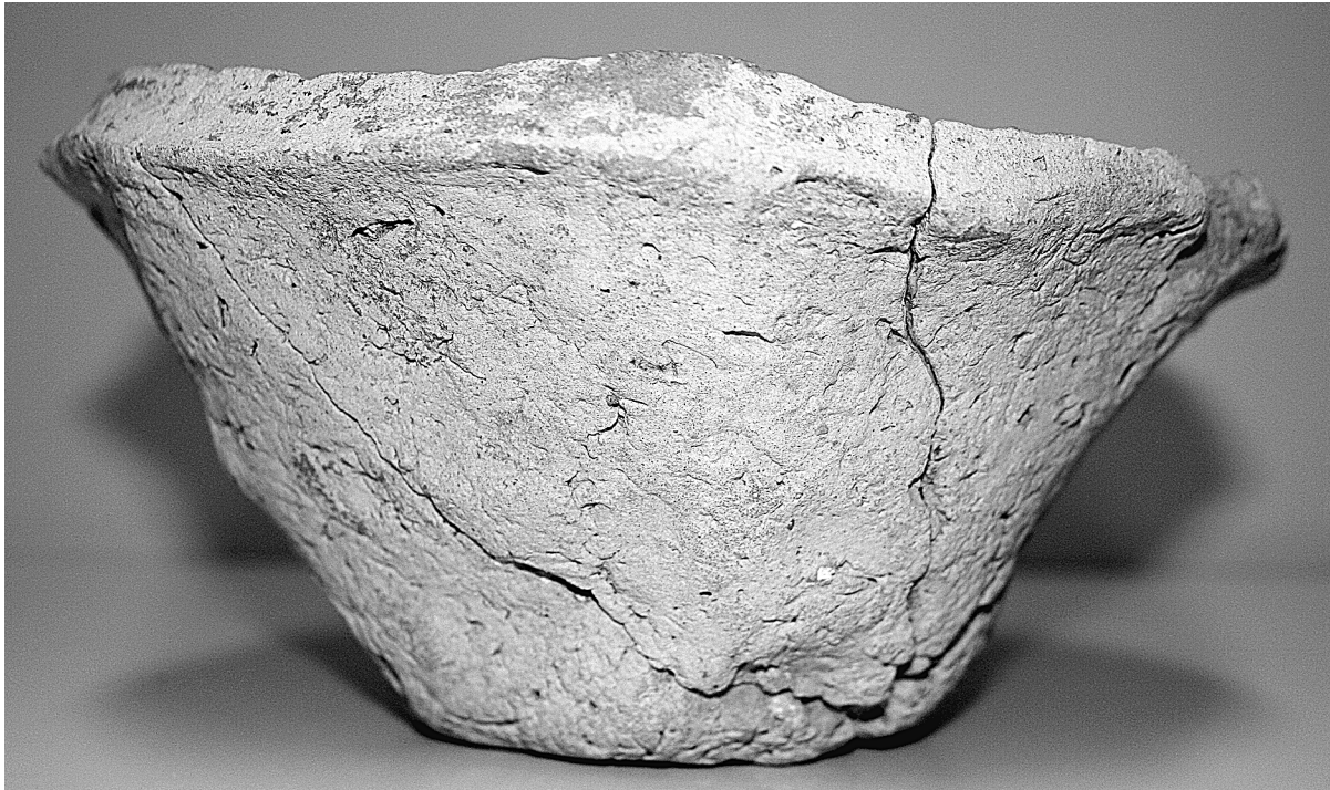
Fig. 1. BRB from Ur, donated to the Nicholson Museum, University of Sydney, in 1935 (NM 35.81), height 8.5–9.8 cm, base diameter 7.5 cm, rim diameter 16–16.8 cm.

this point needed no further emphasis, however, and again the question of function arose, this time from an entirely different perspective.