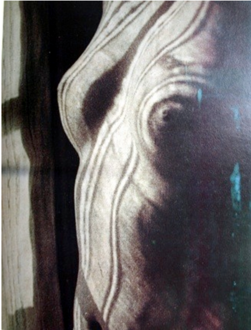
Man Ray - "Return to Reason", 1923.