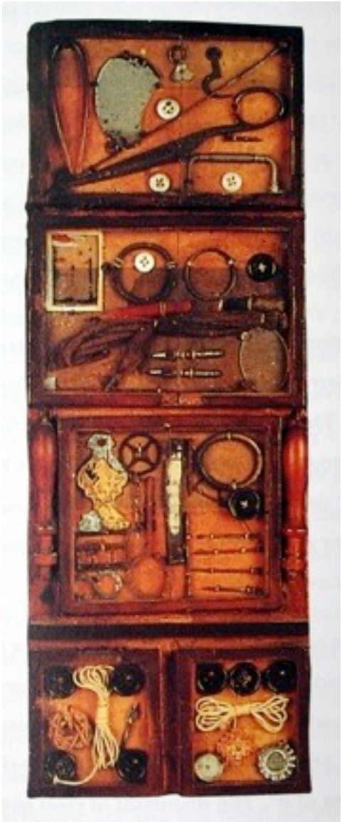
Anonymous - “Assemblage of objects”, André Breton Collection.