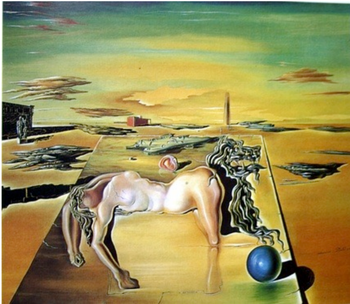
Salvador Dalí - "The Invisible Sleeping Woman, Horse, Lion etc", 1930.