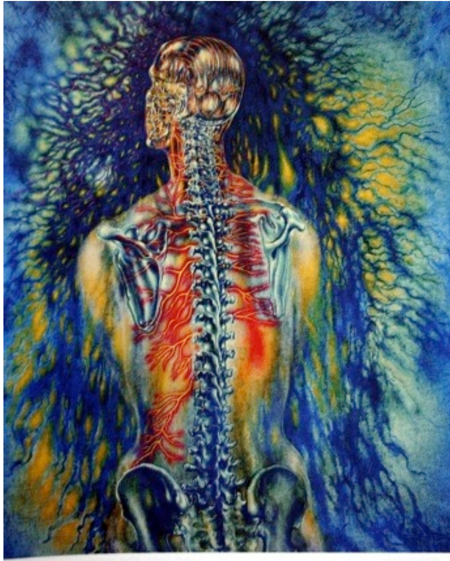
Pavel Tchelitchev - "Anatomical Painting", c.1944-5.