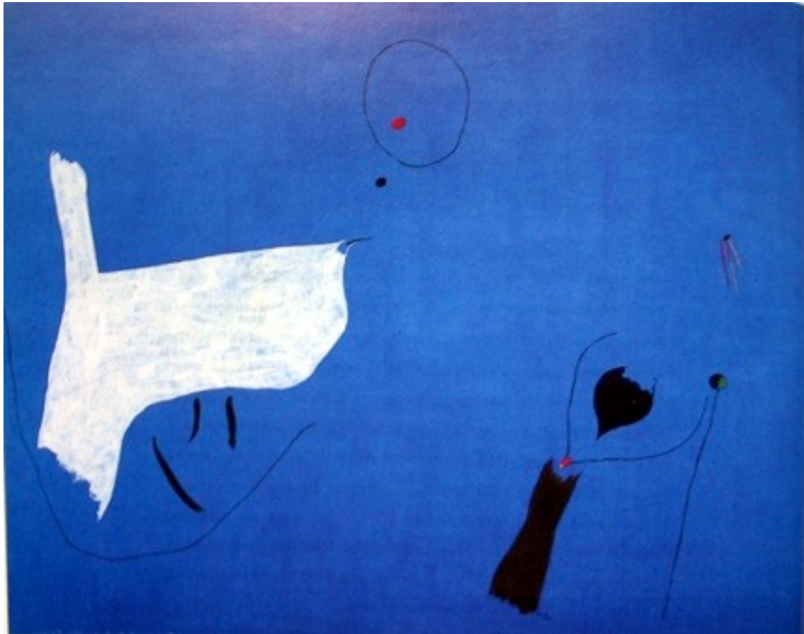
Joan Mirò - "Painting", 1927.