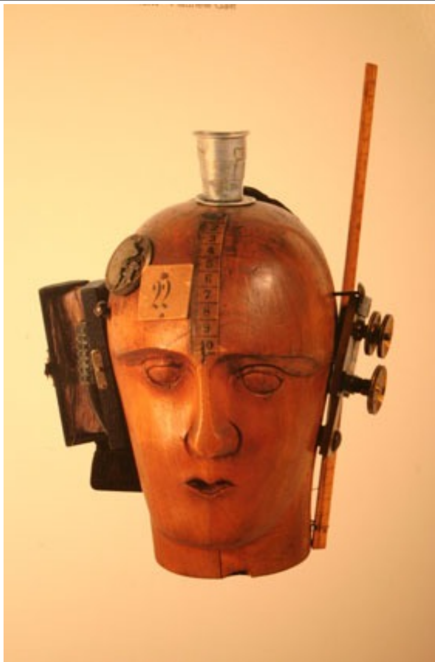
Raoul Hausmann - "Mechanical Head: Spirit of the Age", 1920.