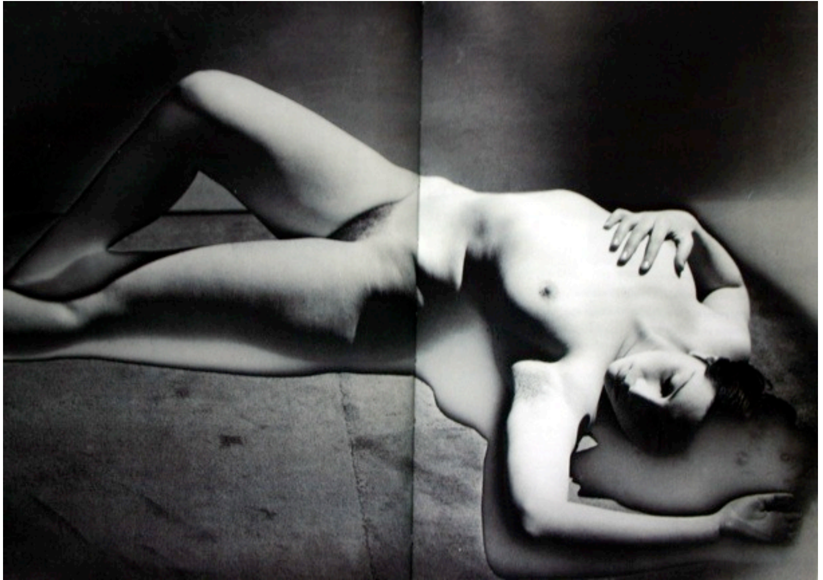
Man Ray - "The Primacy of Matter over Thought", 1929.