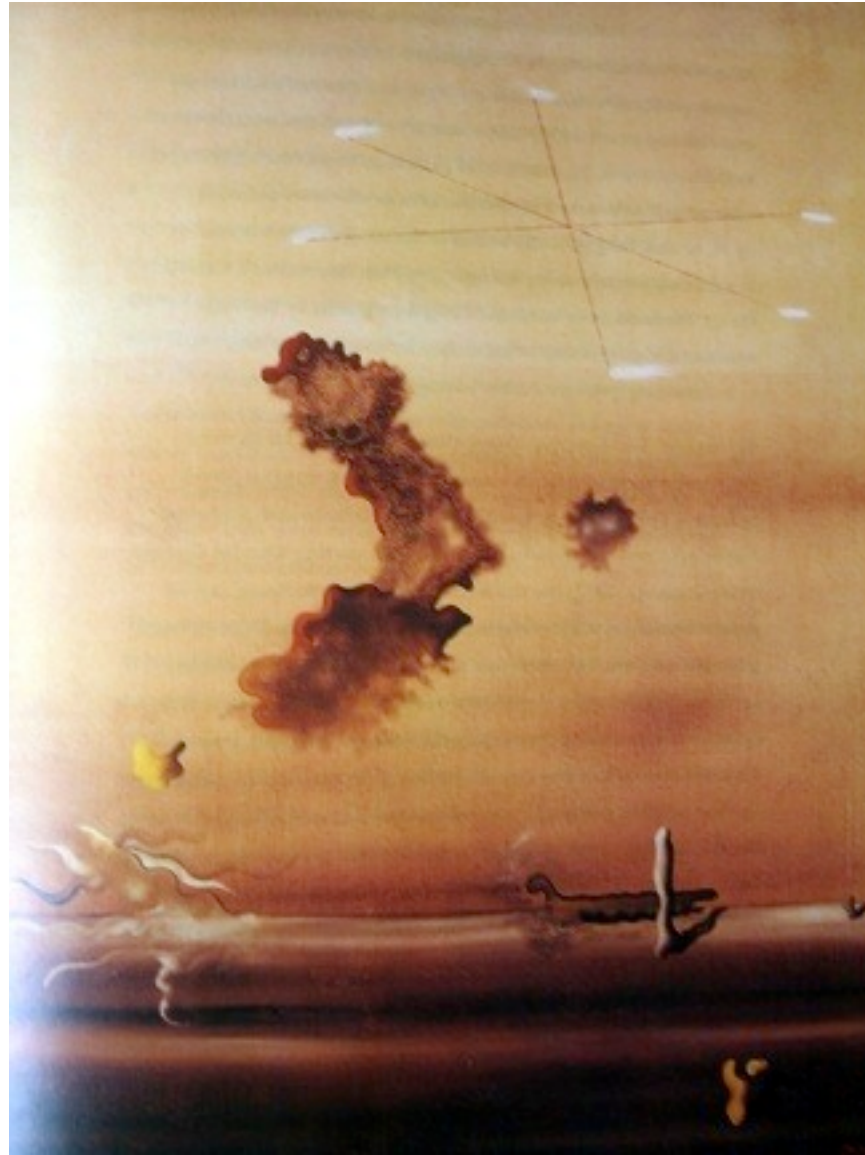
Yves Tanguy - "Outside", 1929.