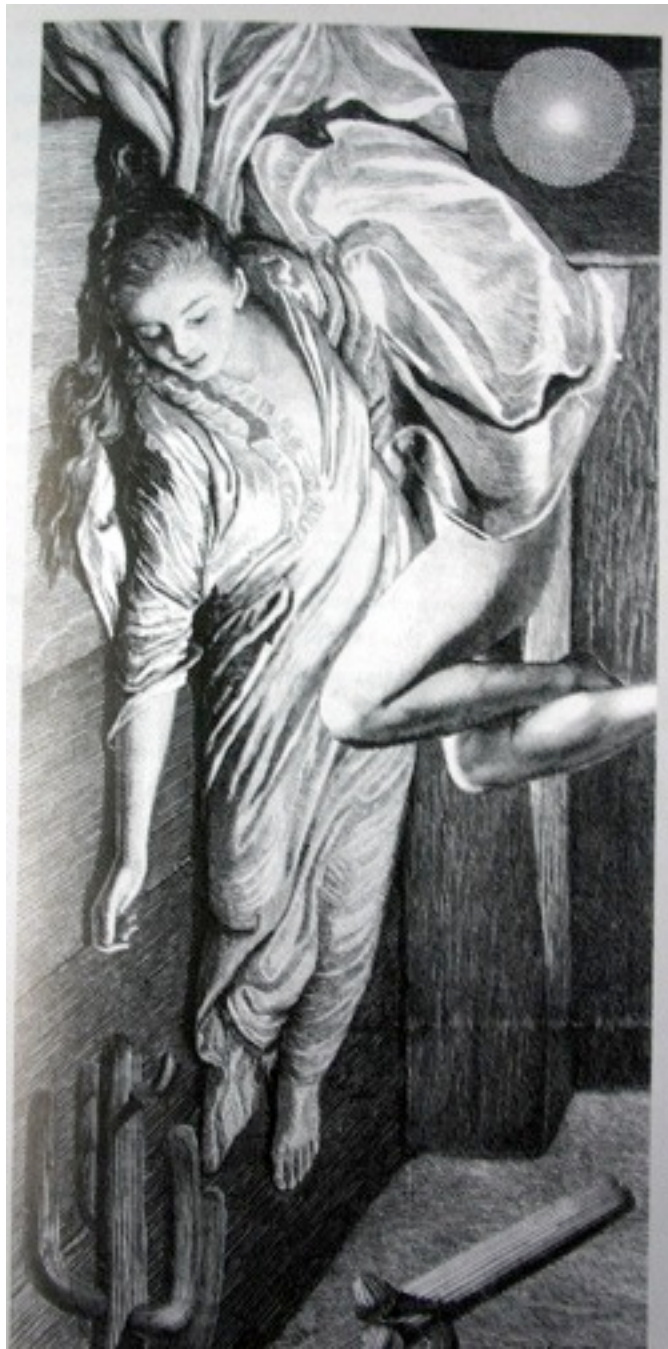
Max Ernst - "The Hundred Headed Woman Opens her August Sleeve", Collage, 1929.