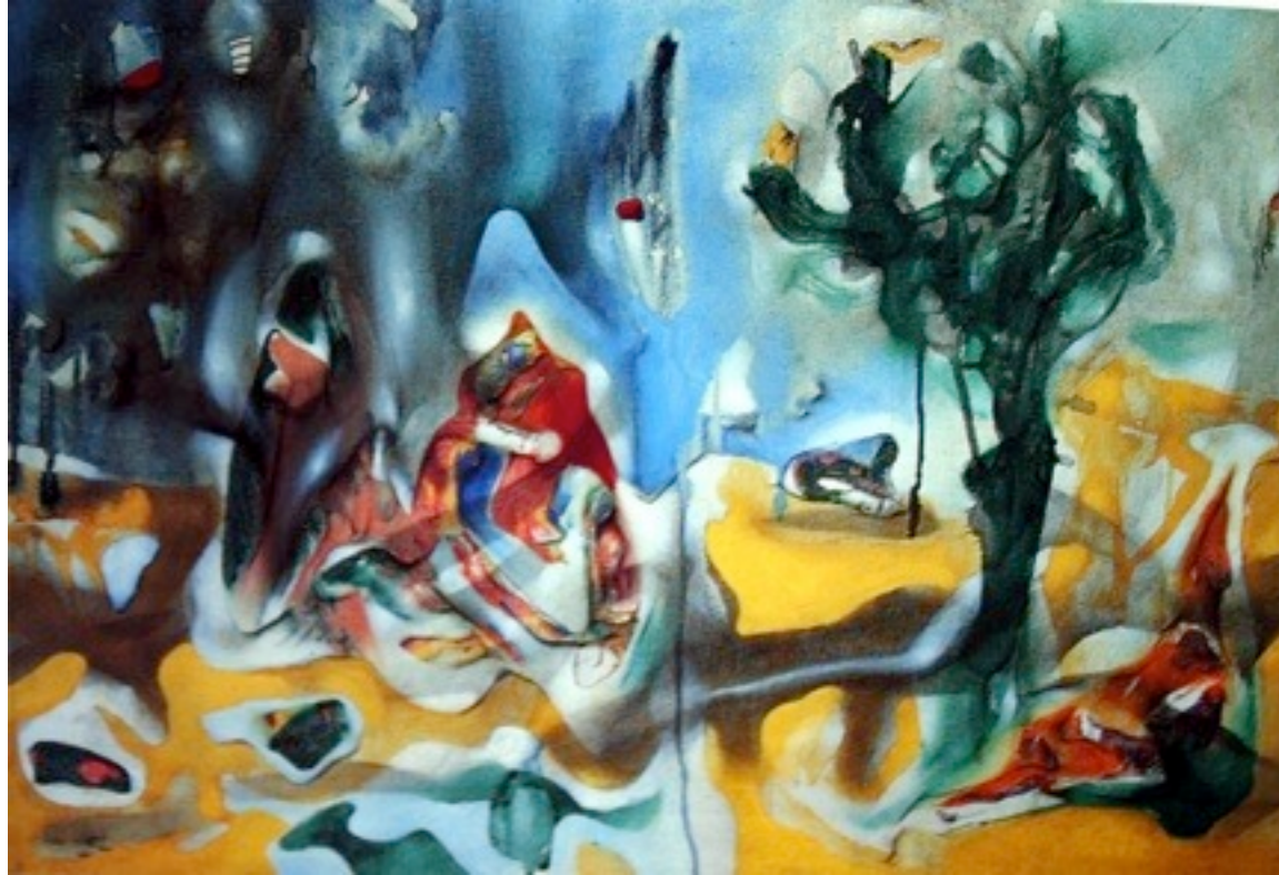
Roberto Matta - "Morphology of Desire", 1938.