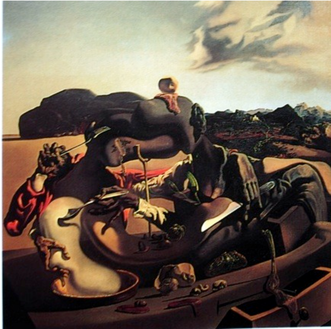
Salvador Dalí - "Autumn Cannibalism", 1936.