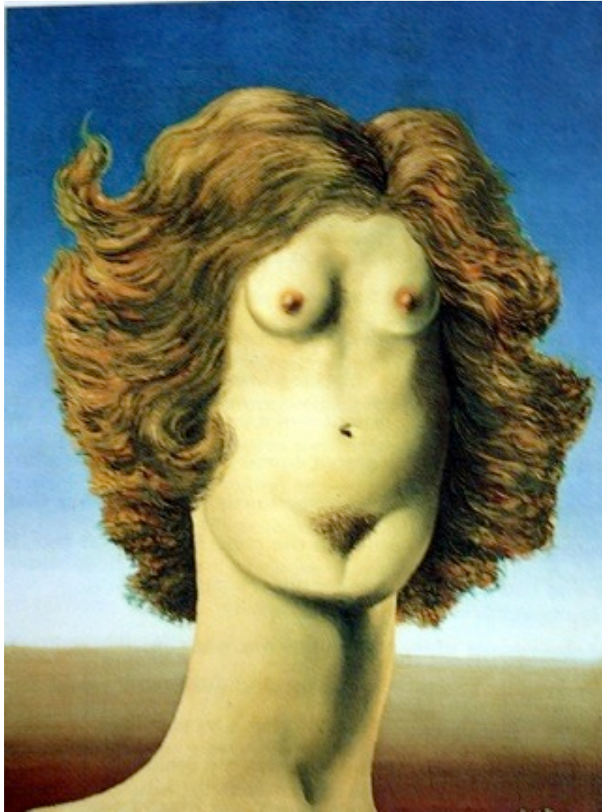
René Magritte - "The Rape", 1934.