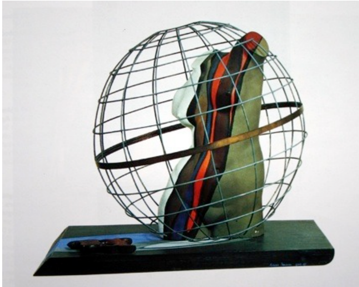
Roland Penrose - "The Last Voyage of Captain Cook", 1936-7.