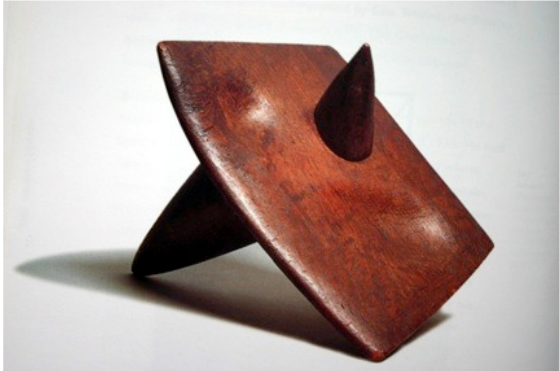
Alberto Giacometti - "Disagreeable Object", 1932.