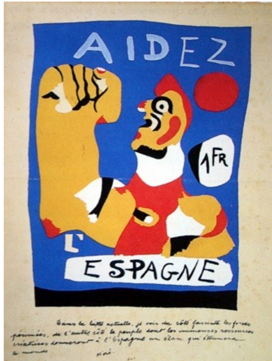
Joan Miró - "Aidez l'Espagne", 1937.