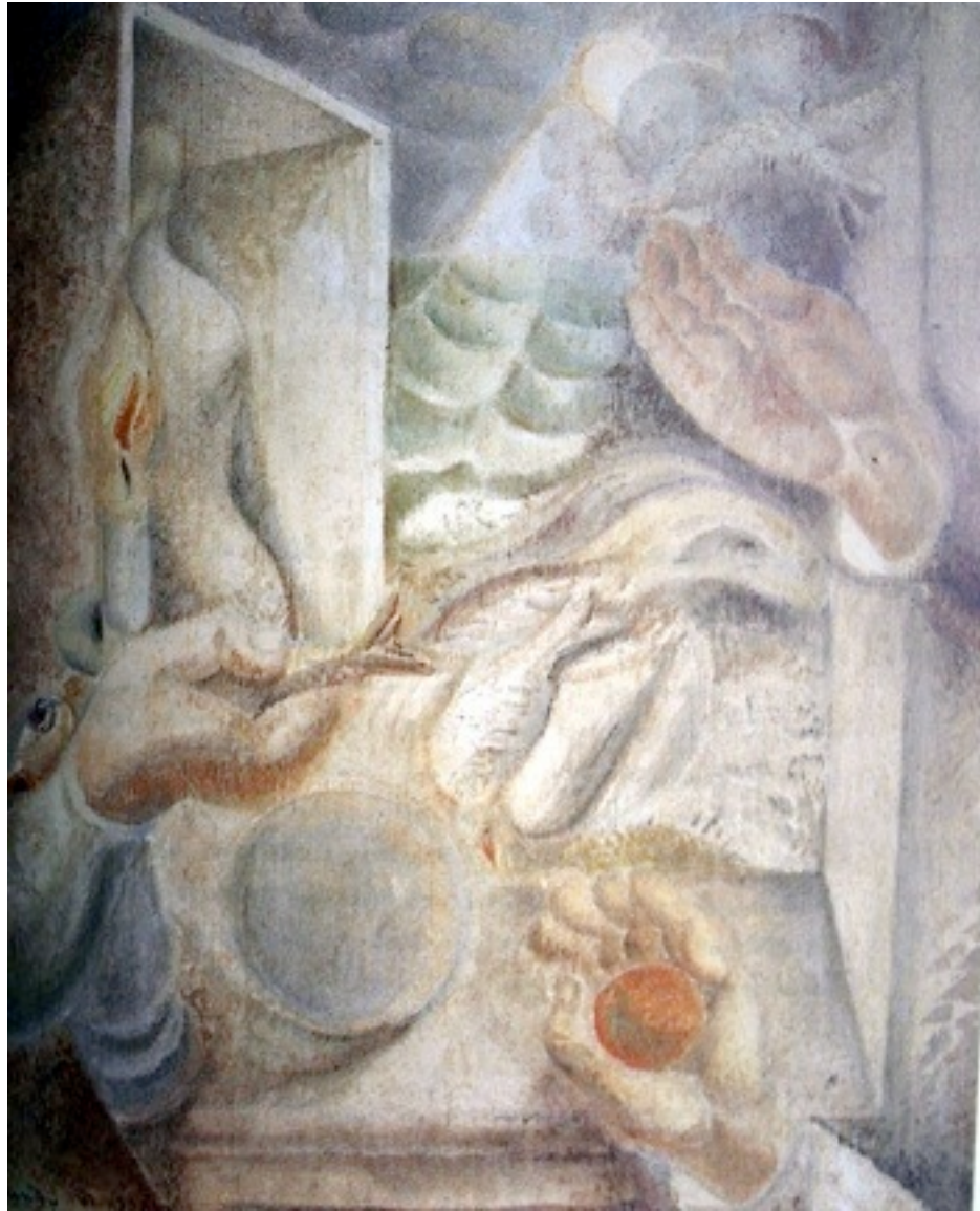
André Masson - "The Four Elements", 1923-4.