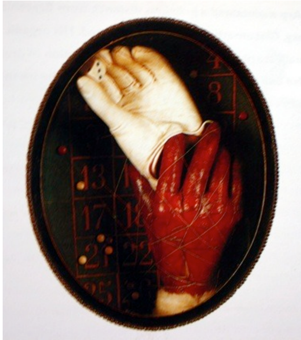
Valentine Hugo - "Object", 1931.