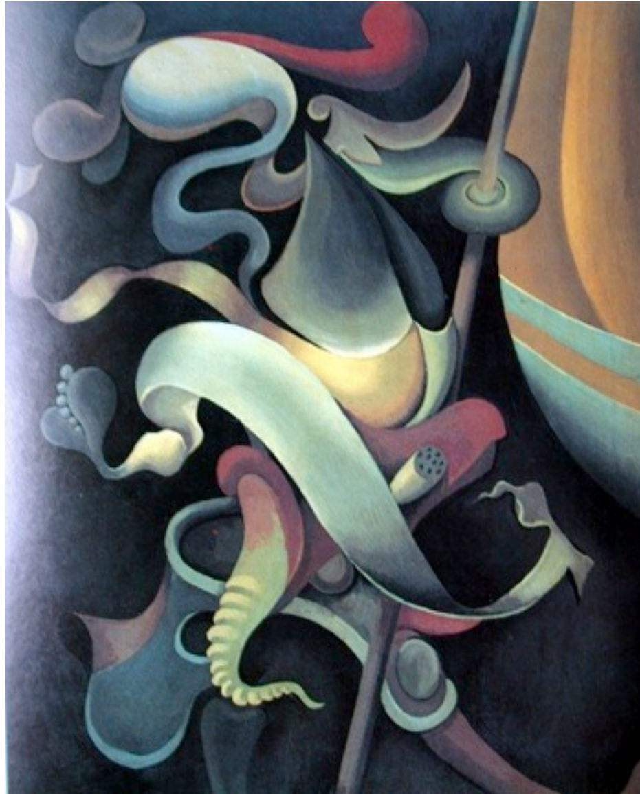
Kurt Seligmann - "Homage to Urs Graf", 1934.