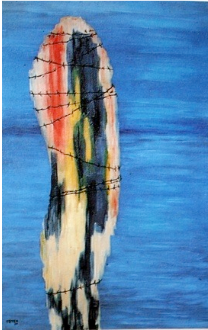
Toyen - "Prometheus Enchained", 1934.