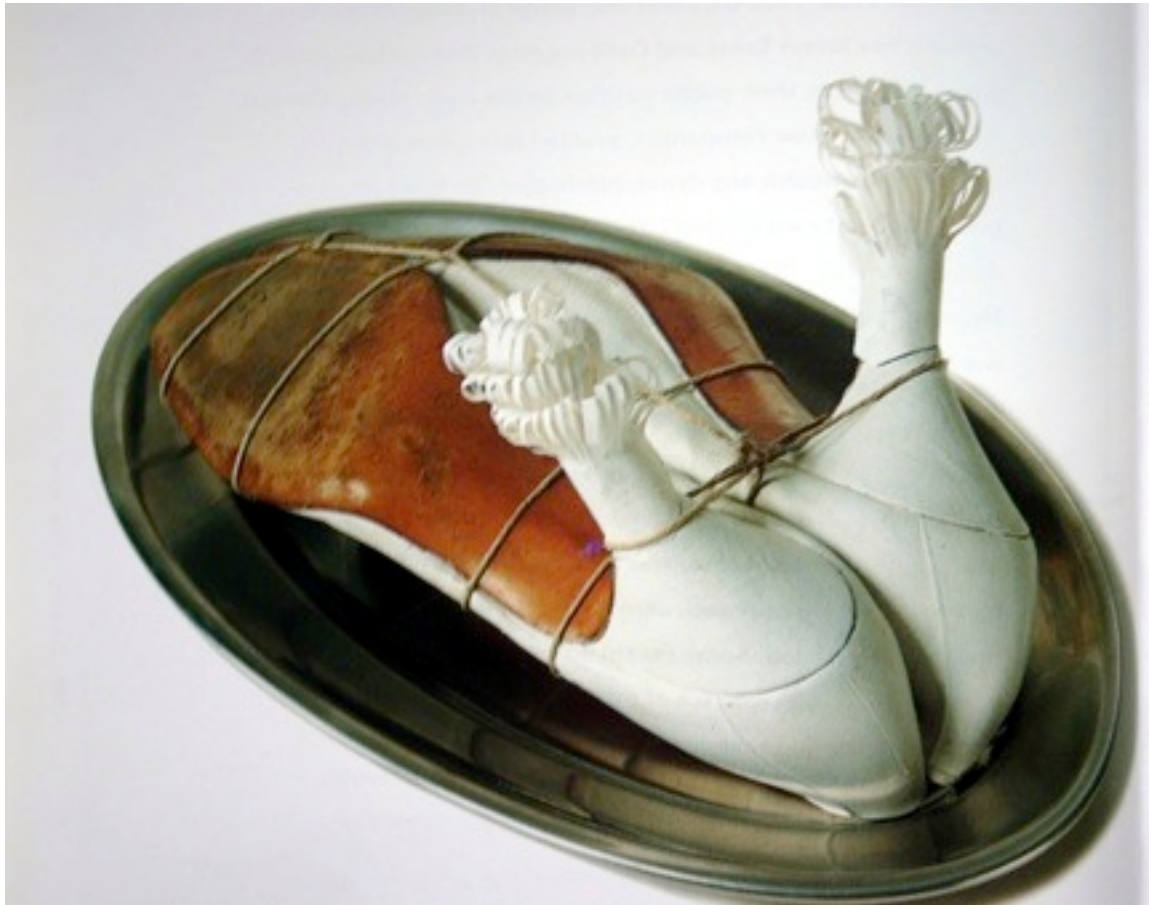
Meret Oppenheim - "My Governess", 1936.