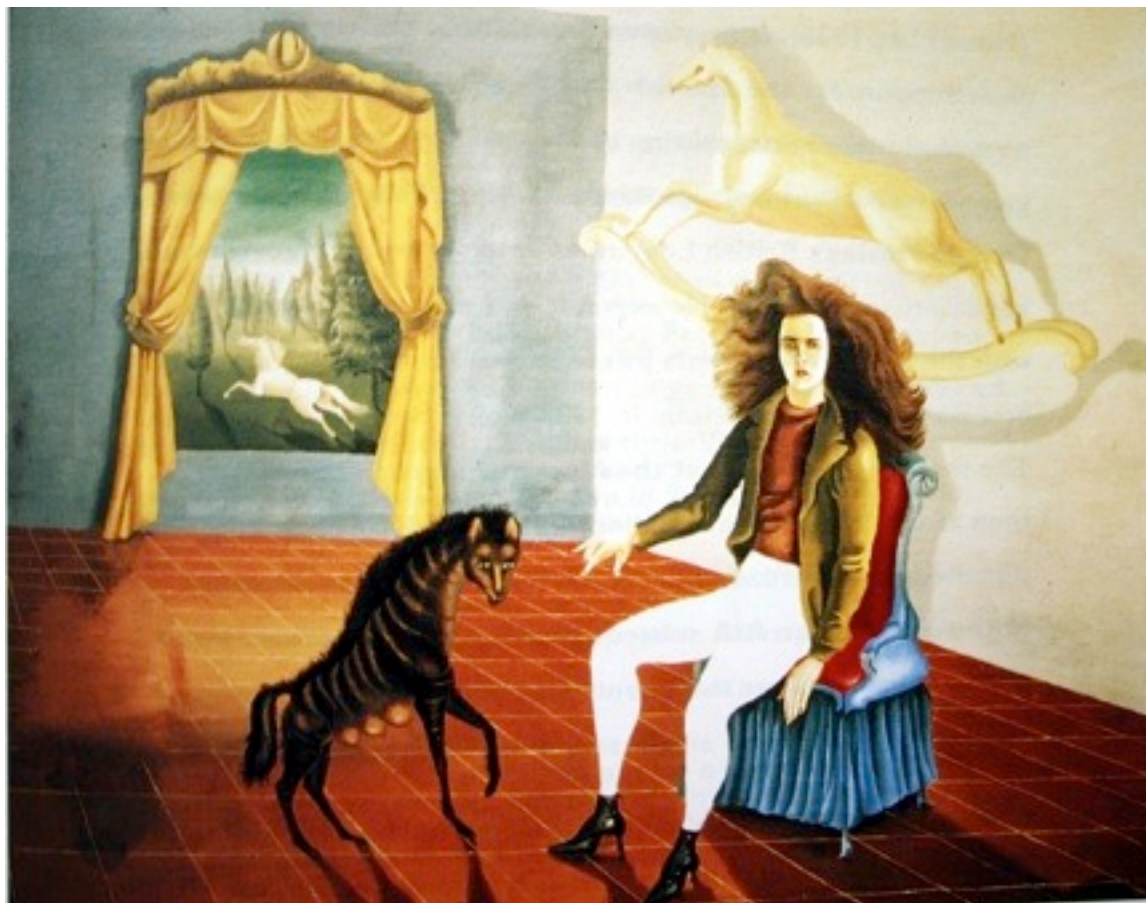
Leonora Carrington - "Self Portrait: The Inn of the Dawn Horse", 1937.