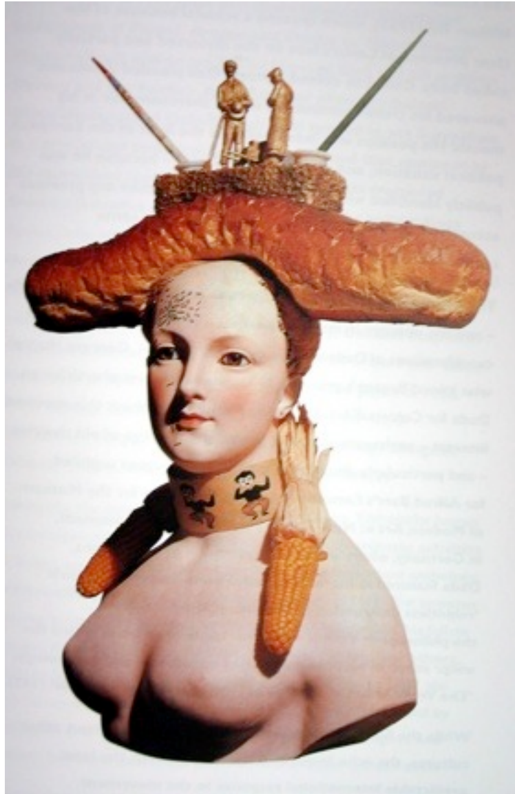
Salvador Dalí - "Retrospective Bust", 1933.