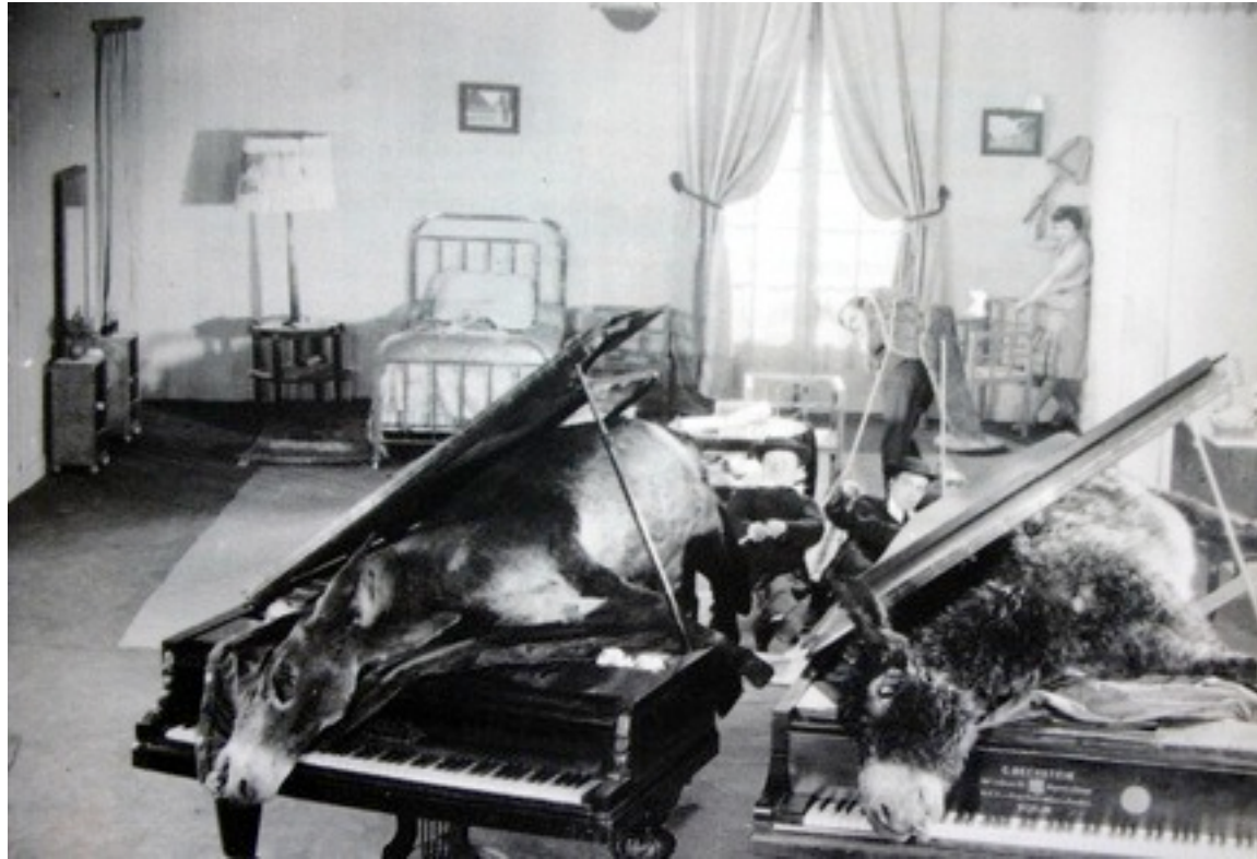
Salvador Dali & Luis Bunuel - "Un Chien Andalou", 1929.