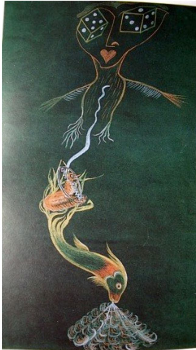
André Breton, Paul Éluard, Tristan Tzara & Valentine Hugo - “Exquisite Corpse”, 1929