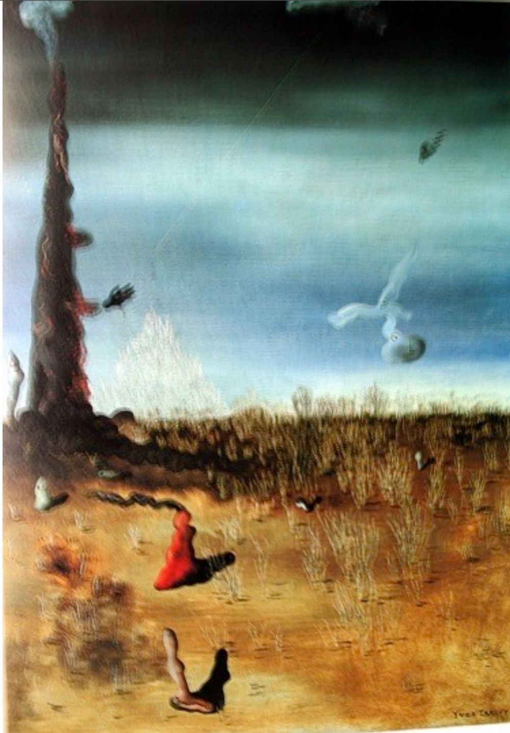
Yves Tanguy - "Extinction of Useless Lights", 1927.