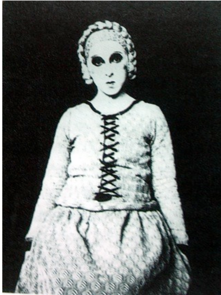
Cluade Cahun - "Untitled Self Portrait", 1929.