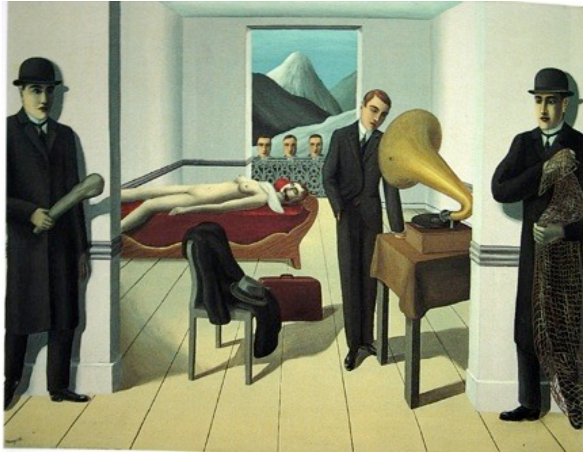
René Magritte - "The Menaced Assassin", 1926.