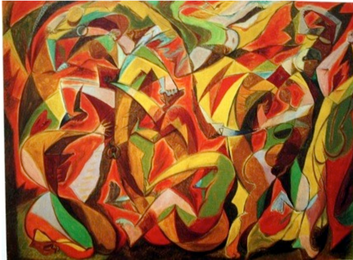
André Masson - "Massacre", 1931.