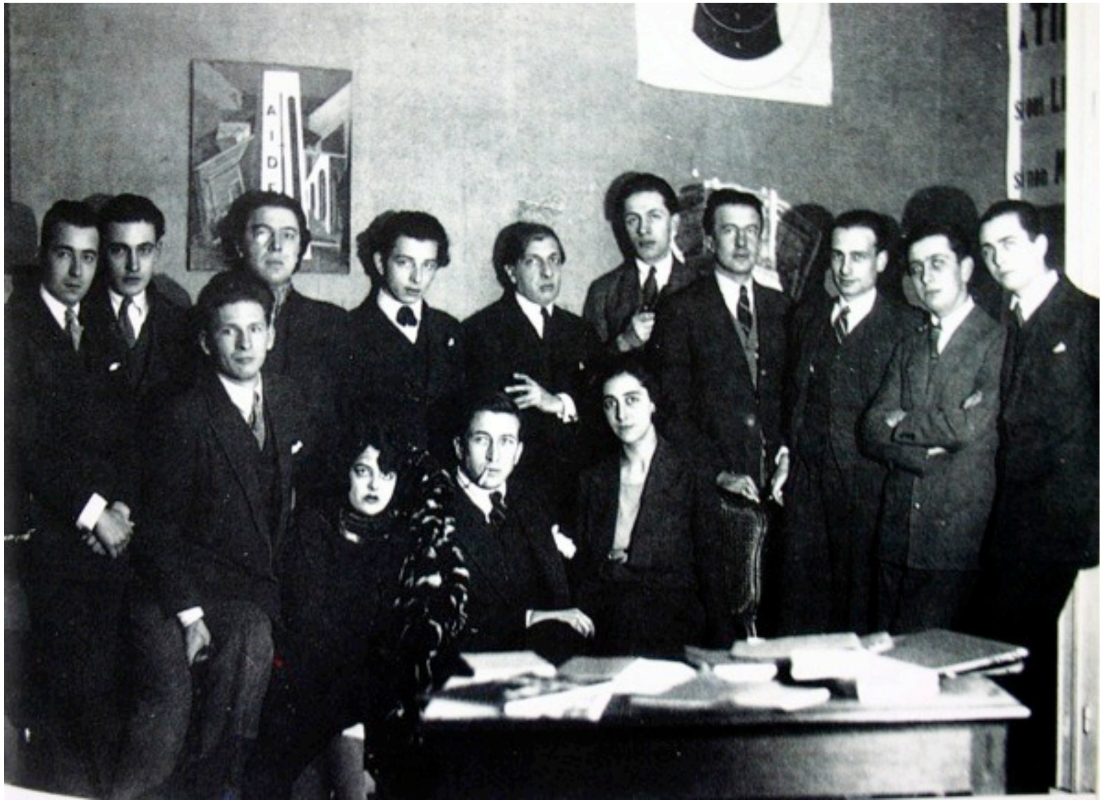
Man Ray - "Bureau of Surrealist Research", 1924.