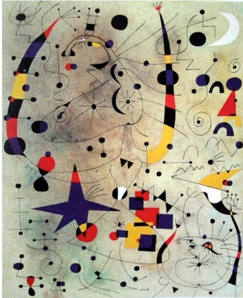
Joan Mirò - "Constellations: Acrobatic Dancers", 1940.