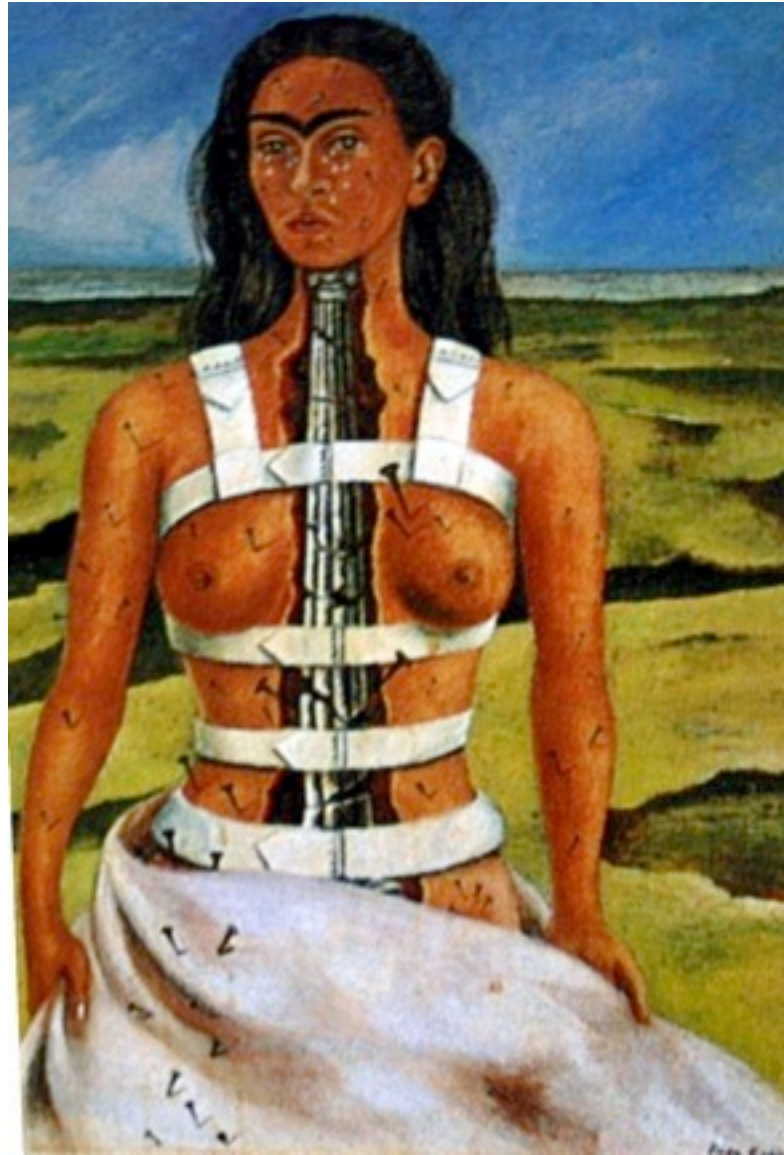
Frida Kahlo - "Broken Column", 1944.