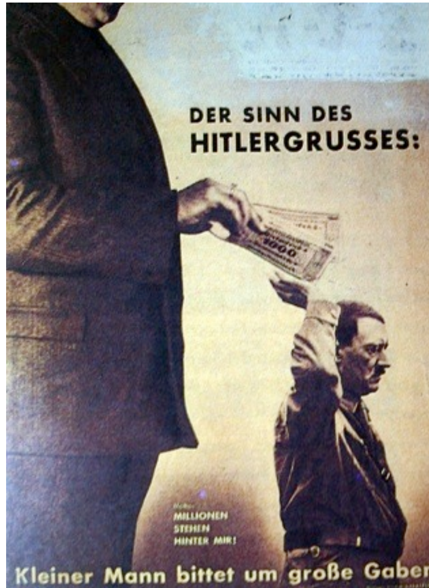
John Heartfield - "Millions Stand Behind Me", 1932.