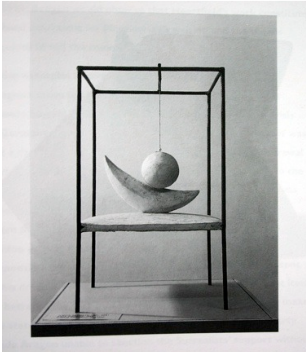
Alberto Giacometti - "Suspended Ball", 1930-31.