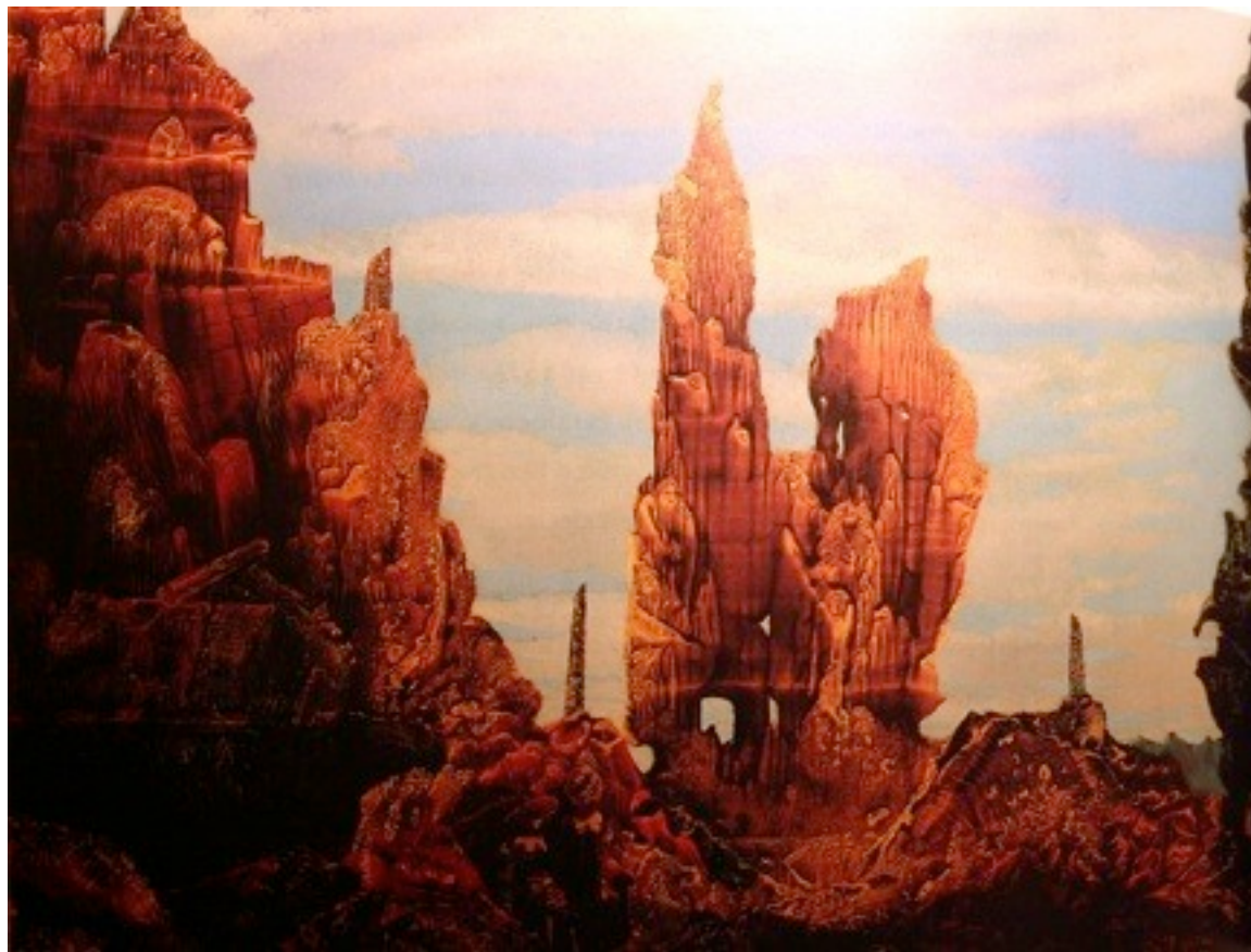
Max Ernst - "Europe After the Rain", 1940-3.