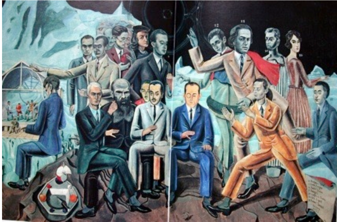
Max Ernst - "At the Rendevous of Friends", 1922.