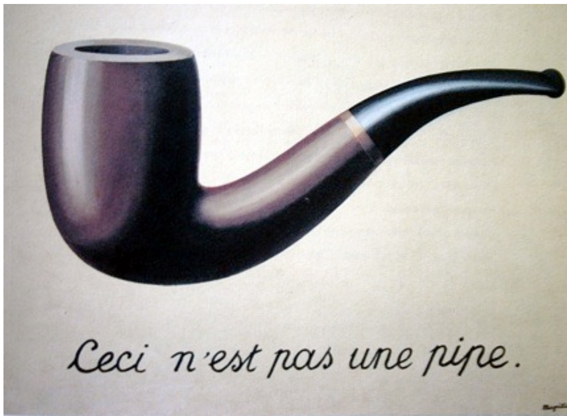
René Magritte - "The Treachery of Images", 1928.