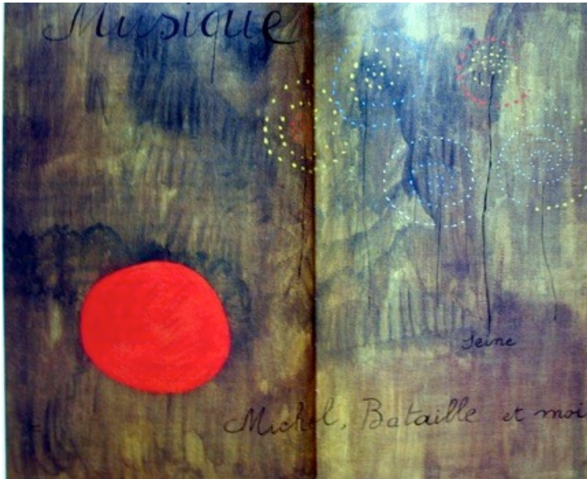
Joan Miró - "Musique, Seine, Michel, Bataille et Moi", 1927.