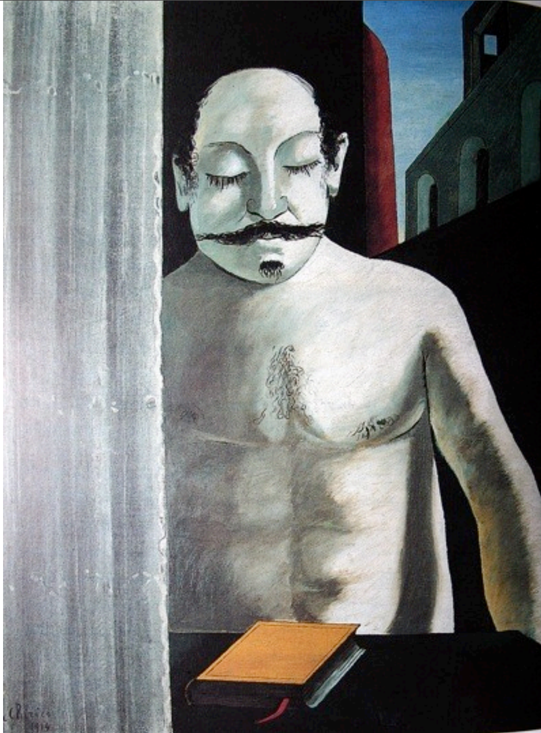
Giorgio De Chirico - "The Child's Brain", 1914.