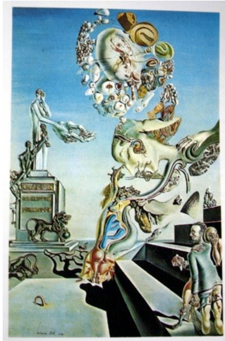
Salvador Dalí - "The Lugubrious Game", 1929.