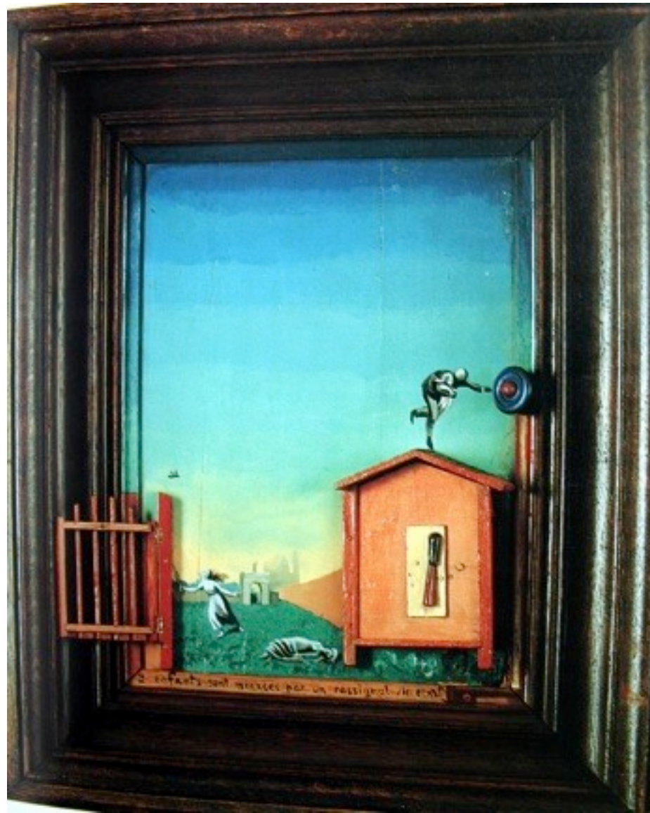
Max Ernst - "Two Children are Threatened by a Nightingale", 1924.