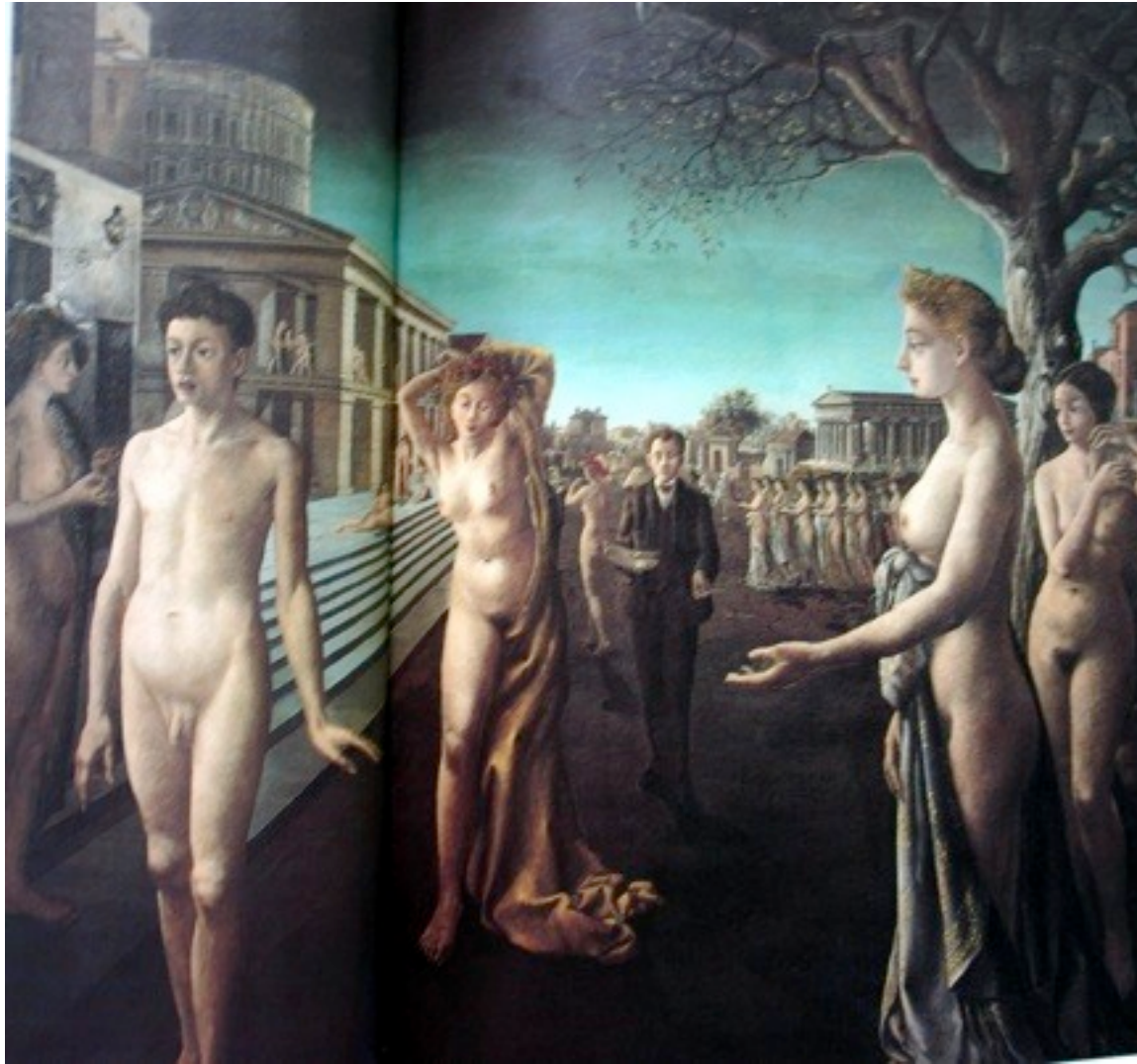
Paul Delvaux - "Dawn Over the City", 1940.