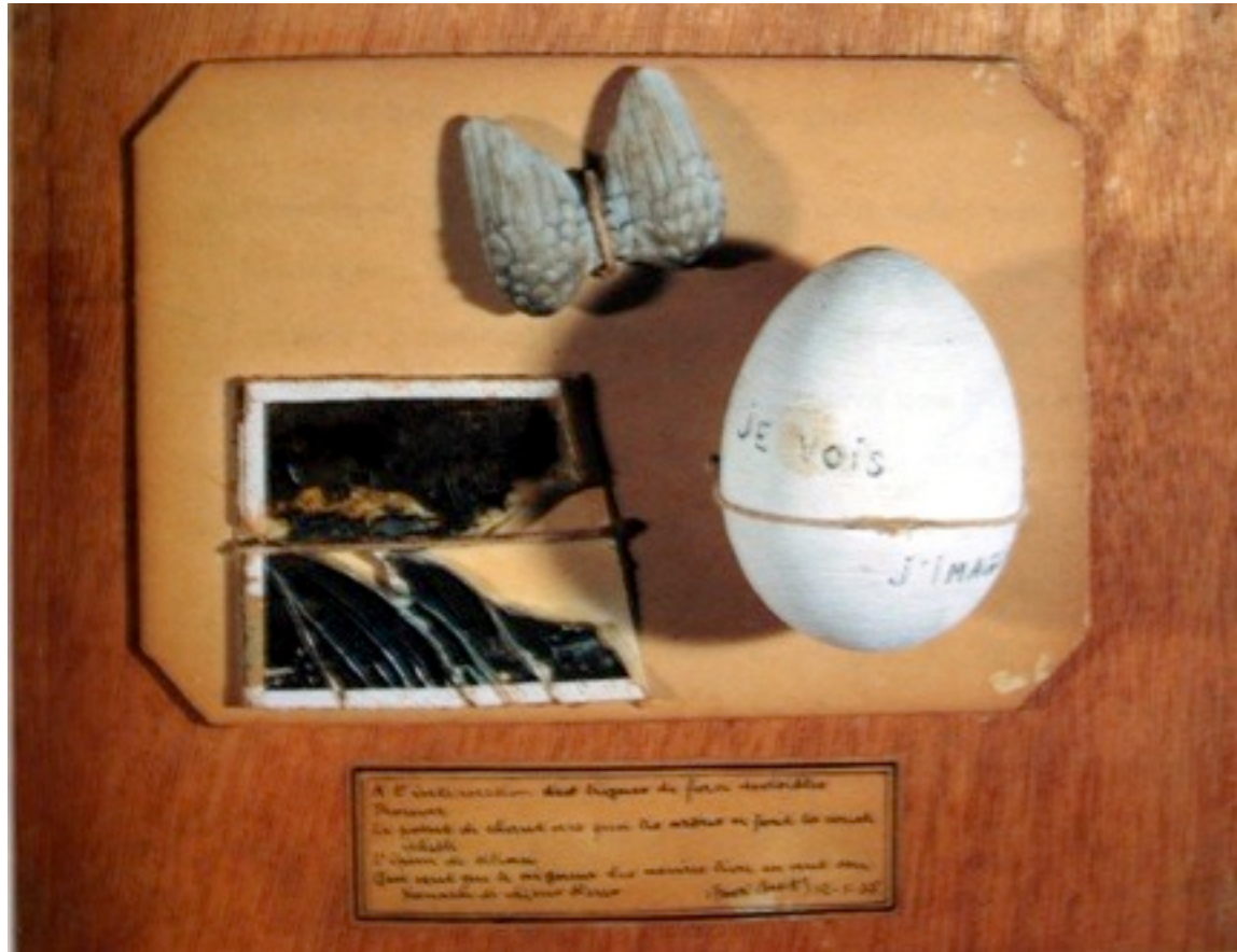
André Breton - "Poem Object - I see, I imagine", 1935.