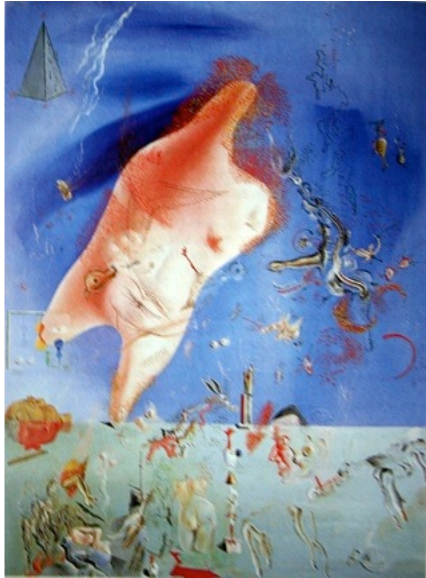
Salvador Dali - "Little Cinders", 1927.