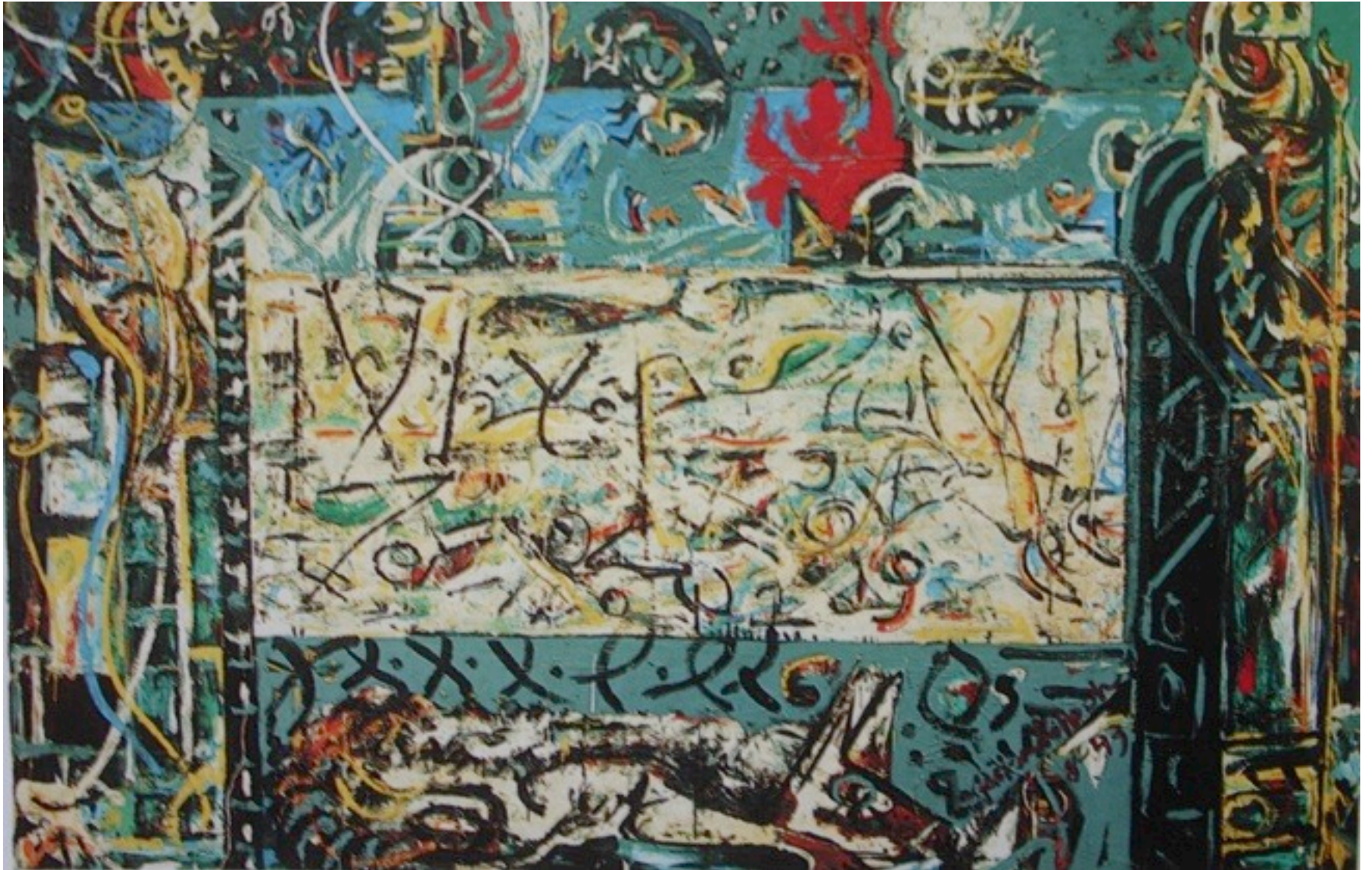
Jackson Pollock - "Guardians of the Secret", 1943.