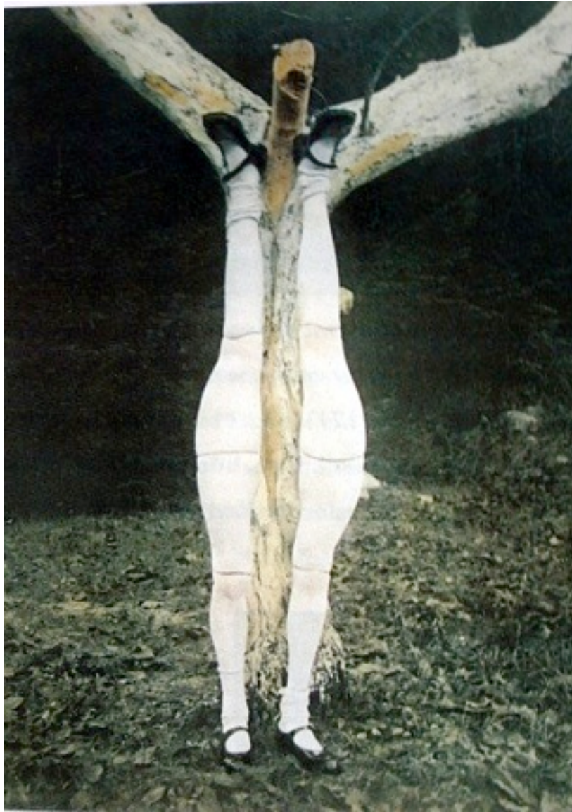
Hans Bellmer - "The Doll", 1936-49.