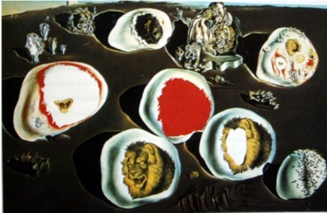
Salvador Dali - "The Accommodations of Desire", 1929.