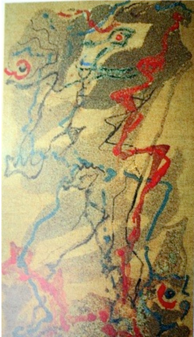
André Masson - "Figure", 1926-7