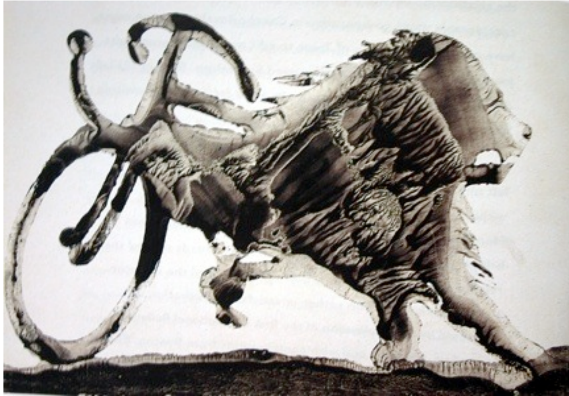
Oscar Dominguez - "Decalcomania without Preconceived Object", 1936.