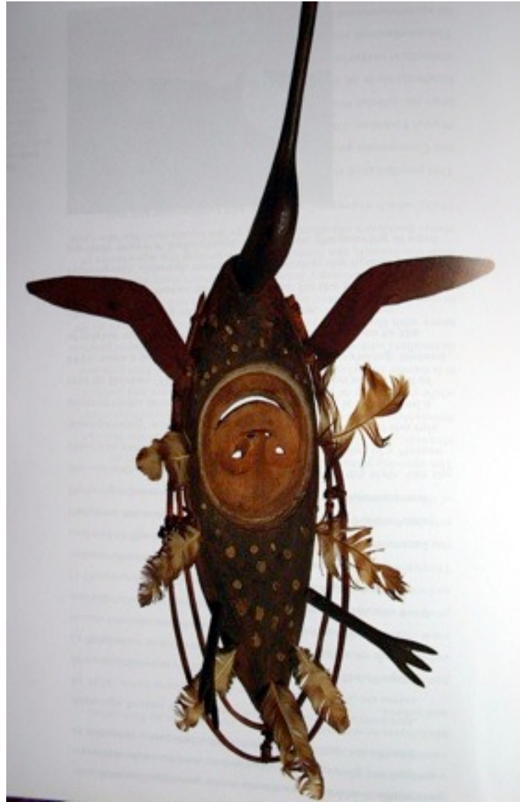
Inuit Mask of a Bird - Painted wood & Feathers