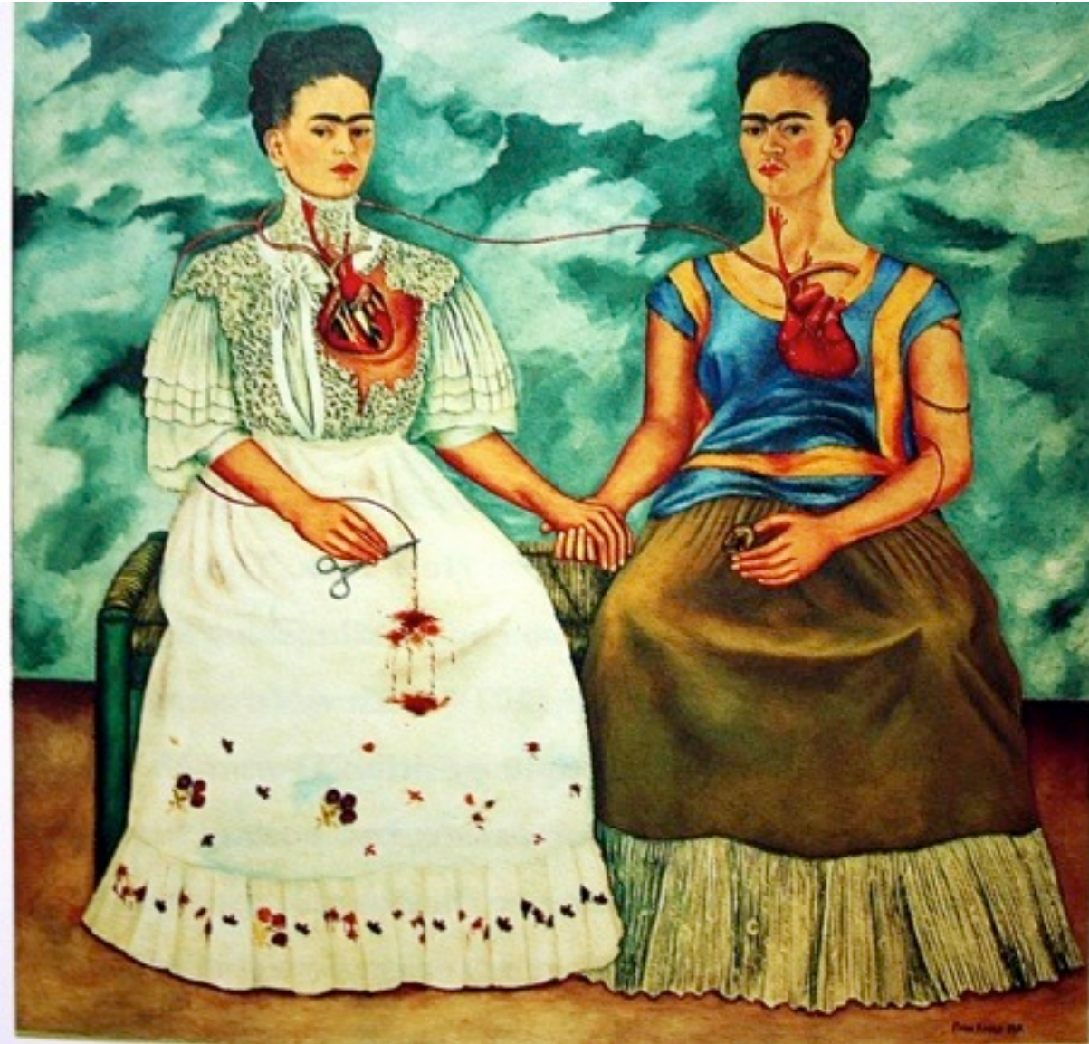
Frida Kahlo - "The Two Fridas", 1939.