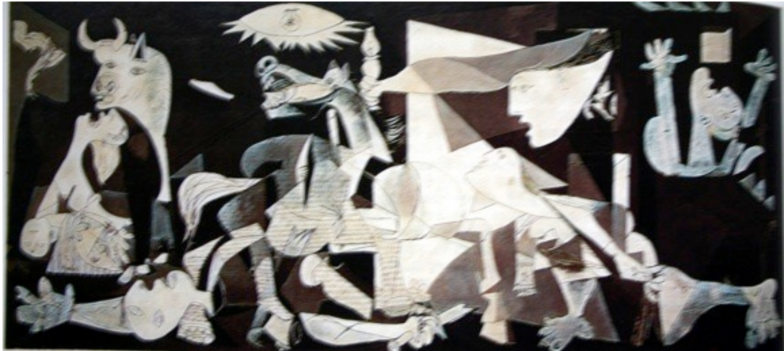
Pablo Picasso - "Guernica", 1937.