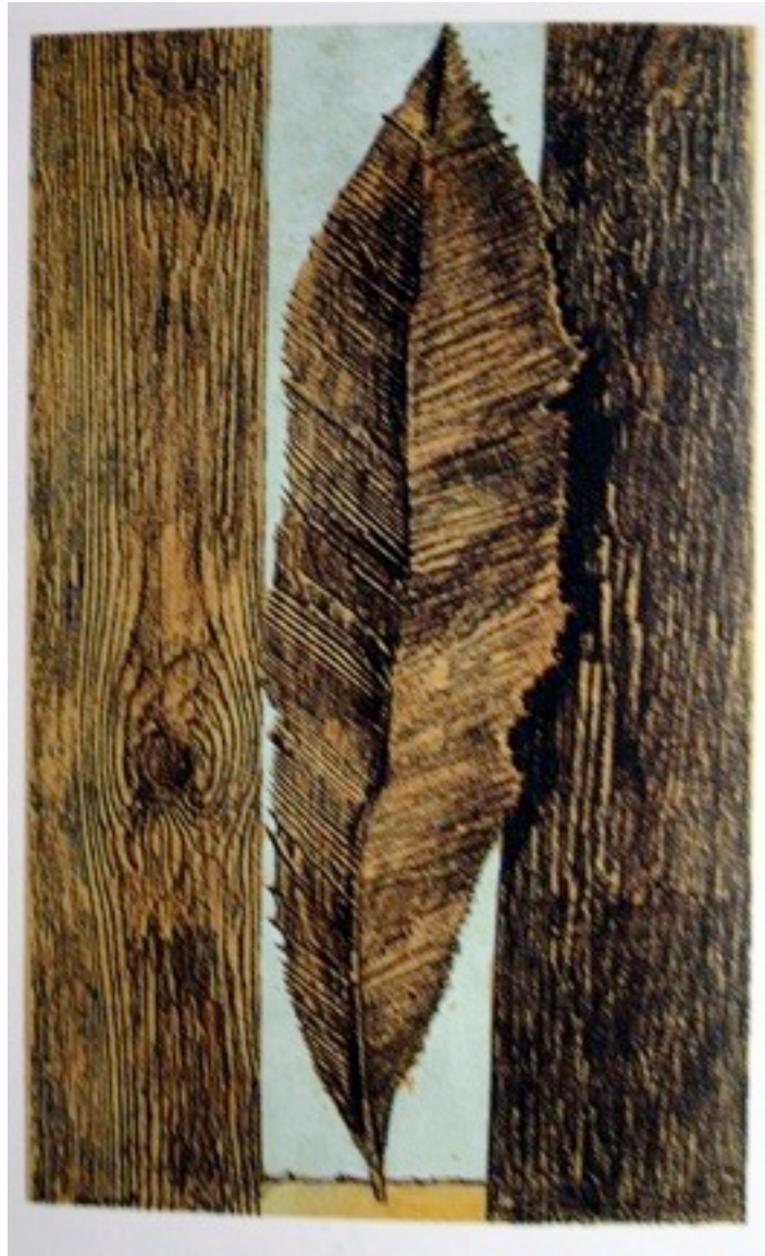
Max Ernst - "The Habit of Leaves", 1929.