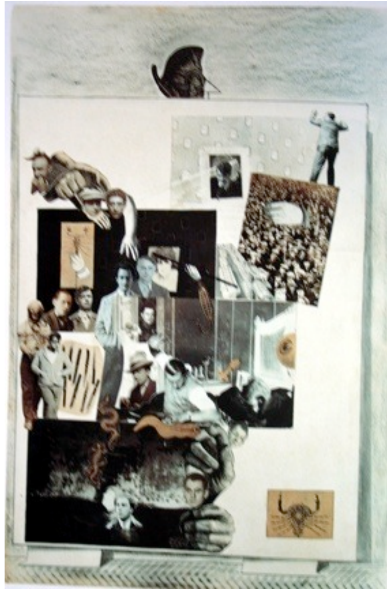
Max Ernst - "Loplop Introduces Members of he Surrealist Group", 1931.