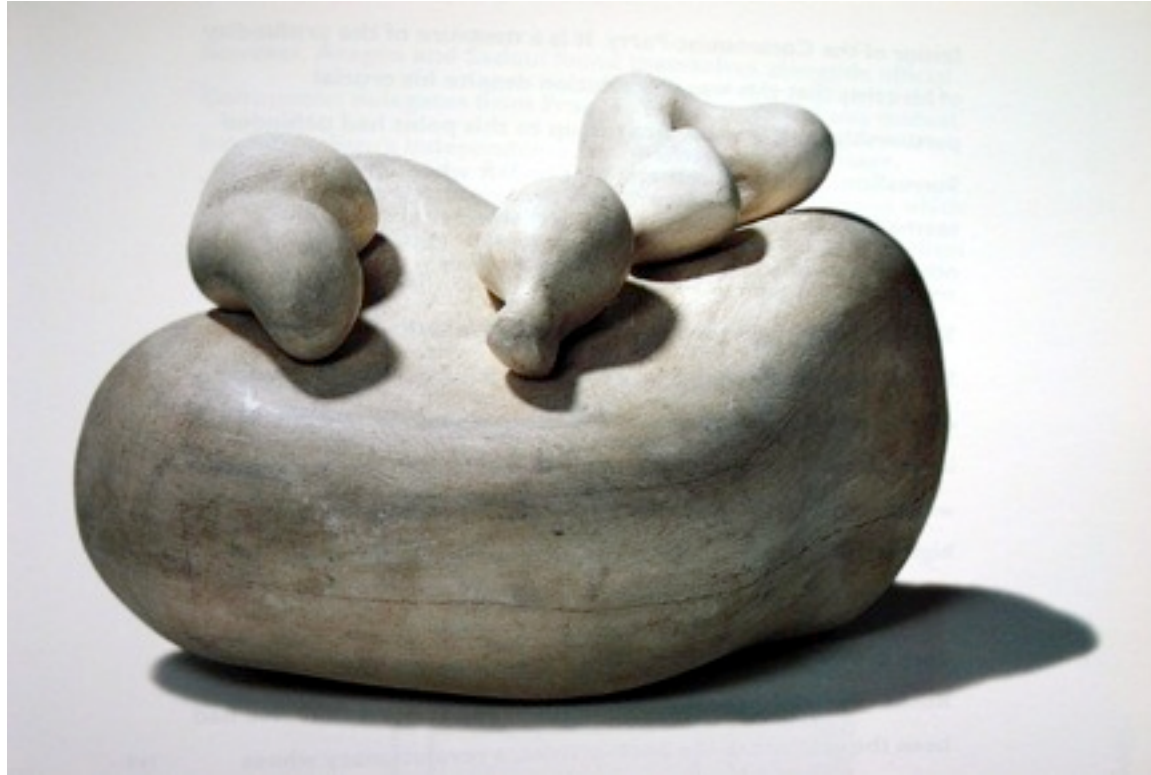
Hans Arp - "Head with annoying objects" 1930-2