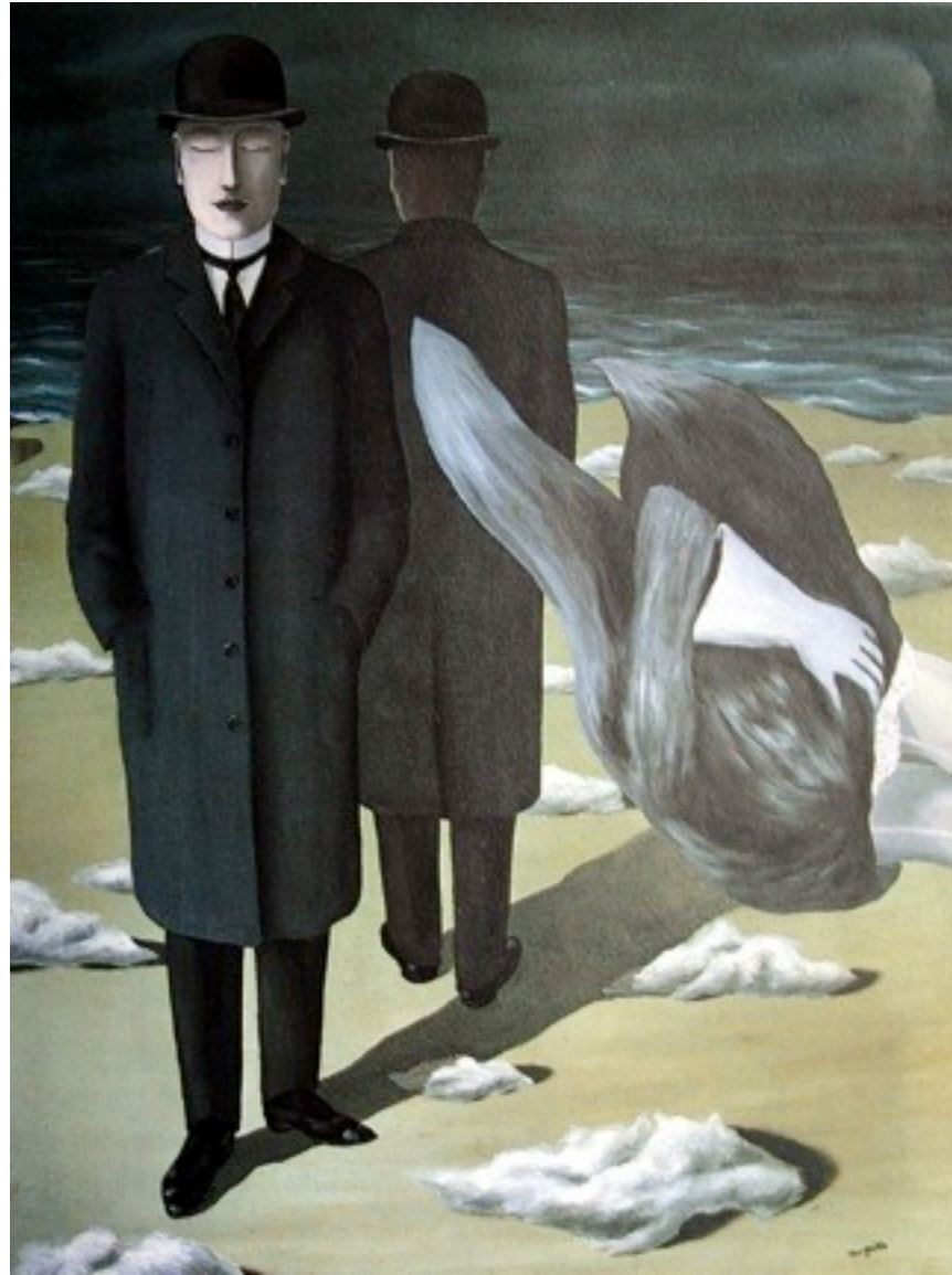
René Magritte - "The Meaning of Night", 1927.