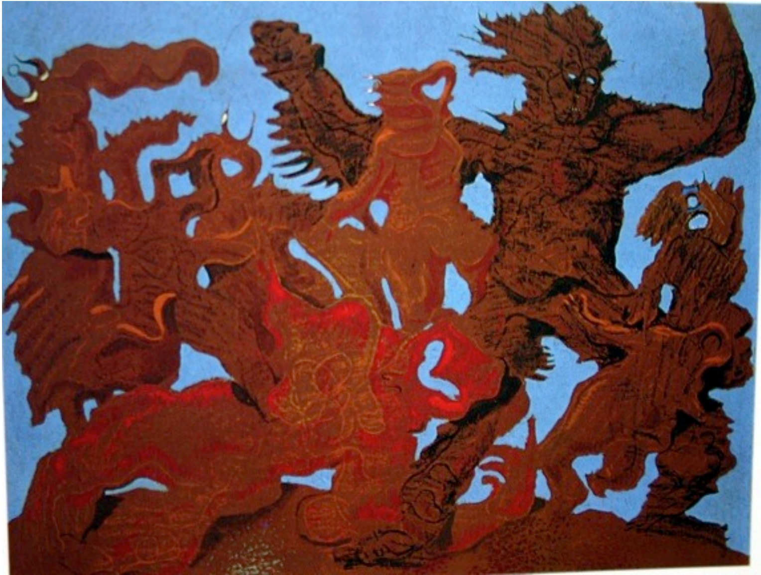
Max Ernst - "The Horde", 1927.