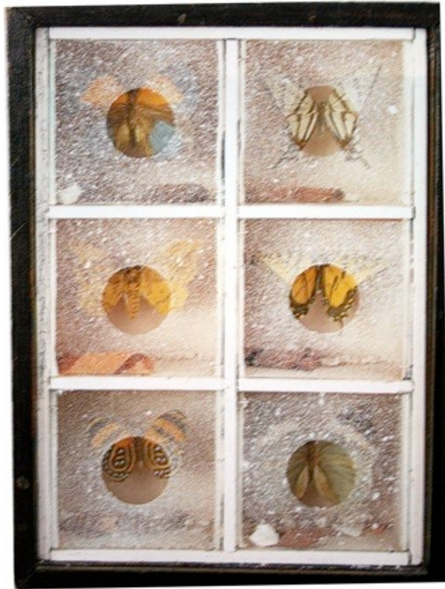
Joseph Cornell - "Butterfly Habitat", c.1940.