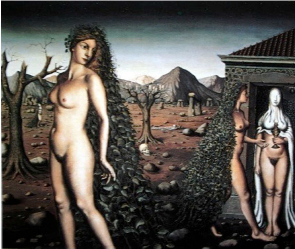
Paul Delvaux - "The Call of the Night", 1938