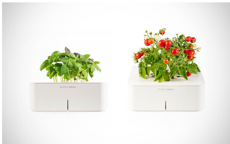
Click & Grow