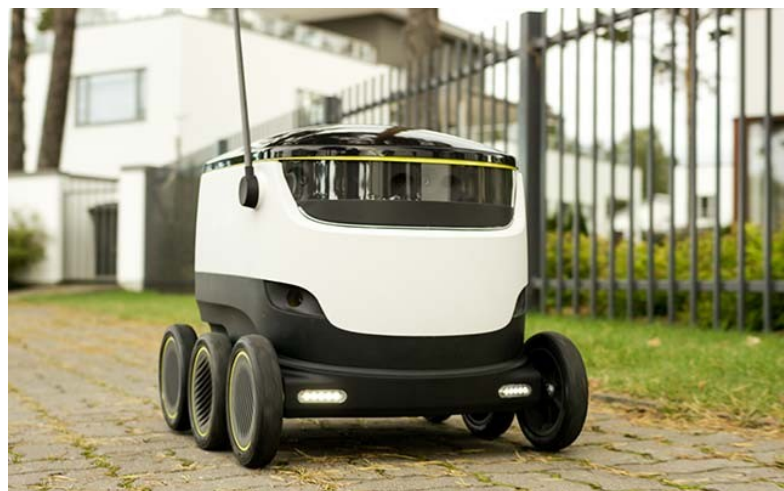
Starship – local delivery robot