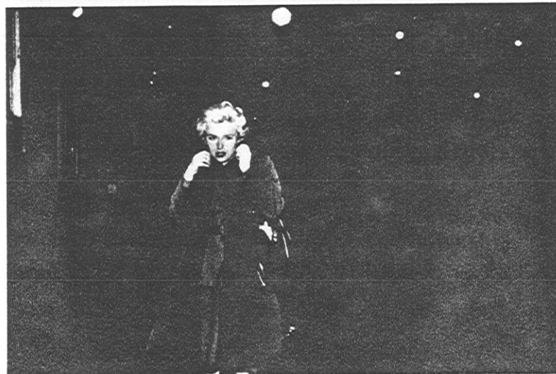
Cindy Sherman, Untitled Film Still , 1980.

her play-acting not also an acting out of the psychoanalytic notion of femininity as masquerade, that is, as a representation of male desire? As Hélène Cixous has written, "One is always in representation, and when a woman is asked to take place in this representation, she is, of course, asked to represent man's desire." 54 Indeed, Sherman's photographs themselves function as mirror-masks that reflect back at the viewer his own desire (and the spectator posited by this work is invariably male)—specifically, the masculine desire to fix the woman in a stable and stabilizing identity. But this is precisely what Sherman's work denies: for while her photographs are always self-portraits, in them the artist never appears to be the same, indeed, not even the same model; while we can presume to recognize the same person, we are forced at the same time to recognize a trembling around the edges of that identity. 55 In a subsequent series of works, Sherman abandoned the film-still format for that of the magazine centerfold, opening herself to charges that she was an accomplice in her own objectification, reinforcing the image of the woman bound by the frame. 56 This may be true; but while Sherman may pose as a pin-up, she still cannot be pinned down.