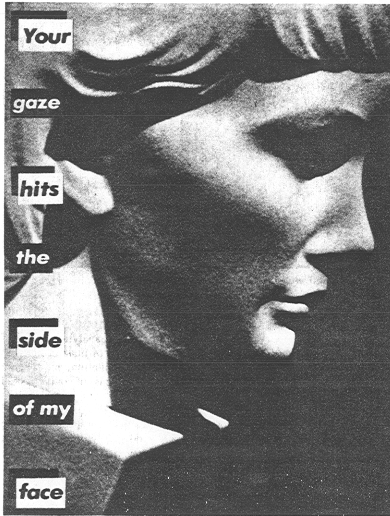
Barbara Kruger, 1981.

alienation of the gaze: both reify"? 57 Or is she not speaking instead of the masculinity of the look, the ways in which it objectifies and masters? Or when the words "You invest in the divinity of the masterpiece" appear over a blown-up detail of the creation scene from the Sistine ceiling, is she simply parodying our reverence for works of art, or is this not a commentary on artistic production as a contract between fathers and sons? The address of Kruger's work is always gender-specific; her point, however, is not that masculinity and femininity are fixed positions assigned in advance by the representational apparatus. Rather, Kruger uses a term with no fixed content, the linguistic shifter ("I/you"), in order to demonstrate that masculine and feminine themselves are not stable identities, but subject to ex-change.