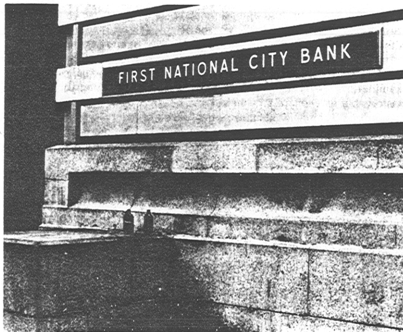
Above and right: Martha Rosler, The Bowery in Two Inadequate Descriptive Systems , 1974-75.

Postmodernist artists speak of impoverishment—but in a very different way. Sometimes the postmodernist work testifies to a deliberate refusal of mastery, for example, Martha Rosler's The Bowery in Two Inadequate Descriptive Systems (1974-75), in which photographs of Bowery storefronts alternate with clusters of typewritten words signifying inebriety. Although her photographs are intentionally flat-footed, Rosler's refusal of mastery in this work is more than technical. On the one hand, she denies the caption/text its conventional function of supplying the image with something it lacks; instead, her juxtaposition of two representational systems, visual and verbal, is calculated (as the title suggests) to "undermine" rather than "underline" the truth value of each. 36 More importantly, Rosler has refused to photograph the inhabitants of Skid Row, to speak on their behalf, to illuminate them from a safe distance (photography as social work in the tradition of Jacob Riis). For "concerned" or what Rosler calls "victim" photography overlooks the constitutive role of its own activity, which is held