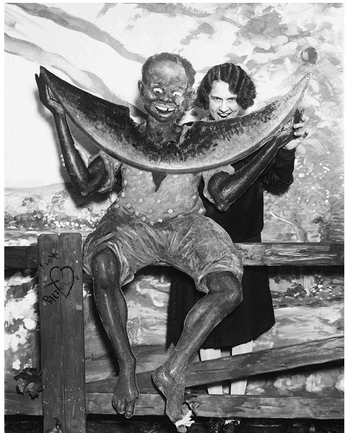
Figure 1. A woman poses with caricature at the Hotel Exposition in New York's Grand Central Palace, circa 1930.