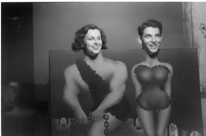
Figure 8. Arcade photograph, mid-twentieth century. A woman and man play at gender transgression. Author's collection

imply one. Take, for example, a cutout scene of Tarzan and Jane. A dating couple, strolling on a boardwalk, pauses to have a snapshot taken: a man inserts his head in the hole above Tarzan's muscle-bound body, and a woman substitutes her face for that of the scantily clad Jane (fig. 7). A second couple encounters the same scene and conceives an apparently creative transgression: she floats her head above the ape-man's body, and he, grinning for the camera, plays Jane (fig. 8). In this example, the gender-normative and gender-transgressive performances are both scripted by the thing (much as weeping and laughing are both scripted by Little Nell's or Eva's death). An appeal of the Tarzan/Jane cutout is that its constraints allow for a temporary, Bakhtinian inversion that reinforces rather than undermines existing configurations of power. 43