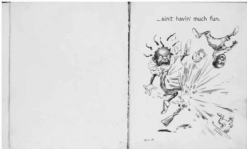
Figure 3. E. W. Kemble, A Coon Alphabet (New York and London: Russell, 1898), n.p. Beinecke Rare Book and Manuscript Library, Yale University

with the perpetration of violence against African American characters, to substitute satisfaction at a completed rhyme for any other emotion one might feel while participating in violence—and to repeat that sequence twenty-four times.