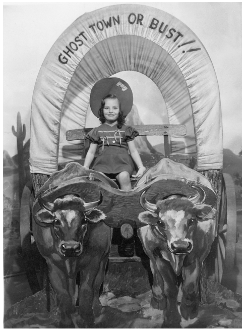
Figure 4. Arcade photograph, mid-twentieth century. A girl performs a fantasy of regional America.

tral Palace in approximately 1930, one light-skinned woman stood behind it and pretended to enter the scene and interact with a figure while posing for the camera. This gesture is a twice-behaved behavior that recapitulates other occasions in which humans interact with inanimates for the purpose of snapping a photograph: wax museums, life-sized photographic cutout figures of celebrities or politicians, and, especially in the mid-twentieth century, arcade novelties in which people insert their bodies into wooden scenes. 35 In one such arcade scene (fig. 4), a girl enters a fantasy of regional America by posing in a covered wagon with wooden oxen