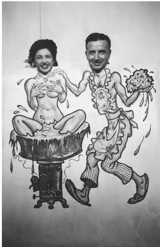
Figure 6. Arcade photograph, mid-twentieth century. A woman and man insert their heads into a risqué scene.

artificial stream “liberally stocked” with live trout. For fifty cents, one could rent a pole, fish for ten minutes, and take home whatever one caught (“a tagging machine was in operation, so that the fish might be taken anywhere without the owner running afoul of the New York State Game Commission”). 40 Visitors sampled produce, rode electric hobbyhorses, played mechanical golf games, threw suction darts, tossed bottles into automatic glass smashers, and stuck their fingers into the hose of a vacuum cleaner to assess its strength. 41 By 1937, visitors had come to expect physical interaction with the displays, forcing exhibitors to post Hands Off signs to mark non-interactive exhibits, such as confectionary sculptures prepared by master chefs. 42