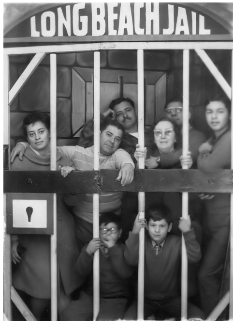
Figure 5. Arcade photograph, inscribed on verso “2-1-1970.” Eight people of varied ages pose in a set of the “Long Beach Jail.”

massive convention hall that occupied the city block between Lexington and Park avenues and Forty-sixth and Forty-seventh streets until it was demolished in 1964. Although the exposition was ostensibly for professionals in the hotel trade, it replicated many aspects of the arcades, boardwalks, and fairs that occasioned posed photographs in cutout scenery. Carnavalesque amusements at the Hotel Exposition attracted members of the public, often to the point that they outnumbered the professionals. In November 1929, for example, only three weeks after the stock market crashed, more than 100,000 people—most of them members of the public