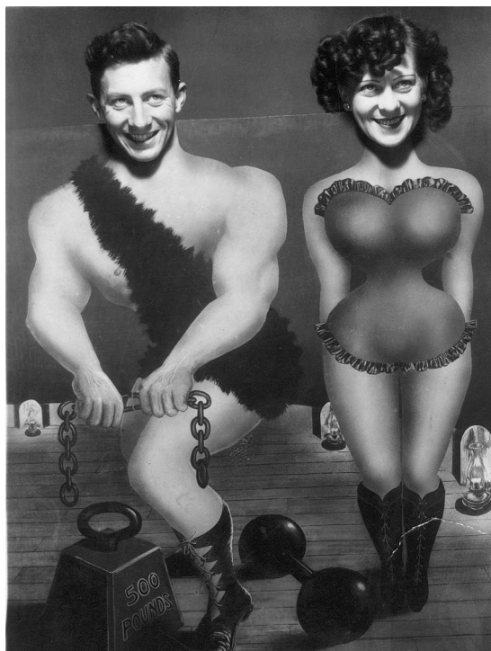
Figure 7. Arcade photograph, mid-twentieth century. A man and woman insert their heads above a cutout scene. The man poses as a primitivized, muscular man in an animal skin, while the woman poses as a bathing-suit-clad, curvy woman (a likely reference to Tarzan and Jane, or to “strong man” vaudeville acts). The scene includes depictions of what may be footlights, implying that the two characters are performing on stage. The primitivized man holds a chain but does not appear to be shackled.

of place, looks not like she just climbed over or through a fence that extends beyond the frame of the photograph but, rather, like she walked comfortably behind a delimited segment of scenery. Her pose is still, symmetrical, with no sense that she is about to bolt if she gets caught where she does not belong. The woman’s absence of tension or apprehension manifests itself especially clearly in her left hand, which grasps the caricature’s hand gently: her pinkie floats as elegantly as that of a duchess holding a teacup. The caricature’s scale is distorted, yet it conforms generally to the scale of a human body; the thing is neither two feet tall nor twelve. Indeed, the limited distortion aligns the caricature with other cutouts, as in figure 6, where the aproned man’s elongated legs are out of scale to both the human poser and the woman in the bath. The “watermelon” woman’s mischievous smile suggests transgression—an intimation, perhaps, that she ignored a Hands Off sign and inserted her body where it was not permitted. However, many cutouts built mischief into their scenes, as in “jails” or the risqué “bathing” image. The sense of naughtiness in the jail, bath, or watermelon photographs derives from the outlaw, sexual, or racial content of the scenarios, not the act of stepping into the scene.