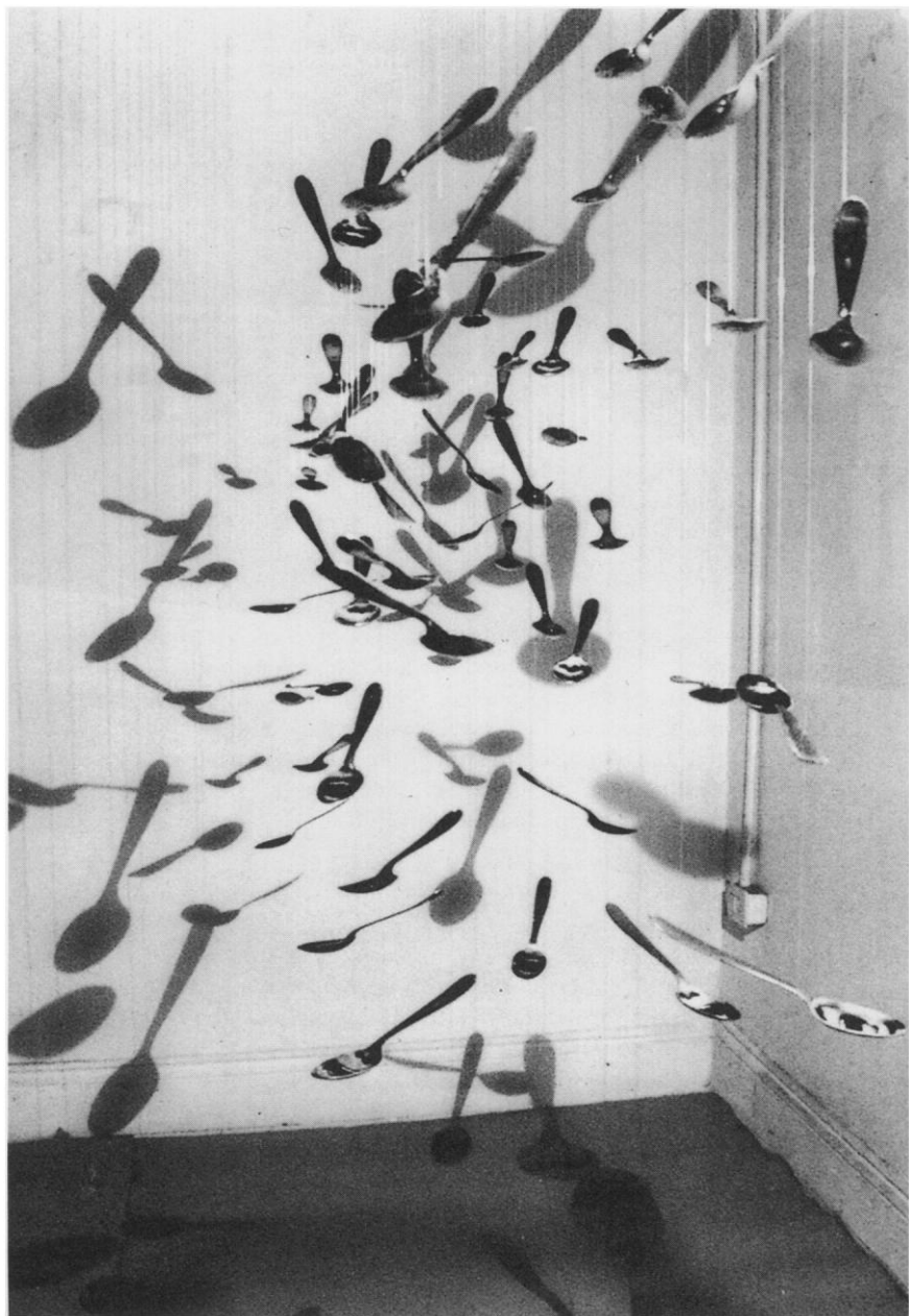
Graciela Sacco. From the series Bocanada Instalación: 100 cucharas colgando , Basel, 2000. From Graciela Sacco (Buenos Aires, 2001).