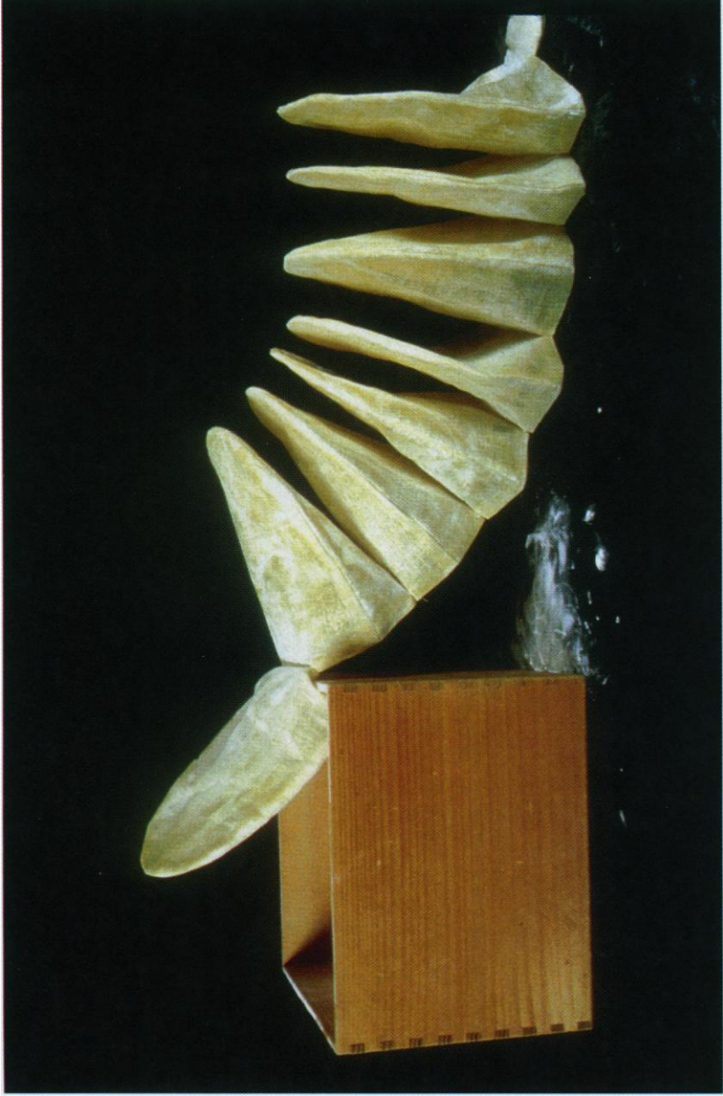
Kyle Huffman, Mask 1 , 1996. Wood, gauze, shellac, corn starch.