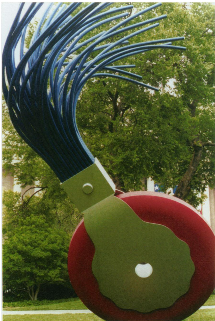
Claes Oldenburg, Typewriter Eraser , 1999. Washington, D.C.