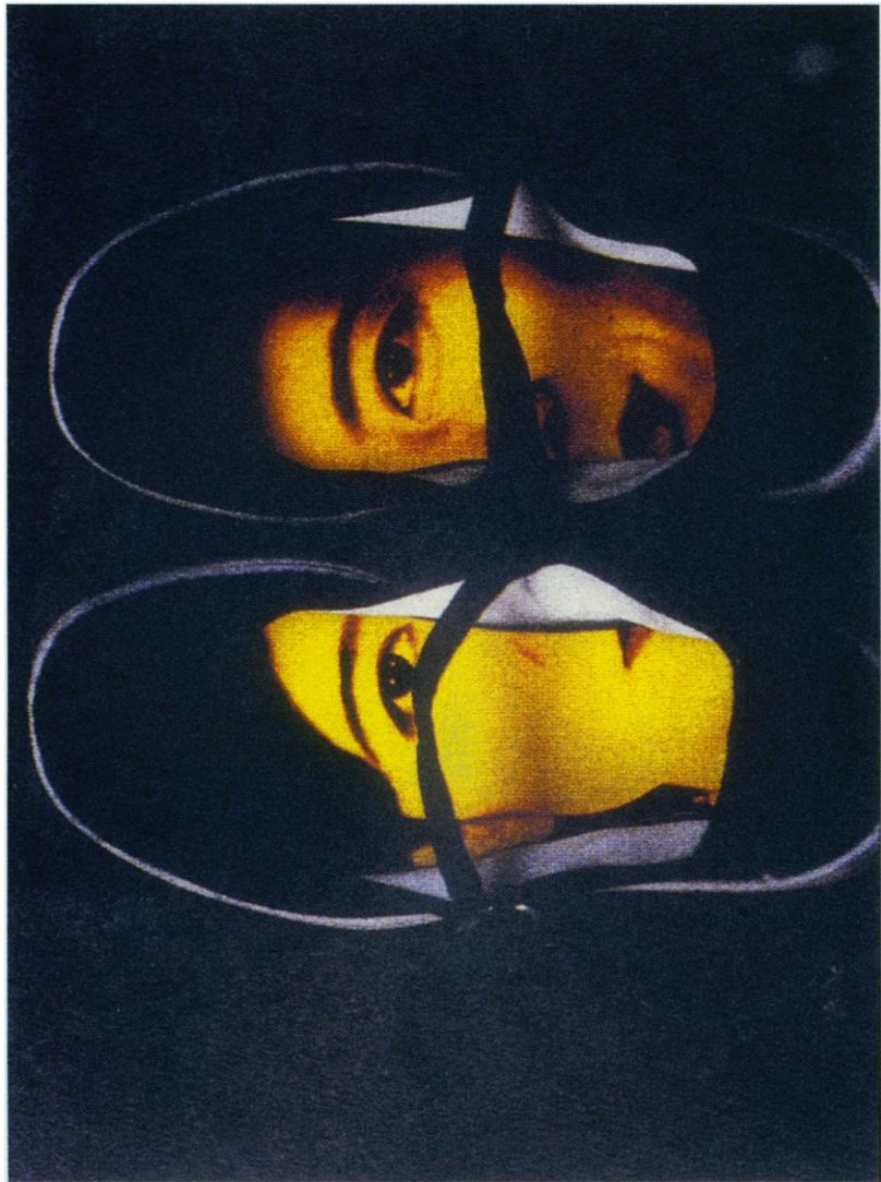
Yin Xiuzhen, Yin Xiuzhen , 1998. Mixed media.