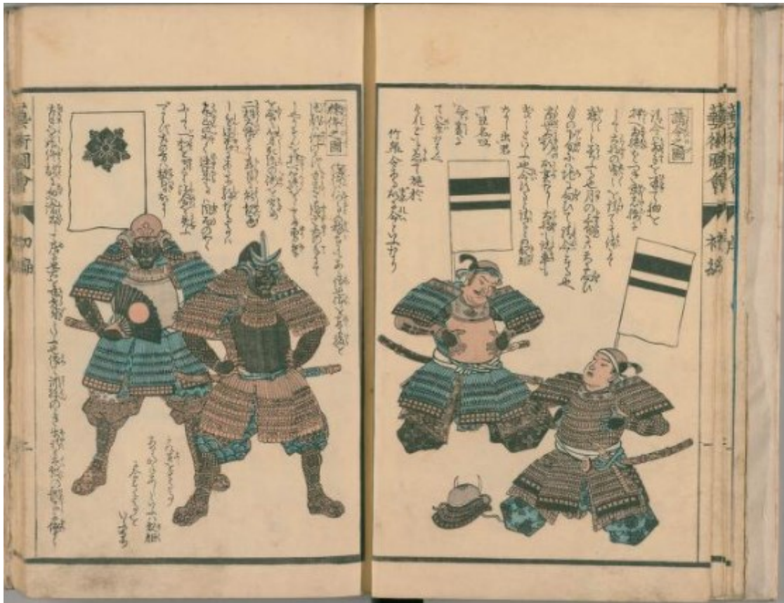
Figure 3 Budō Geijutsu Hiden Zue , Shohen (vol.1, backside of sheet1)

The first sentence of the description says, “When you respond to an order, you say ‘Ow, ow’ with opened palm on your chest and both your knees on the ground after your lord says ‘Ei, ei.’” And the rest of the description is all about more detailed manners.