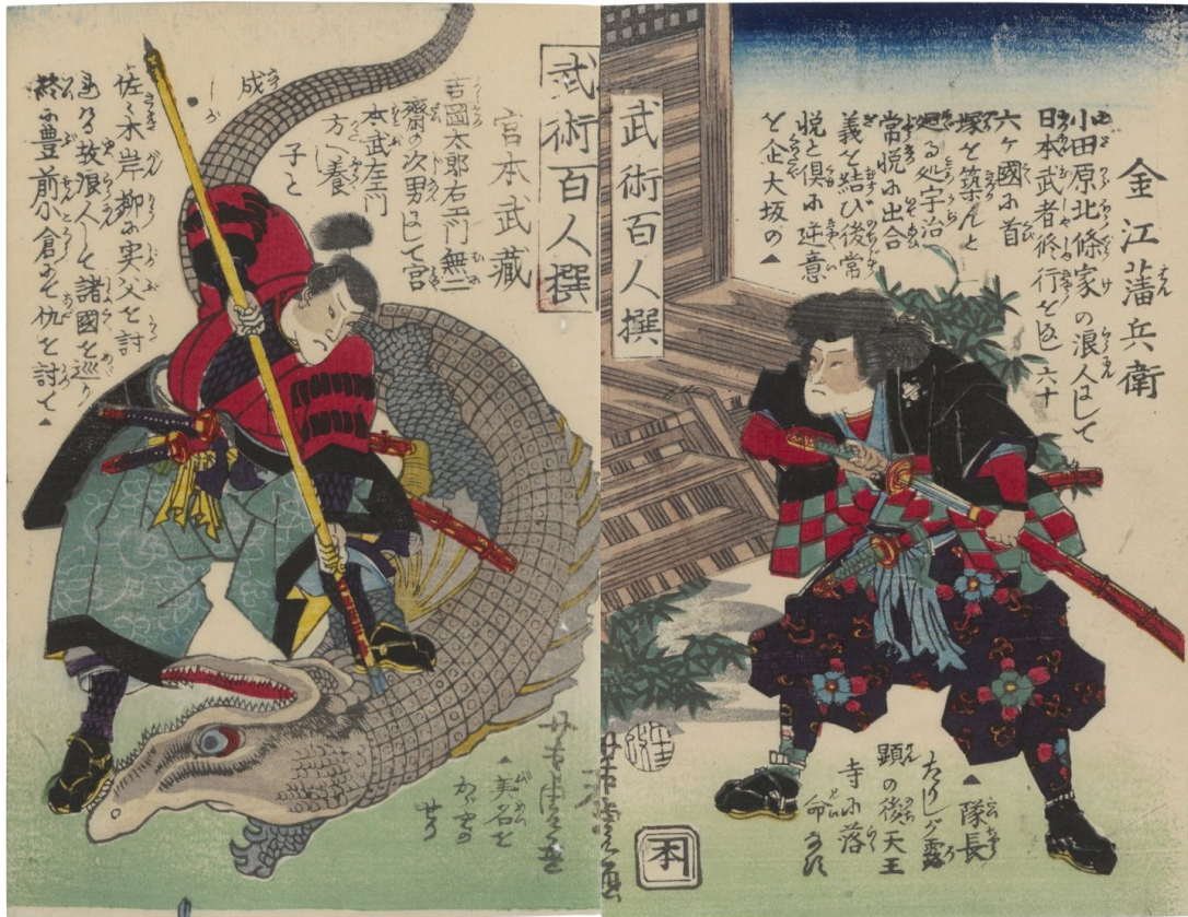
Figure 6 Bujutsu Hyaku Yu-sen (7/12)

On the left page, it illustrates the famous Miyamoto Musashi. (In the illustration, he is fighting with a crocodile, but it doesn't correspond at all with the narrative which tells short Miyamoto's biography, like who was his father and referred his rival, Sasaki Gabryu.)