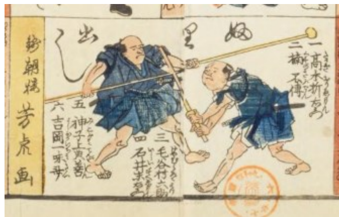
Figure 8 Starting frame of Bugei Tatsujin Sugoroku

You start as a beginner of martial arts (in the lower center, Figure 8) and head to the goal (in the upper center, describing a martial arts dōjō on New Year's Day.) passing by the frames as your dice tells. Each frame has a different great master of martial arts (Miyamoto Musashi is also in the right of the goal (Figure 9)).