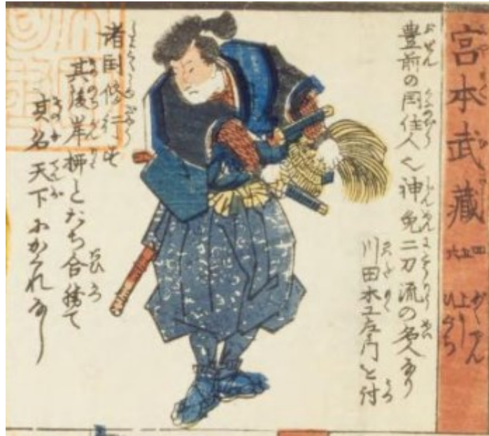
Figure 9 Miyamoto Musashi in Bugei Tatsujin Sugoroku

So, now we know from the examples that the meaning of the word Budō had changed, and originally martial arts are just one of the things required to keep Budō, the way of the good samurai.