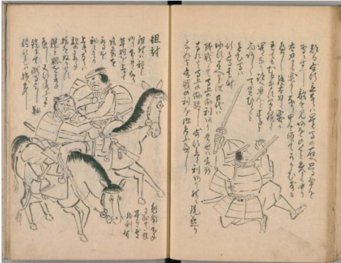
Figure 5 Budō Geijutsu Hiden Zue , Shohen (vol.3, 30/41 on the website)

As we went over the book, Budō had more broad meanings like “how to behave correctly as a good samurai” and the usage as Japanese martial arts was nothing more than a part of it originally.