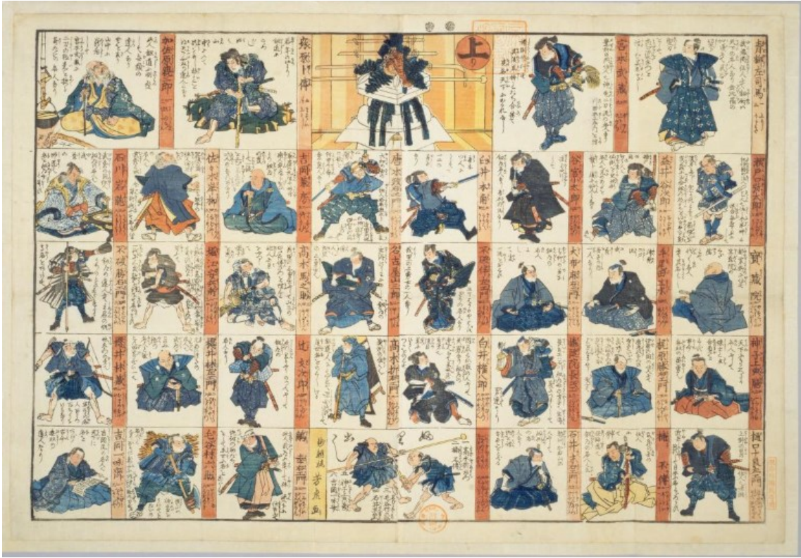
Figure 7 Bugei Tatsujin Sugoroku

Backgammons were played on New Year's Day in Edo period.