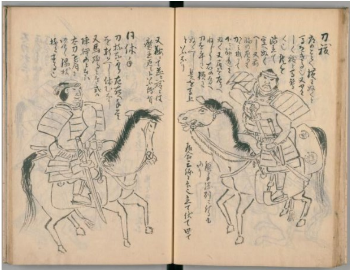
Figure 4 Figure 3 Budō Geijutsu Hiden Zue , Shohen (vol.3, 23/41 on the website)