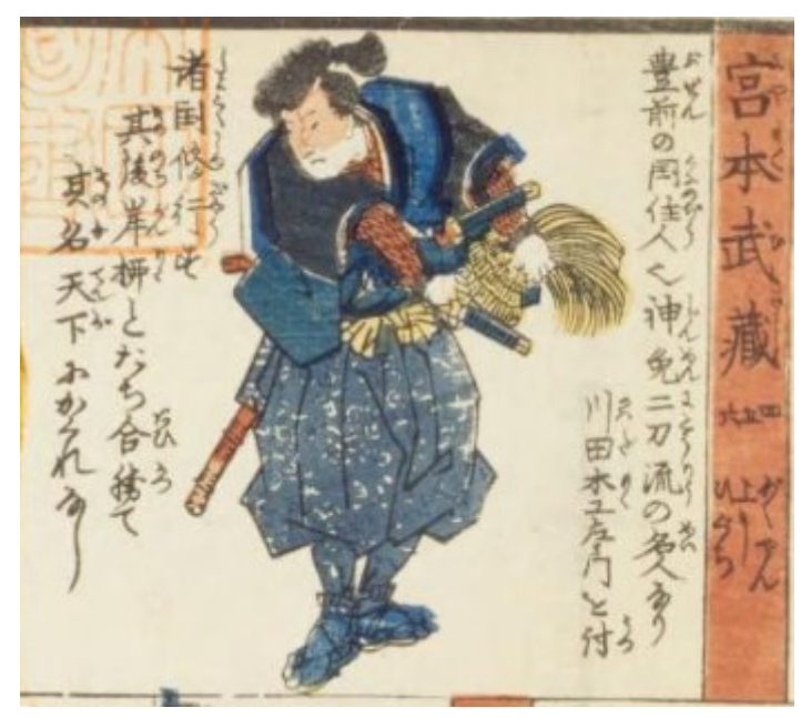
Figure 9 Miyamoto Musashi in Bugei Tatsujin Sugoroku

So, now we know from the examples that the meaning of the word Budō had changed, and originally martial arts are just one of the things required to keep Budō, the way of the good samurai.