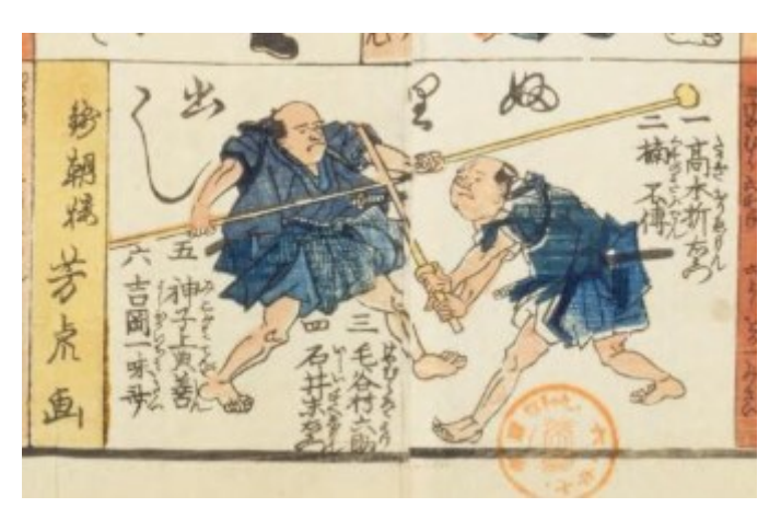
Figure 8 Starting frame of Bugei Tatsujin Sugoroku The characters are practicing with a wooden sword and a wooden spear.

You start as a beginner of martial arts (in the lower center, Figure 8) and head to the goal (in the upper center, describing a martial arts dōjō on New Year's Day.) passing by the frames as your dice tells. Each frame has a different great master of martial arts (Miyamoto Musashi is also in the right of the goal (Figure 9)).