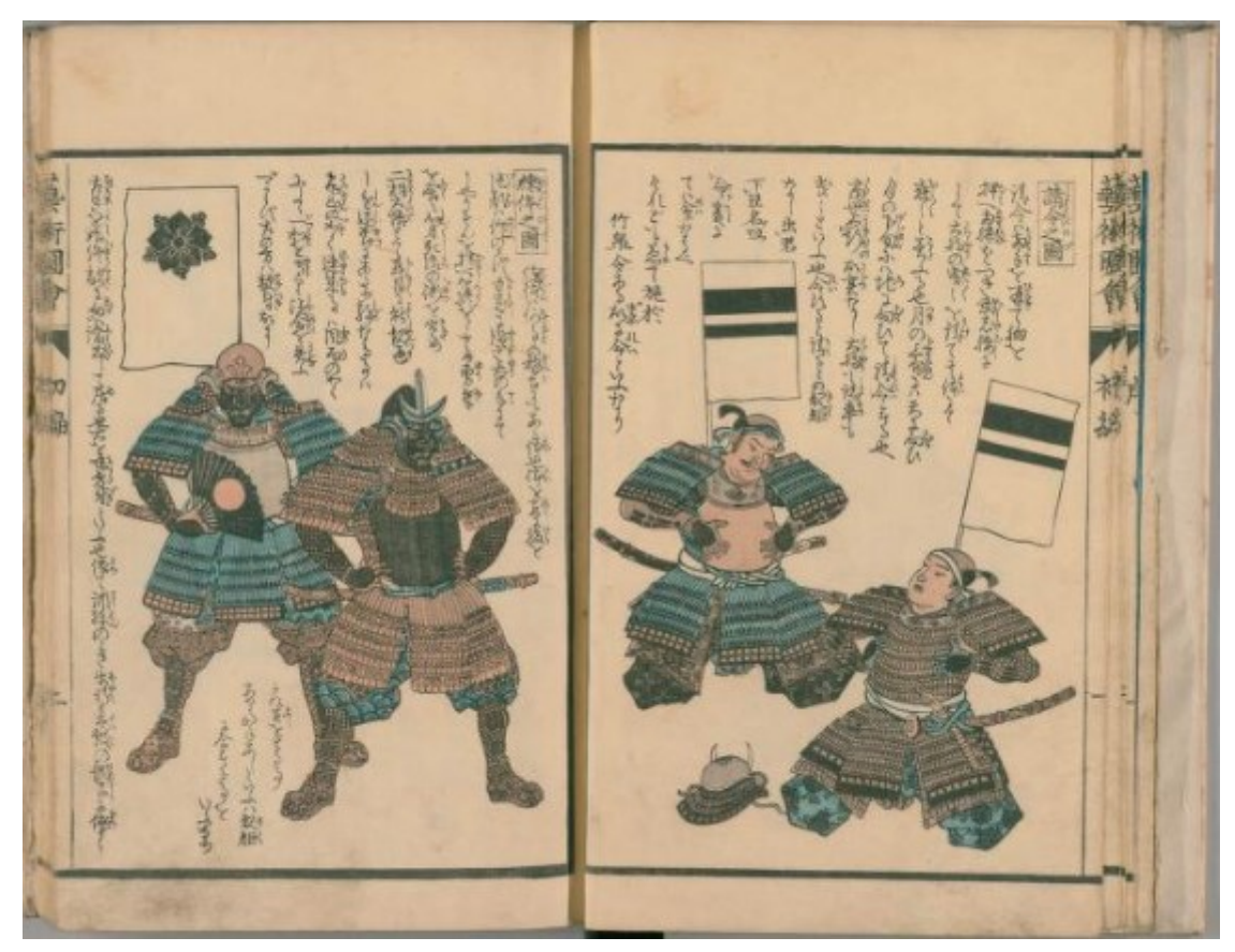
Figure 3 Budo Geijutsu Hiden Zue, Shohen (vol.1, backside of sheet1)

The first sentence of the description says, "When you respond to an order, you say 'Ow, ow' with opened palm on your chest and both your knees on the ground after your lord says 'Ei, ei'." And the rest of the description is all about more detailed manners.