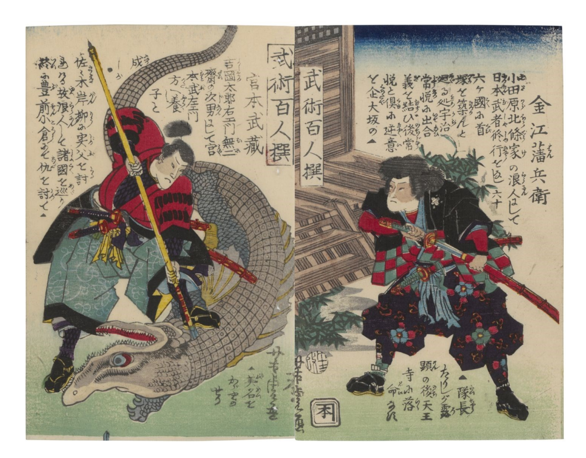
Figure 6 Bujutsu Hyaku Yu-sen (7/12)

On the left page, it illustrates the famous Miyamoto Musashi. (In the illustration, he is fighting with a crocodile, but it doesn't correspondent at all with the narrative which tells short Miyamoto's biography, like who was his father and referred his rival, Sasaki Gabryu.)