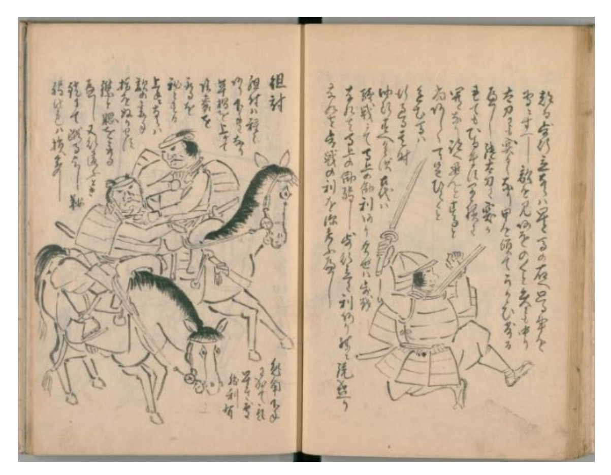
Figure 5 Budō Geijutsu Hiden Zue, Shohen (vol.3, 30/41 on the website)

As we went over the book, Budō had more broad meanings like "how to behave correctly as a good samurai" and the usage as Japanese martial arts was nothing more than a part of it originally.