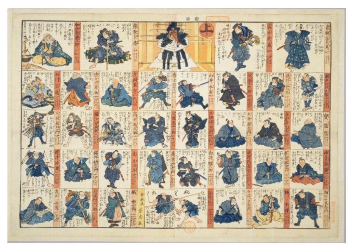
Figure 7 Bugei Tatsujin Sugoroku

Backgammons were played on New Year's Day in Edo period.