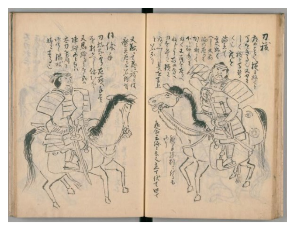
Figure 3 Budo Geijutsu Hiden Zue, Shohen (vol.3, 23/41 on the website)