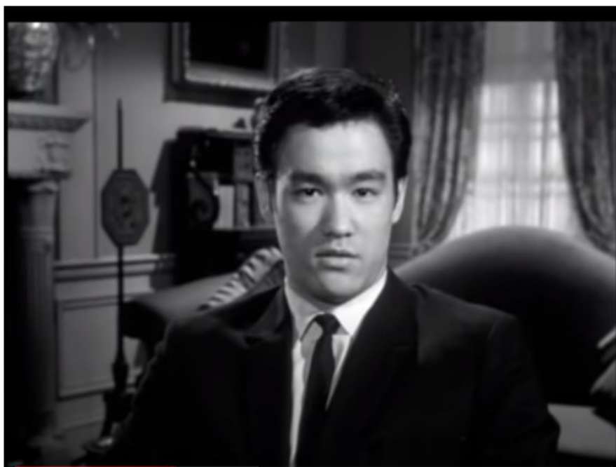
Figure 9 Bruce Lee’s film audition in 1965

In this section, we approach the international recognition from the history of Okinawan immigrants.