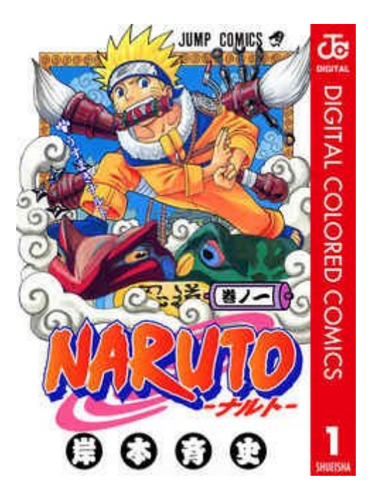
Figure 1 The cover of Naruto , vol.I (by Kishimoto Tadashi, (2000), Shueisha Publishing: Tokyo) Do you recognise the similarity between Figure 1 and some of the illustrations in Questionnaire 4.1?

Probably, the most popular Ninja character would be Naruto who knows how to use his chakra to make his doppelgangers and control a fire, water, and a soil, etc.