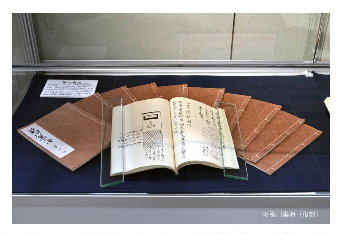
Figure 6 Appearance of the Ninja textbook Bansenshukai ( Ten Thousand Rivers Gathers to the Sea , 22vols.) written in 1676.

The book was even dedicated to the shogunate in 1789 which makes the knowledge public to the non-Ninja samurai.