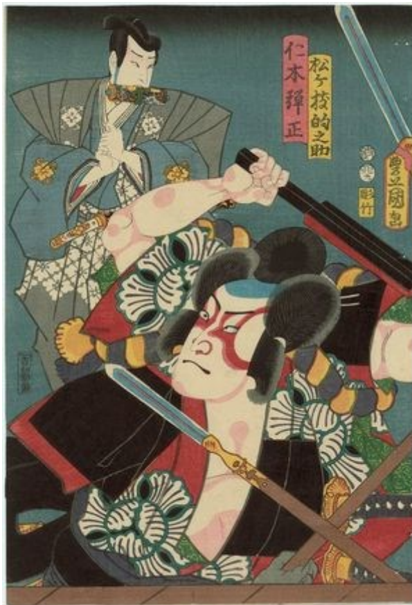
Figure 9 A man in the back is Nikki ( https://ja.ukiyo-e.org/image/mfa/sc165917 )

In many cases, he was depicted with a hand-scroll, a symbolic finger sign, and with a rat.