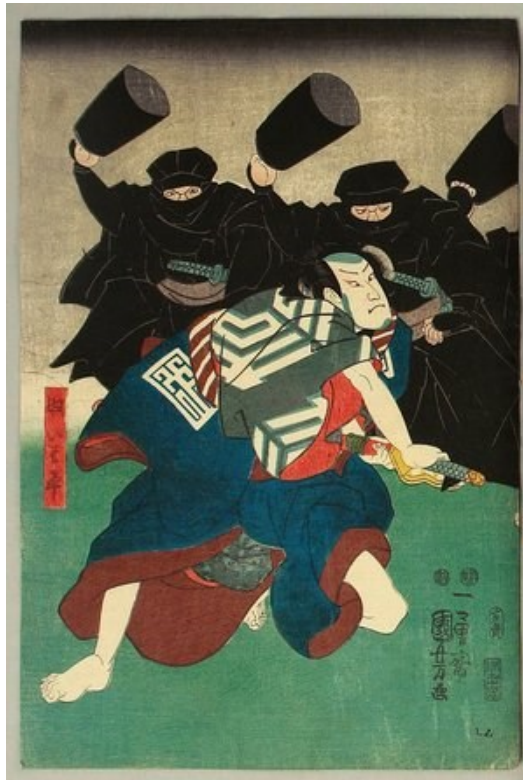
Figure 8 A scene from the kabuki stage of Tenjiku Tokubei (1851-1853) ( https://ja.ukiyo-e.org/image/artelino/40372g1 )