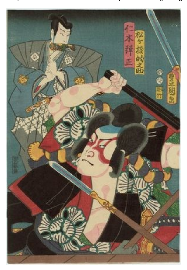
Figure 9 A man in the back is Nikki

In many cases, he was depicted with a hand-scroll, a symbolic finger sign, and with a rat.