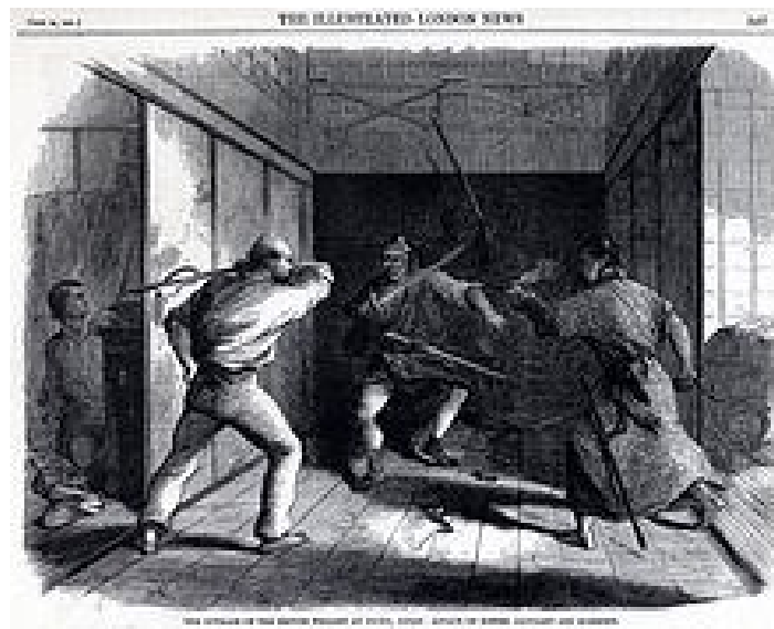
Figure 9 Image of an attack of Samurai party on British Legation in Edo (now Tokyo) in 1861 published on London Illustrated News on October 12, 1861.

There were many incidents that foreigners got severely injured or assassinated by a party of anti-foreign Samurai with Katana in the 1850-1860s.