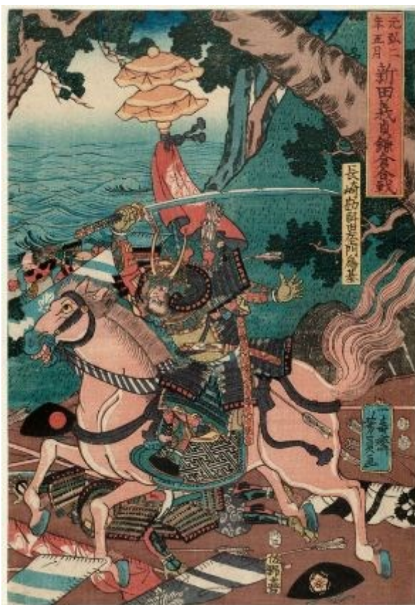
Figure 7 Image of a warlord in the 14 th century Nitta Yoshisada by Utagawa Yoshikazu in 1853. The length of his Katana looks equal to his height. But he was a person who realized the effectiveness of shorter swords (which equals to normal-length swords in later) in guerrilla tactics.

It was around the 10 th century when the curved single-edged swords which were suitable for mounted combat started to be forged. The length of hilt and blades was much longer and the weight was much heavier to take advantage of the height and speed of horses.