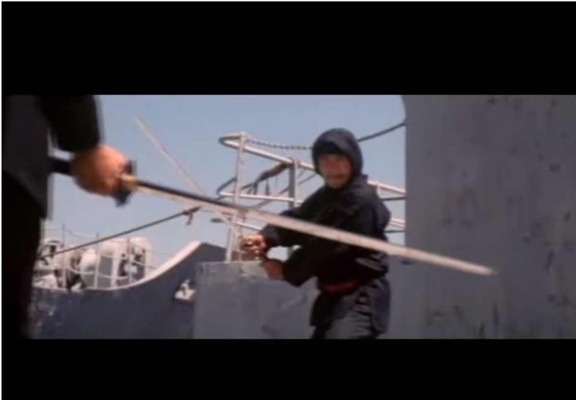
Figure 10 A scene from Killer Elite (1975)

Thus, Ninja who uses acrobatic martial arts, shuriken, and swords slowly became their favourite subject in the 1970s.