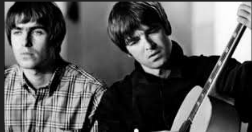
Liam & Noel Gallagher Manchester-born singers