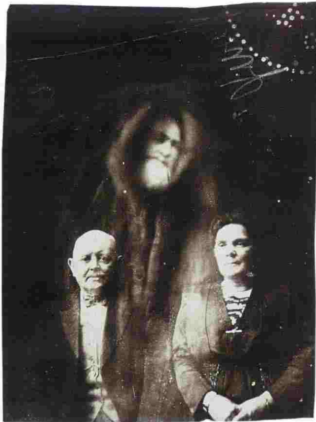
Anonymous spirit photograph, no date. Gelatin silver print. 5¼ x 3½ in. (13.3 x 8.9 cm).

raphy was put to use. She wrote that "at this point, in our turn, we are realizing the immense impact of photography, the way it has shaped our sensibilities without our quite knowing it, the way, for example, the whole of the visual arts is now engaged in strategies that are deeply structured by the photographic." 1 My investigation of spirit photography relies as well on Tom Gunning's 1995 groundbreaking essay "Phantom Images and Modern Manifestations: Spirit Photography, Magic Theater, Trick Films, and Photography's Uncanny," in which he brought the most sophisticated tools of contemporary critical analysis to bear on nineteenth- and early-twentieth-century spirit photography. Here I want to review the way that spirit photography functions within the history of photography and then highlight a number of points by Krauss and Gunning that seem pertinent for