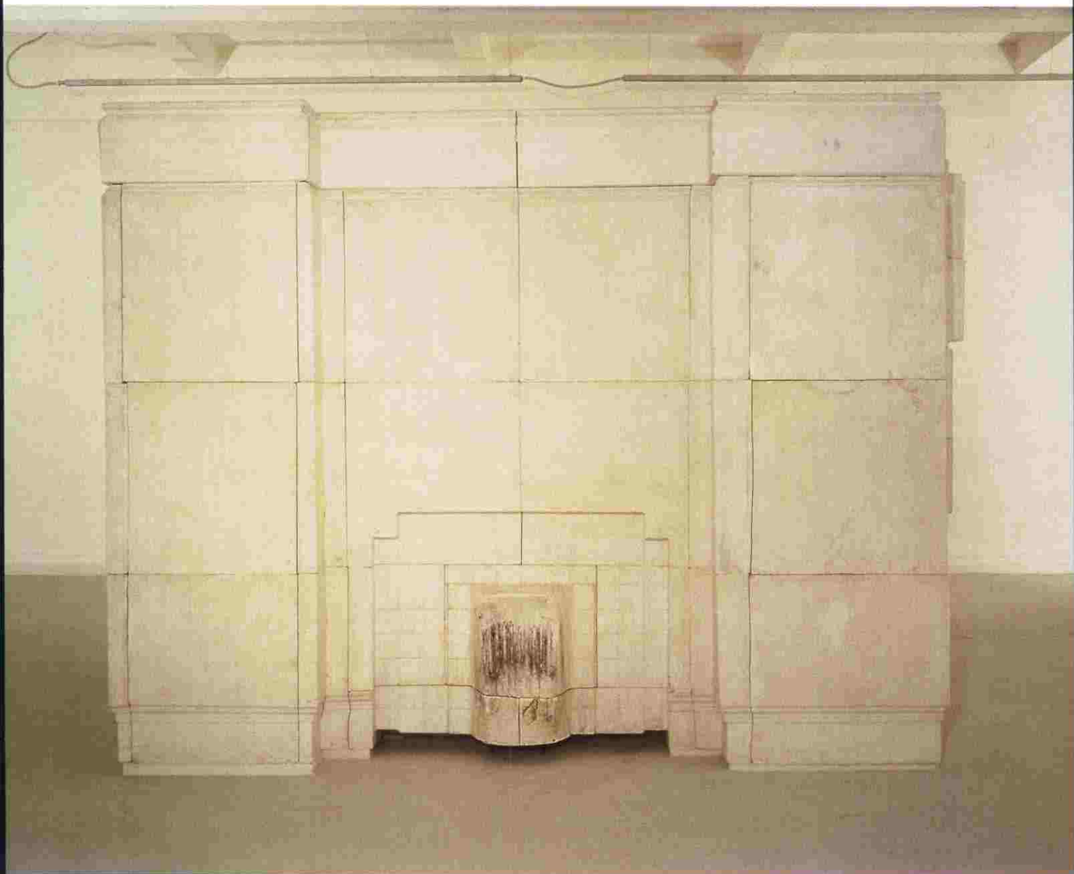
Rachel Whiteread. Ghost , 1989. Plaster on steel frame. 8 ft. 10 in. x 10 ft. 5 in. x 11 ft. 8 in. (269.2 x 317.5 x 355.6 cm).