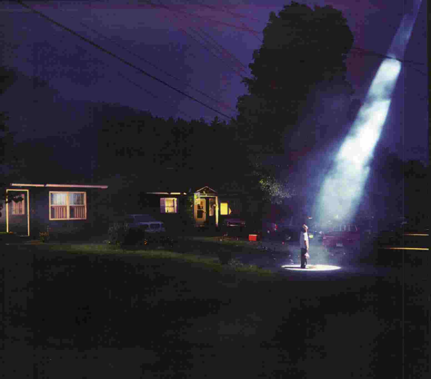
Gregory Crewdson. Untitled (Beer Dream) , 1998. C-print. 50 x 60 in. (127 x 152.4 cm).