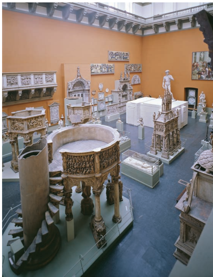
57. Installation view of Untitled (Room 101) at the V. & A. 2003.

Whiteread was ambivalent about the title from the outset and 'wondered whether to call it "Room 101" at all'. 49 She avoided using materials and surface effects to suggest the ominous connotations that attend Orwell's description of Room 101. The supposed connection to Orwell, however, held an irresistible allure for the institutions associated with the project. The display text in the Cast Court described the sculpture as 'an imprint of the office George Orwell was said to have occupied at the BBC during the Second World War'. 50 After Peter Davison wrote to the V. & A. in response to Richard Cork's review in The Times and set out the case against that account, 51 there was some discussion of alternative wording such as '... the office that George Orwell was once thought to have used at the BBC'. 52 The more tenuous the connection, the greater the need to qualify the relationship between truth and legend.