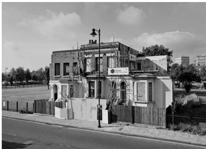
53. 193 Grove Road, London E3, prior to the casting of House . 1993.