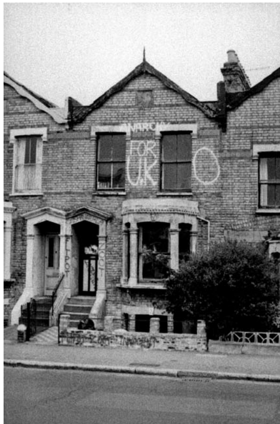
51. 486 Archway Road, London N6. c.1979.

By the time Whiteread cast Room 101 at Broadcasting House, her approach had changed significantly. Some of the reasons for this were practical, including the need for greater resilience and stability than was possessed by the 'naively made and put