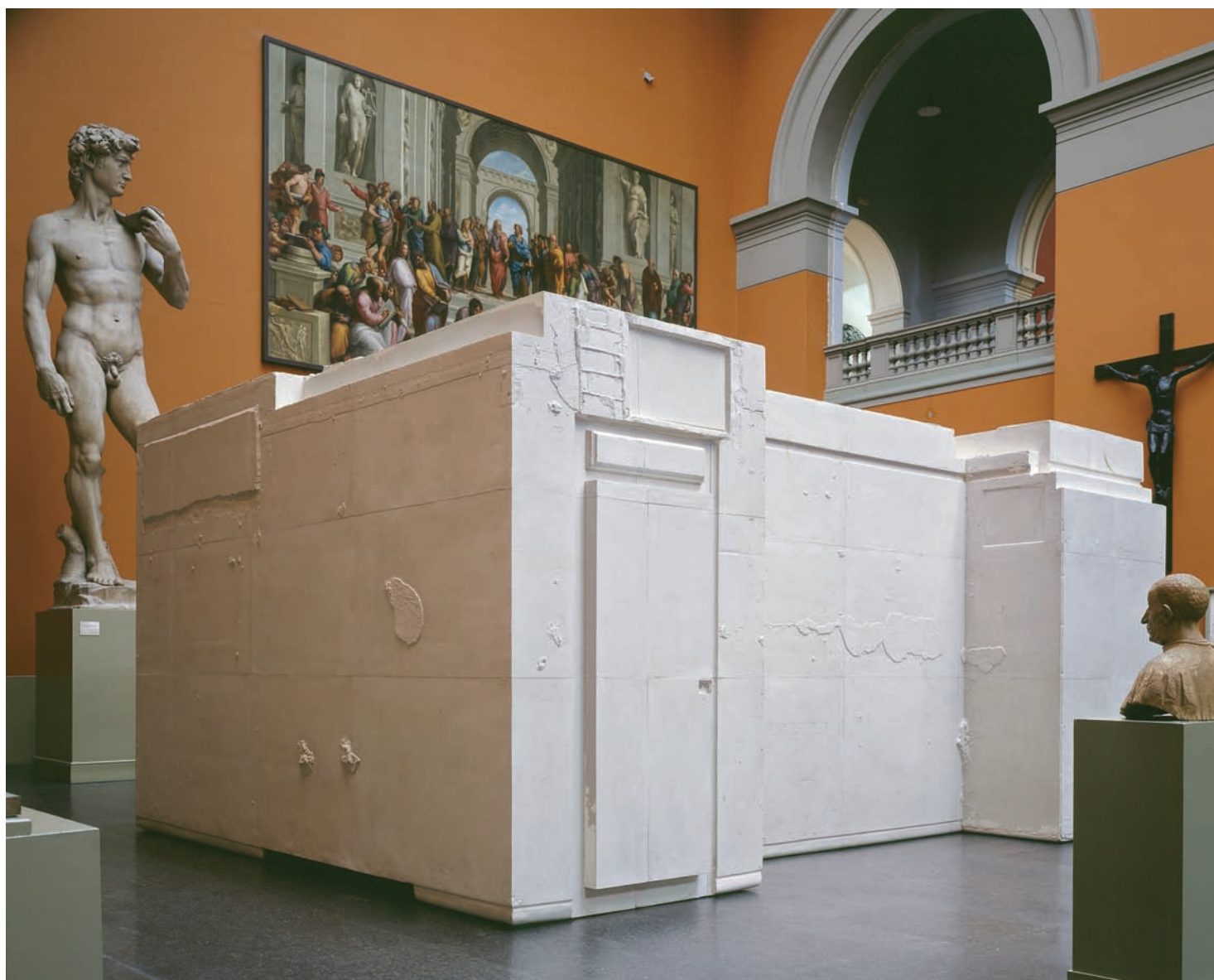
46. Untitled (Room 101) , by Rachel Whiteread. 2003. Jesmonite and mixed media, 300 by 500 by 643 cm. (Centre Georges Pompidou, Paris).

site', six commissioned responses to the history and redevelopment of Broadcasting House.