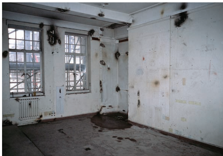
49. Interior of Room 101 at Broadcasting House prior to the casting of Untitled (Room 101) . 2003. (Photograph by Rachel Whiteread).