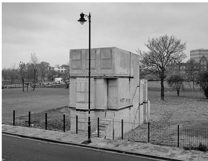
54. House , by Rachel Whiteread. 1993, demolished 1994. Concrete. (Photograph by John Davies).