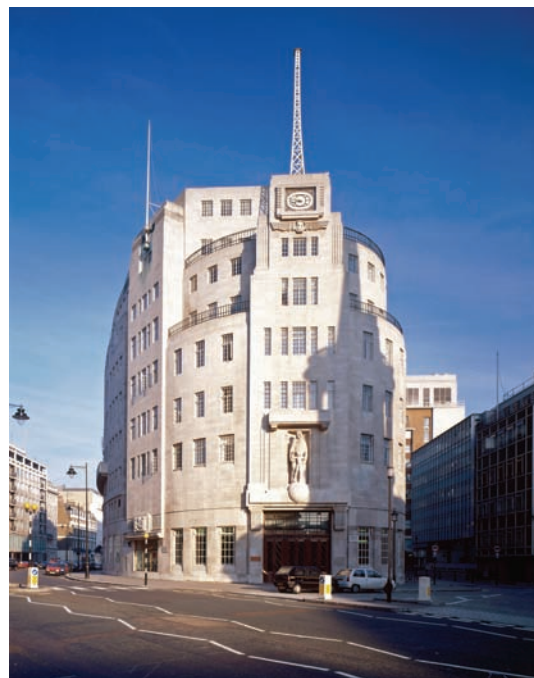
45. Broadcasting House, 2–22 Portland Place, London W1. 1932. Designed by George Val Myer and Francis James Watson-Hart.

The idea behind Untitled (Room 101) arose from a major redevelopment project involving Broadcasting House and its surroundings. The 'W1 Project', as it was known, reflected the aims of the BBC's 'three site strategy' to rationalise its activities and property portfolio in London. 2 By 2001, the BBC was operating out of twenty-three buildings spread across the city, each of which held its own conditions and restrictions – including heritage designations that severely limited changes to the buildings. Related to this were two long-standing operational problems: an inflexible technological infrastructure that could not be easily revised once in place; and boundaries that separated activities according to bureaucratic habit and obsolete requirements. At the heart of the 'W1 Project' was the intention to bring all the BBC's national and international news divisions to Broadcasting House, along with the World Service and national radio. 3 In November 2001 the BBC filed a planning application with Westminster City Council for the extensive refurbishment of Broadcasting House, and the redevelopment of surrounding land. Conditional approval followed in November 2002. 4 The first phase of the project – the refurbishment of Broadcasting House, the demolition of Egton House in Langham Street and