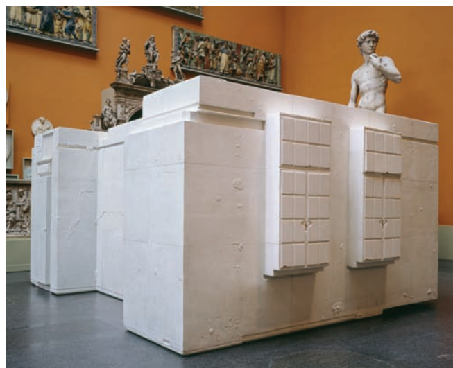
50. Installation view of Untitled (Room 101) in the Cast Courts of the Victoria and Albert Museum, London, showing the cast windows. 2003. (Photograph by Mike Bruce; courtesy of Gagosian Gallery, London).

called for rectilinear north and east elevations defined by neighbouring properties along Portland Place and the line of Langham Street respectively. The north elevation abutted buildings that the BBC rapidly acquired and demolished to make way for a planned extension to Broadcasting House, a project that ceased with the outbreak of the Second World War in September 1939. 18 The longest side of Untitled (Room 101) records the wall along this shared property line. That long, uninterrupted wall was an ideal location for the plant equipment that Room 101 eventually housed. The inset beside the door, which disrupts the rectangular perimeter of the sculpture, marks where a large duct ran from the basement to the third floor. The windows – the sole elements that might be described as decorative – possess Georgian proportions, which indicate a compromise between the design of the building and the tone of its environment (Fig. 50). In a special issue devoted to Broadcasting House soon after its completion, the Architectural Review characterised that compromise in more combative terms, as ‘a struggle between moribund traditionalism and inventive modernism’. 19