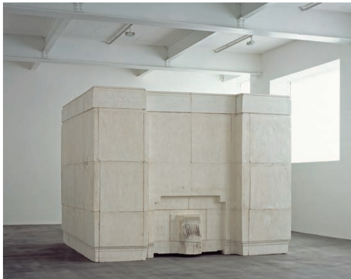
52. Ghost , by Rachel Whiteread. 1990. Plaster on steel frame, 269 by 355.5 by 317.5 cm. (National Gallery of Art, Washington).