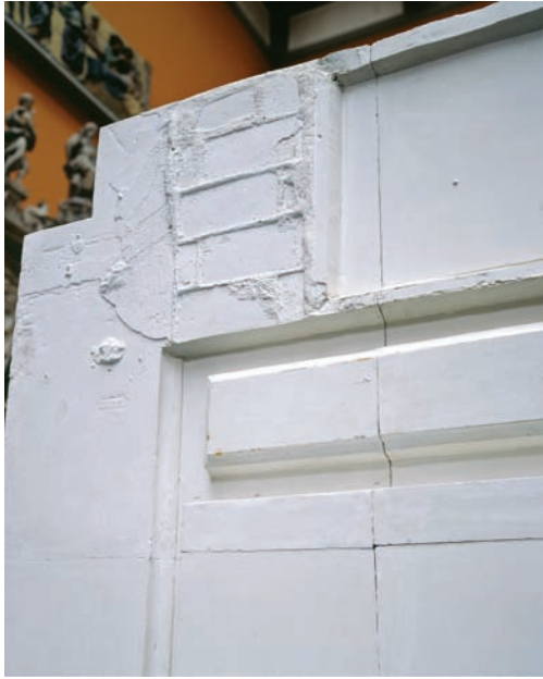
55. Detail of Fig.46 showing damaged masonry.