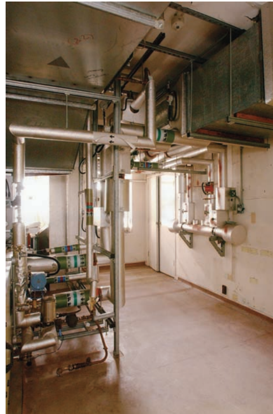
48. Interior of Room 101 at Broadcasting House prior to demolition. 2003.

The situation of Room 101 at Broadcasting House also suggests that it had no specific connection to Orwell. It was at the north-east corner of the first floor, at the end of a long corridor beyond a goods lift (Fig.47). The first floor was mainly devoted to clerical activities: sorting mail, typing and filing. It was two floors below the Talks studios to which Orwell was attached. It is entirely possible that Room 101 was never a private office or conference room. The original floor plan shows that it contained