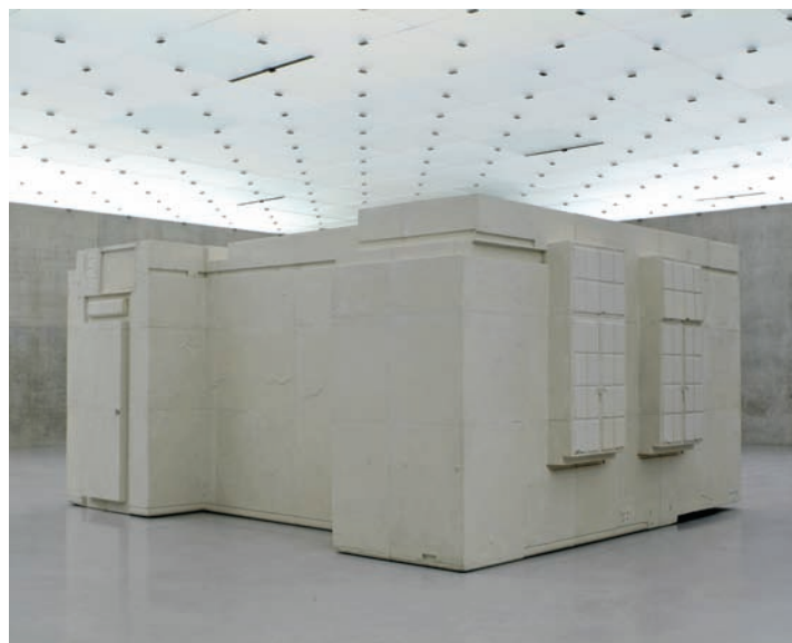
58. Untitled (Room 101) in the exhibition Rachel Whiteread: Walls, Doors, Floors and Stairs at Kunsthau Bregenz. 2005. (Photograph by Markus Tretter).

Despite her doubts about the title, Whiteread did detect something Orwellian about the sculpture and the anonymous, utilitarian, fraying room that served as its mould. There are plenty of salient themes in Nineteen Eighty-Four , such as the cynical manipulation of warfare for public consumption, or the austere conditions of Winston Smith's office in the Ministry of