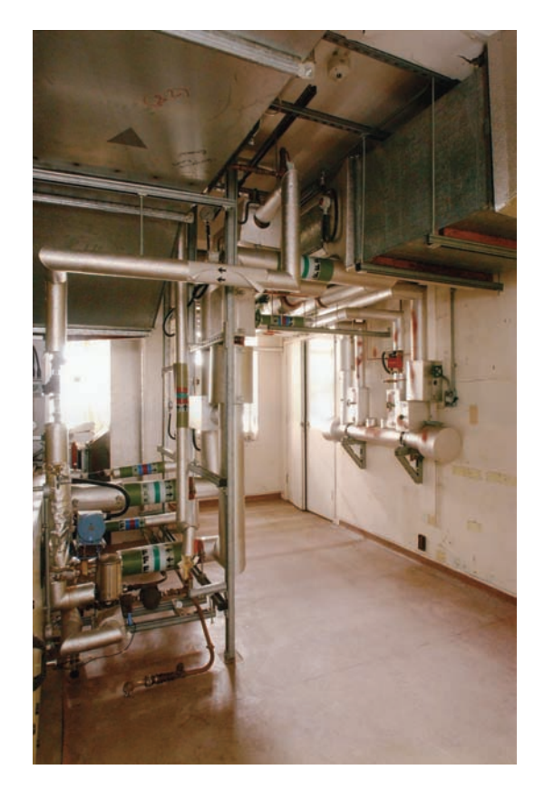
48. Interior of Room 101 at Broadcasting House prior to demolition. 2003. (Photograph by Jeremy Young).

The situation of Room 101 at Broadcasting House also suggests that it had no specific connection to Orwell. It was at the north-east corner of the first floor, at the end of a long corridor beyond a goods lift (Fig.47). The first floor was mainly devoted to clerical activities: sorting mail, typing and filing. It was two floors below the Talks studios to which Orwell was attached. It is entirely possible that Room 101 was never a private office or conference room. The original floor plan shows that it contained