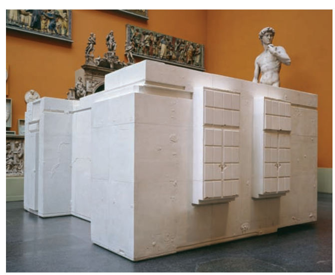
50. Installation view of Untitled (Room 101) in the Cast Courts of the Victoria and Albert Museum, London, showing the cast windows. 2003.

called for rectilinear north and east elevations defined by neighbouring properties along Portland Place and the line of Langham Street respectively. The north elevation abutted buildings that the BBC rapidly acquired and demolished to make way for a planned extension to Broadcasting House, a project that ceased with the outbreak of the Second World War in September 1939.18 The longest side of Untitled (Room 101) records the wall along this shared property line. That long, uninterrupted wall was an ideal location for the plant equipment that Room 101 eventually housed. The inset beside the door, which disrupts the rectangular perimeter of the sculpture, marks where a large duct ran from the basement to the third floor. The windows - the sole elements that might be described as decorative - possess Georgian proportions, which indicate a compromise between the design of the building and the tone of its environment (Fig. 50). In a special issue devoted to Broadcasting House soon after its completion, the Architectural Review characterised that compromise in more combative terms, as 'a struggle between moribund traditionalism and inventive modernism'. 19