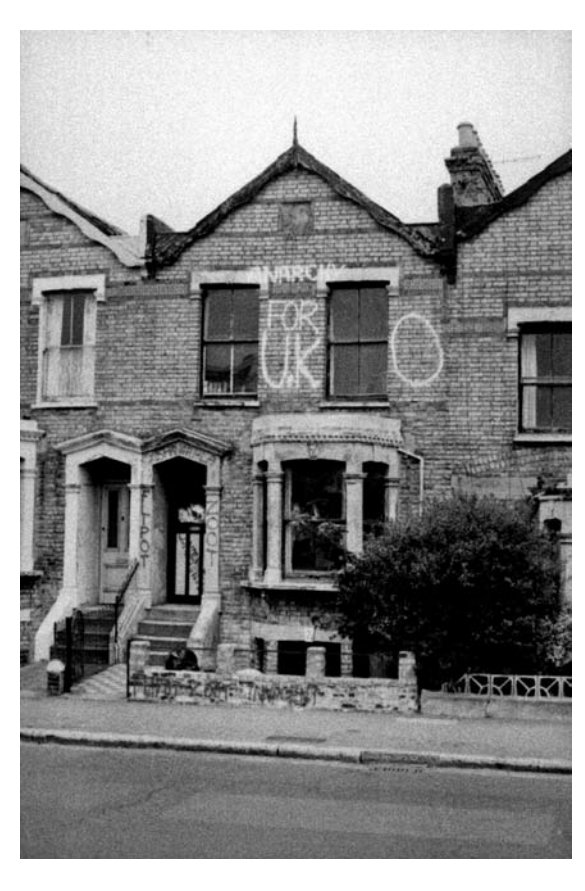
51. 486 Archway Road, London N6. c.1979. (Photograph by Mark Wainwright).

By the time Whiteread cast Room 101 at Broadcasting House, her approach had changed significantly. Some of the reasons for this were practical, including the need for greater resilience and stability than was possessed by the 'naively made and put