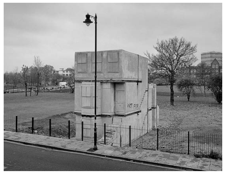
54. House , by Rachel Whiteread. 1993, demolished 1994. Concrete.