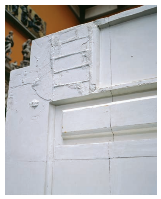
55. Detail of Fig.46 showing damaged masonry.