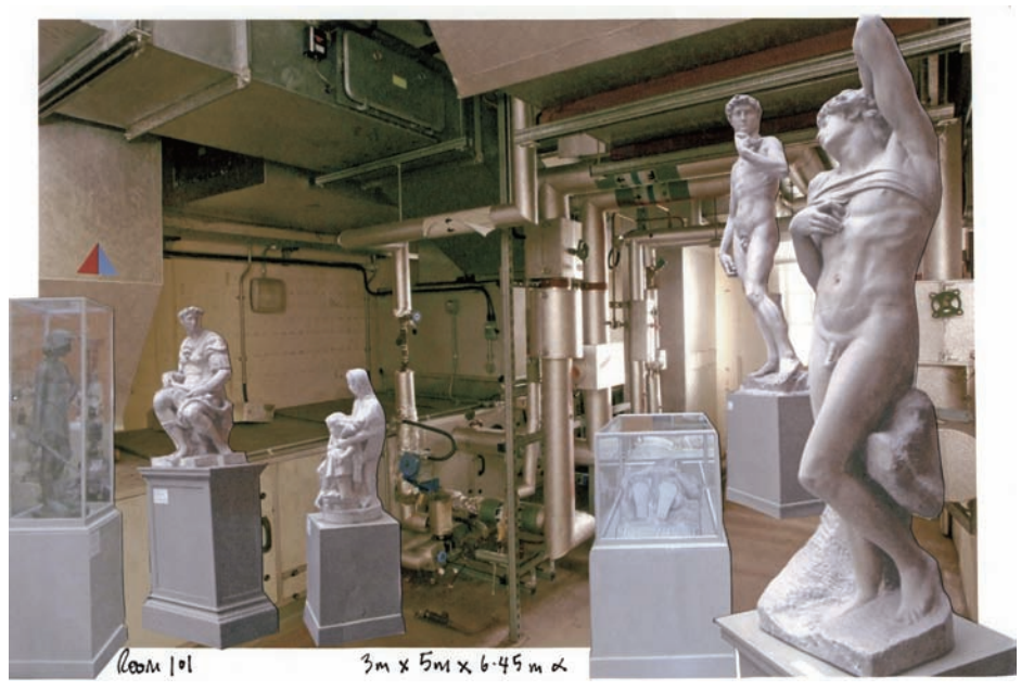
56. Untitled (Room 101), by Rachel Whiteread. 2003. Collage, 29.7 by 42 cm. (Courtesy of the artist).

Doctor Who, the Tardis is a deceptively voluminous vehicle for travel through space and time, a feat which leads to its sudden appearance in all manner of incongruous situations. It externally resembles a police box of a type that Gilbert MacKenzie Trench designed for the Metropolitan Police in 1929,<sup>43</sup> just as Val Myer's proposed design for Broadcasting House was evolving.<sup>44</sup>