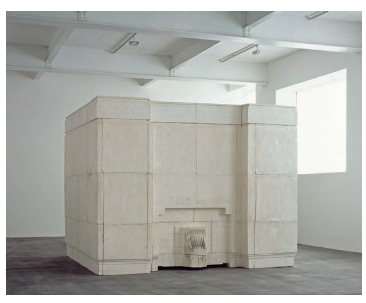
52. Ghost, by Rachel Whiteread. 1990. Plaster on steel frame, 269 by 355.5 by 317.5 cm. (National Gallery of Art, Washington).

<sup>42</sup> Cork, op. cit. (note 1), p.98. The quotations first appeared in Cork's review of the V. & A. installation: idem: 'Inside-out nightmare', The Times (17th December 2003). The essay in the Bregenz catalogue is a revised and expanded version of the Times review.