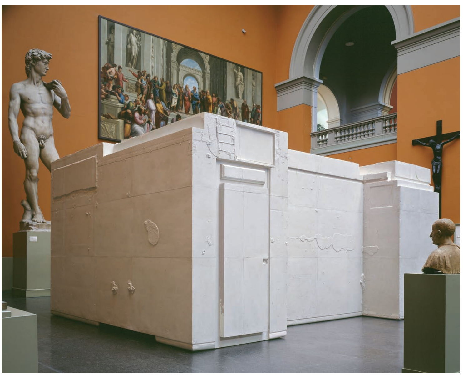
46. Untitled (Room 101), by Rachel Whiteread. 2003. Jesmonite and mixed media, 300 by 500 by 643 cm. (Centre Georges Pompidou, Paris; photographed by Mike Bruce in 2003 in the Cast Courts of the Victoria and Albert Museum, London; courtesy of Gagosian Gallery, London).

site', six commissioned responses to the history and redevelopment of Broadcasting House.