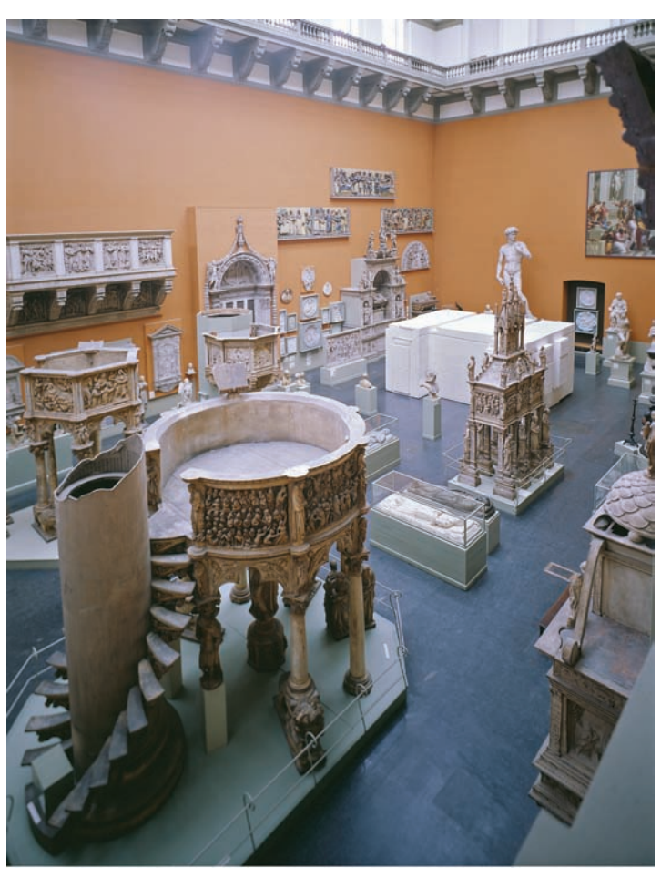
57. Installation view of Untitled (Room 101) at the V. & A. 2003.

Whiteread was ambivalent about the title from the outset and 'wondered whether to call it "Room 101" at all'.49 She avoided using materials and surface effects to suggest the ominous connotations that attend Orwell's description of Room 101. The supposed connection to Orwell, however, held an irresistible allure for the institutions associated with the project. The display text in the Cast Court described the sculpture as 'an imprint of the office George Orwell was said to have occupied at the BBC during the Second World War'.50 After Peter Davison wrote to the V. & A. in response to Richard Cork's review in The Times and set out the case against that account,51 there was some discussion of alternative wording such as '. . . the office that George Orwell was once thought to have used at the BBC'.52 The more tenuous the connection, the greater the need to qualify the relationship between truth and legend.