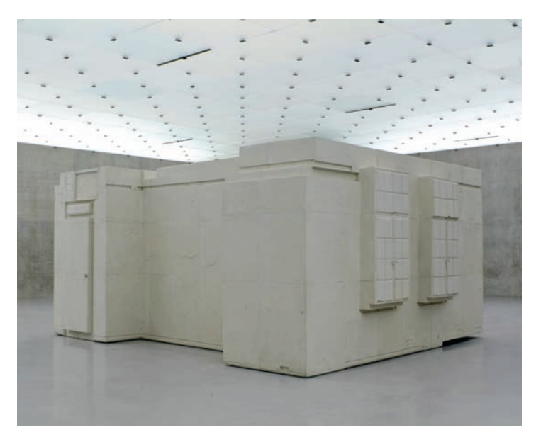
58. Untitled (Room 101) in the exhibition Rachel Whiteread: Walls, Doors, Floors and Stairs at Kunsthaus Bregenz. 2005.

Despite her doubts about the title, Whiteread did detect something Orwellian about the sculpture and the anonymous, utilitarian, fraying room that served as its mould. There are plenty of salient themes in Nineteen Eighty-Four, such as the cynical manipulation of warfare for public consumption, or the austere conditions of Winston Smith's office in the Ministry of