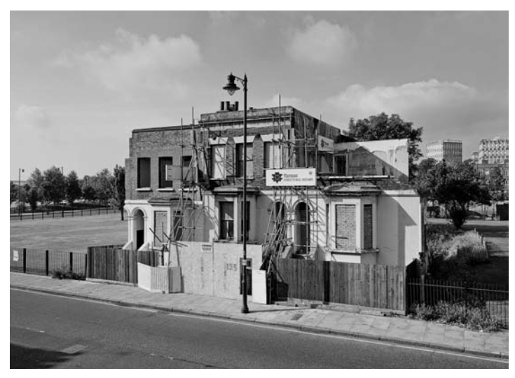
53. 193 Grove Road, London E<sub>3</sub>, prior to the casting of House . 1993.