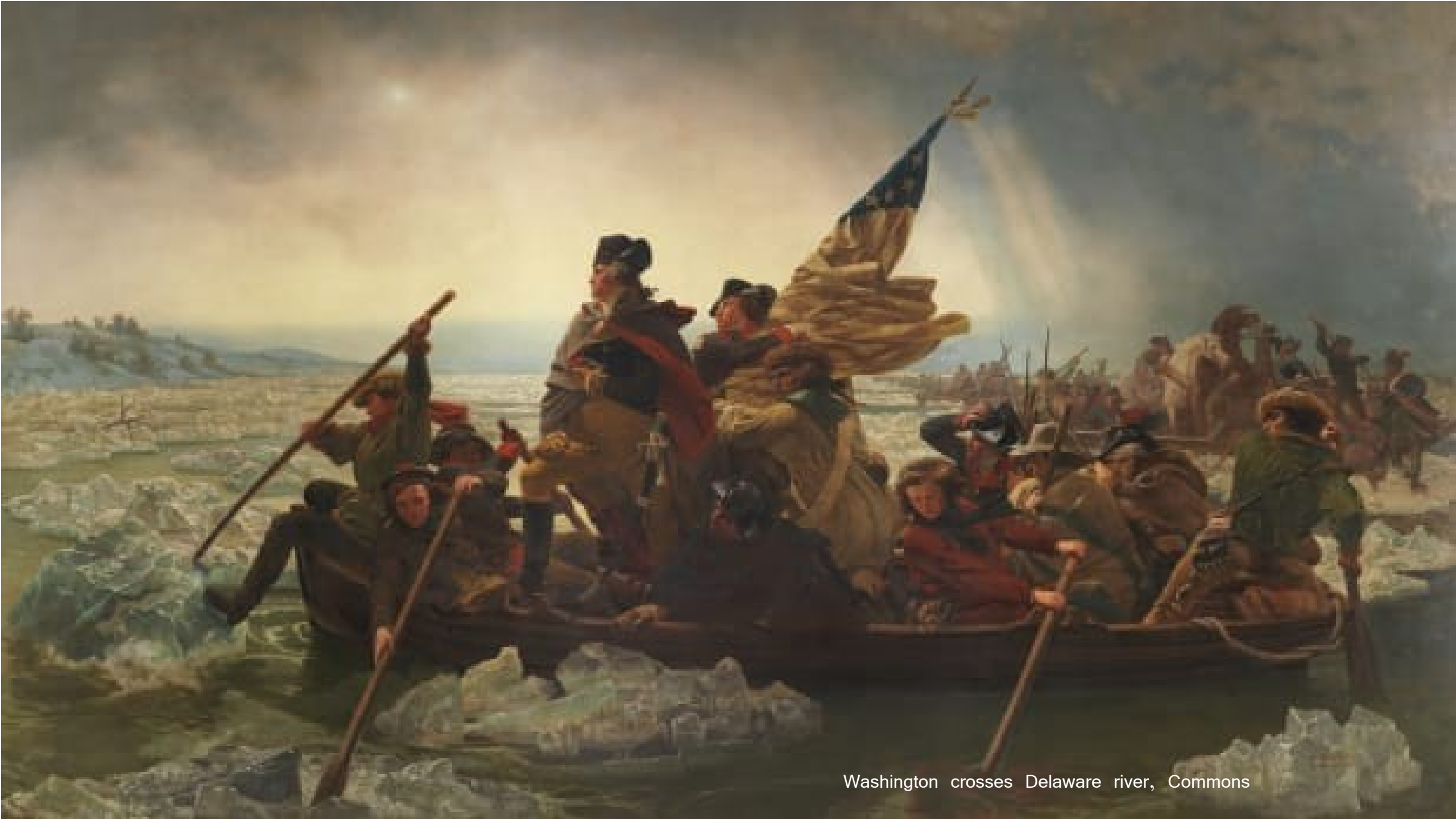
Washington crosses Delaware river