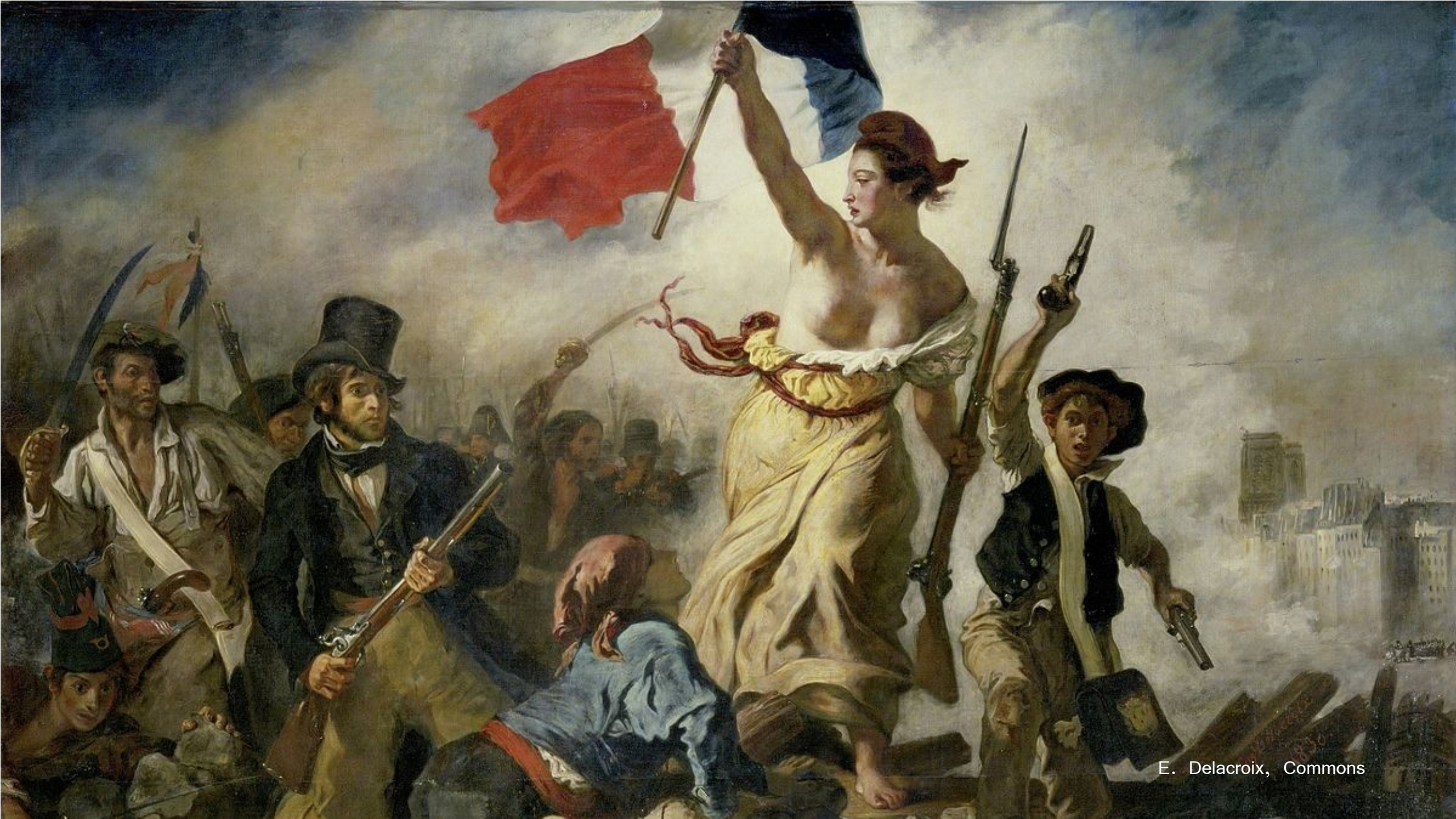
E. Delacroix