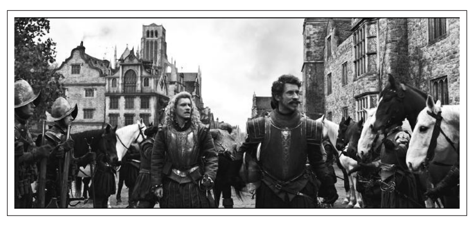
FIGURE 34: Many of the exterior locations in Anonymous (Roland Emmerich, 2013, art dir. Stephan Gessler, prod. des. Sebastian Krawinkel, set dec. Simon Boucherie) were digital creations into which the actors were composited after being filmed on greenscreen.

creations, and the actors were inserted into these with very convincing results. Only a few shots betray their origins as digital composites (figure 34).