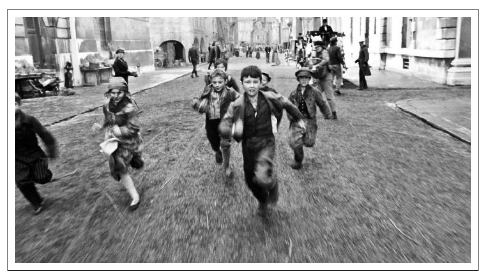
FIGURE 36: Live-action plates—in this case, the children running toward the camera—have been seamlessly composited with digital environments and elements of real locations to portray the nineteenth-century world of Victor Hugo's novel in the film Les Misérables (Tom Hooper, 2012, art dir. Grant Armstrong, prod. des. Eve Stewart, set dec. Anna Lynch-Robinson).

Nevertheless, the film's extensive use of virtual environments to represent exterior locations is a little unusual in live-action feature filmmaking in 2013. More typically, digital environments supplement live-action sets as extensions and augmentations. Tom Hooper's production of Les Misérables (2012) provides some good examples.<sup>17</sup> The story setting is nineteenth-century France, and live action was filmed on sets constructed at Pinewood Studios and on locations in England and France. This live-action material subsequently became a series of "plates" (the industry term for live-action material that has been scanned for use in a digital composite). As Sarah Horton noted, plates often furnish the references used by digital artists for creating color, textures, and lighting in matte paintings or other composite materials. In the case of Les Misérables, live-action plates were extended with period details that had been pulled from nineteenth-century daguerreotype panoramas of Paris. This enabled compositors to insert actors and settings filmed on the Pinewood stages into period backgrounds and the surroundings of streets in Paris. The compositing was complex because many shots featured groups of performers moving in complicated ways and camera