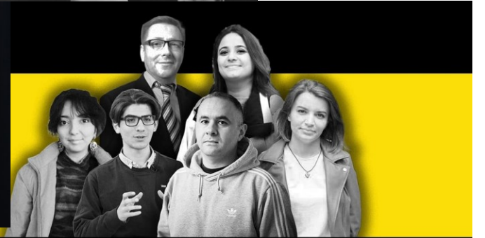
"Abzas Media" rəhbərləri və əməkdaşları korrupsiya araşdırmalarına görə həbs edilib