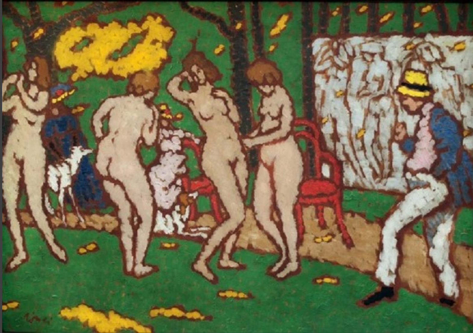
József Rippl-Rónai: My models in my garden in Kaposvár, 1911 (GM)