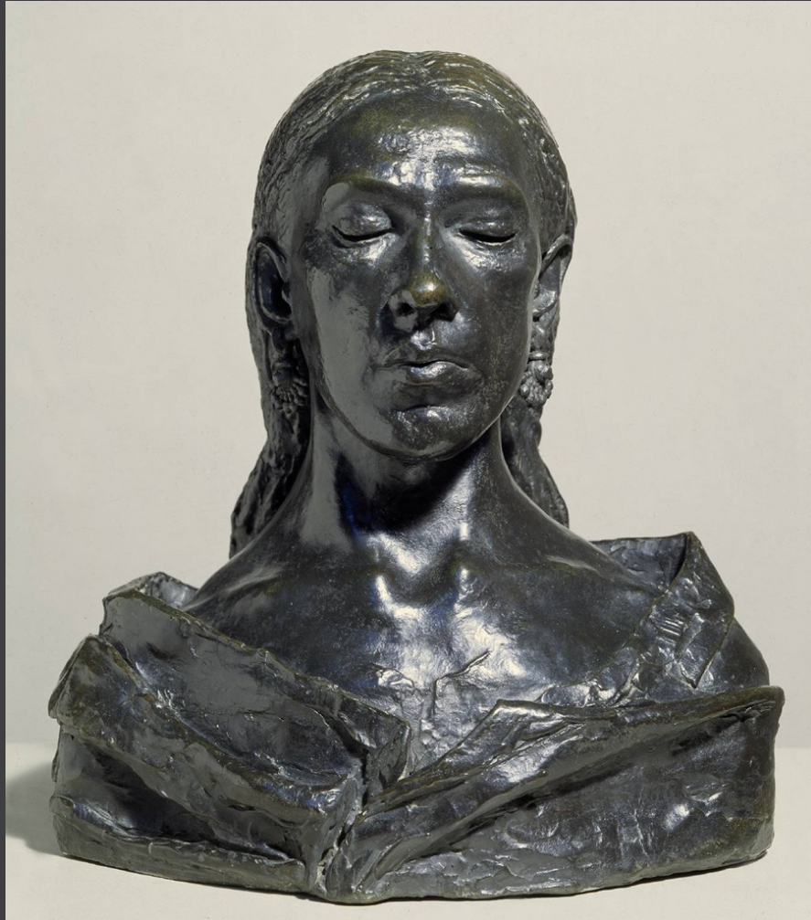
Jacob Epstein, Nan , 1909, Tate Britain