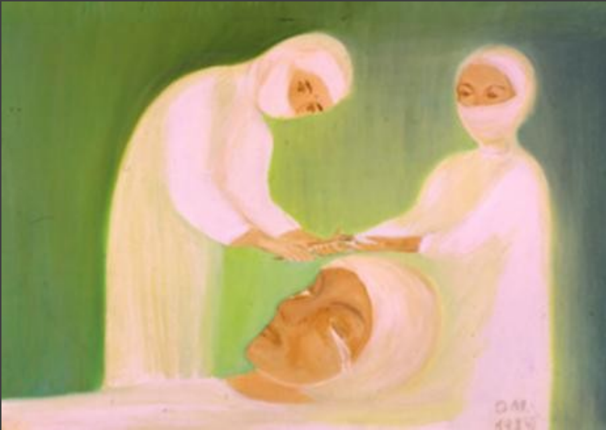
Omara (Mara Oláh): My Eye Operation, 1989, oil, fiberboard, Collection of FROKK.