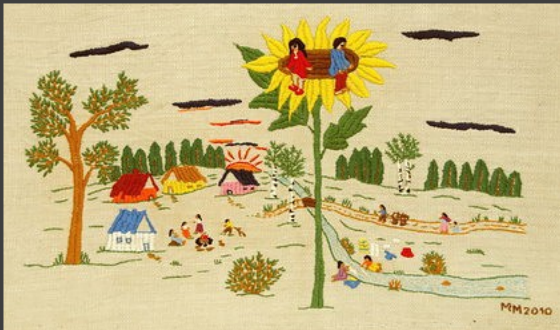
Children's dream, 2010