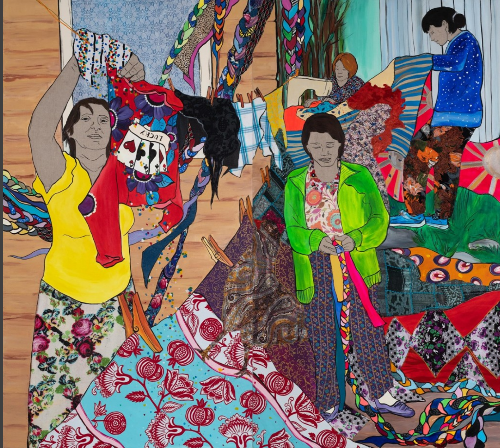
Siostry (Phenia) 2019