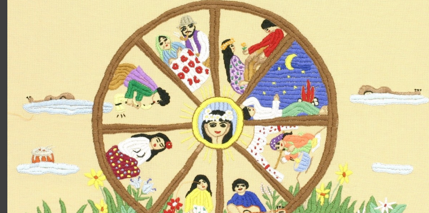
Mother Nature, 2012