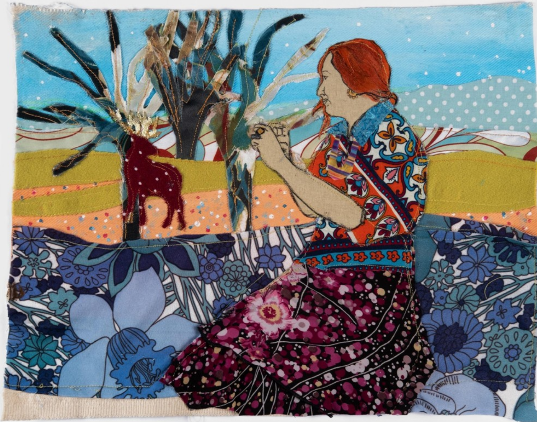
Delaine Le Bas 2020