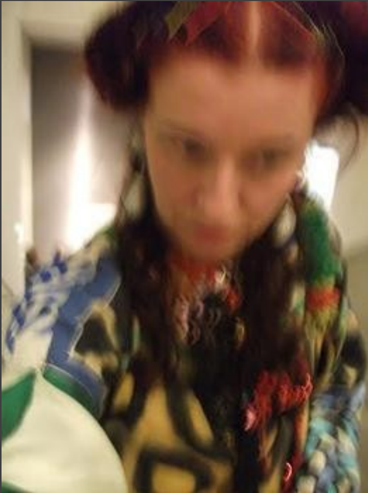
Delaine LeBas: Élő szobor-sorozat /Living Sculpture Series, 2012

https://youtu.be/hhEX9n5DjZQ?si=UI1G2wNlgUslcvUr