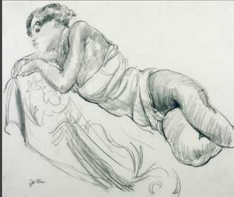
Jacob Epstein, Nan , 1909, Tate Britain