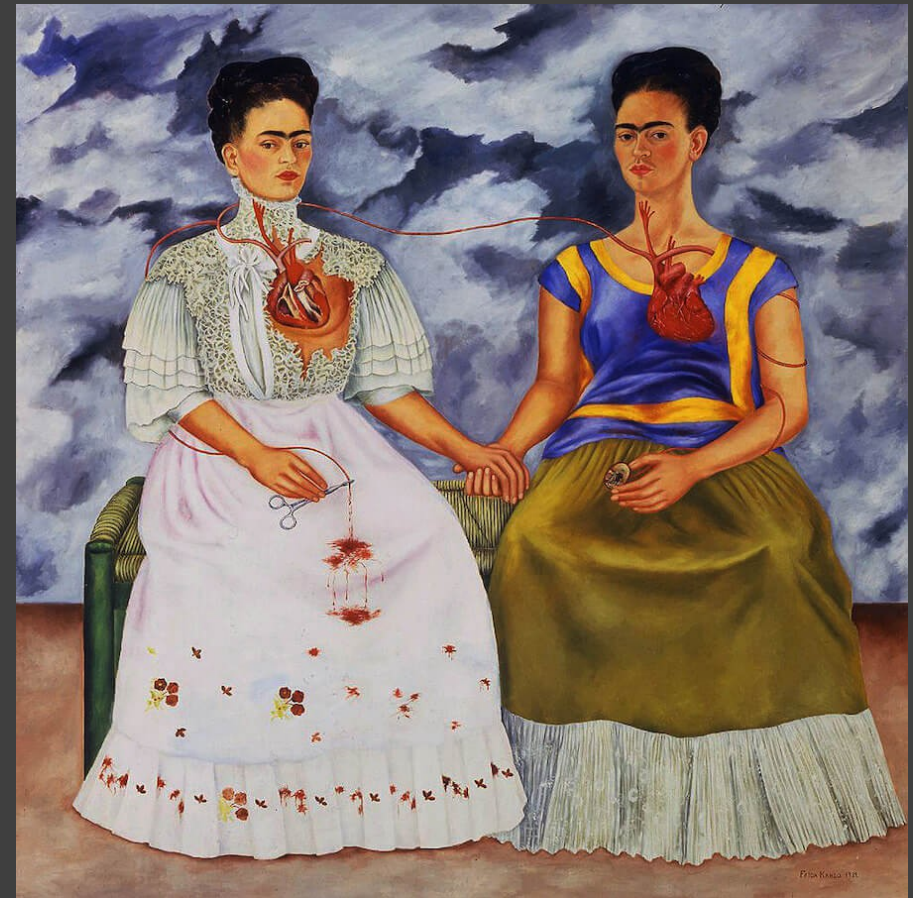
Frida Kahlo, The Two Fridas , 1939, https://www.fridakahlo.org/the-two-fridas.jsp