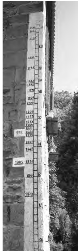
Figure 1: Wertheim.

The memorial in the harbor in Tönning on the German North Sea Coast recalls three severe storm tides in the nineteenth and twentieth centuries. Like the memorials for the victims of the world wars, storm tide memorials in the public sphere, such as these, are conceived as lieux de mémoire (Pierre Nora), except that in this case the memory concerns the victims of natural disasters rather than soldiers who died for the fatherland. The Tönning memorial is exceptional because it explicitly communicates a warning for the future: “Watch out for the next flood.” 43