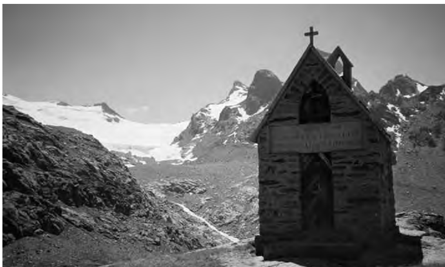
Figure 3: Chapel Lake Rutor, built 1606.

Italian Alpine Club in 1880. 46 At the climax of the second major phase of the Little Ice Age in the 1590s, the advance of the nearby glacier led to annually recurring floods which lasted for almost a decade. The imminence of the advancing glacier was first noticed in 1594, when a wall of water from the lake destroyed houses, barns, forests, and meadows on its way down to La Thuile. A disaster of similar magnitude occurred the following year. The recurrence of the flooding upset the political authorities of the Duchy of Aosta. During the years that followed, they tried to find a technical solution to the problem by having an “engineer” construct a tunnel to evacuate water from the lake. However, this project ultimately failed for technical reasons. In 1603, efforts to prevent the floods by technical means were abandoned. Instead, it was decided to build a chapel near the lake in order to halt the further advance of the glacier. The chapel, dedicated to Santa Margherita, became the destination of a procession to the lake each year on 20 July which contributed to the renewal of the memory of the flood disasters. 47