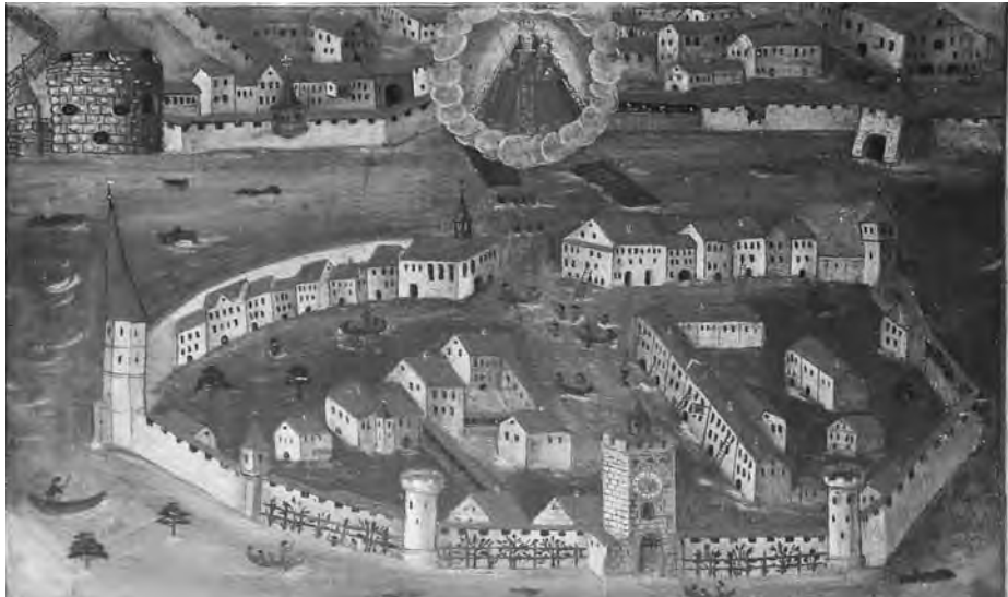
Figure 2: Painting of the Flood of Solothurn 1651. On display in the Spitalkirche zum Heiligen Geist, Solothurn, Switzerland.

in escape from a situation of individual or collective emergency. 44 An ex-voto may be a painting, medal, or even a football shirt that is exhibited in a public space, often in a church. Figure 2 shows a painting commissioned in memory of a dramatic flood in the town of Solothurn (western Switzerland) on 30 November 1651. At that time, the waters of the Aare River carried a huge amount of driftwood which jammed at the bridge, damming the water and diverting it into the town. In despair, the frightened citizens vowed to recognize the help of Virgin Mary if the town was spared. Subsequently, the bridge collapsed and the water level within the town decreased. Today, this ex-voto is on display in a local church. 45