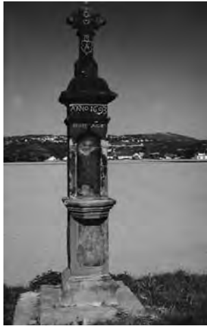
Figure 4: The “hail memorial” in the urban district of Kripp (in Remagen, Rhineland-Palatinate, Germany).