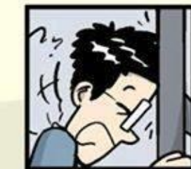
FINAL_rev.22.comments49. corrections.10.#@$%WHYDID ICOMETOGRADSCHOOL????.doc