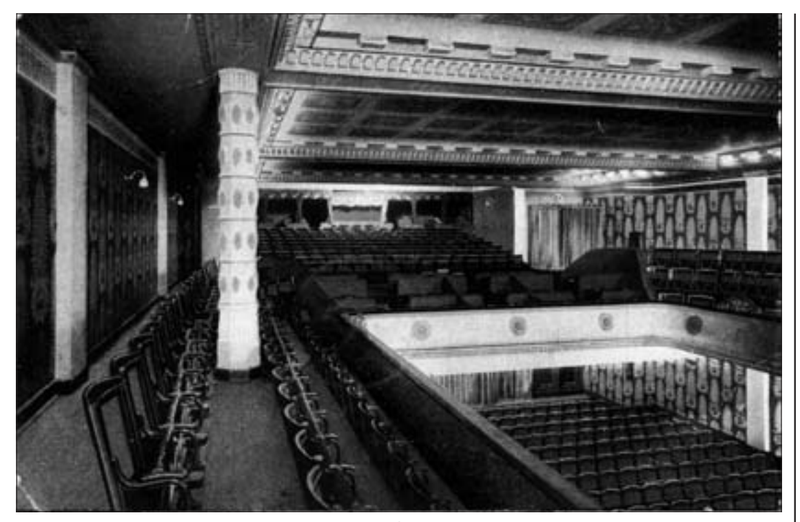
Fig. 2. Interior of Schadow-Lichtspiele. 1916. A Düsseldorf Cinema where soldiers went to see films without mixing with the local population. [Postcard in author's collection.]

district he controlled (VII. Armeekorps) was based on the "many complaints" that "film screenings and posters did not suit the gravity of the situation" (i.e. the mood of wartime). His measures were to be expanded into the neighboring VIII. Armeekorps. <sup>25</sup>