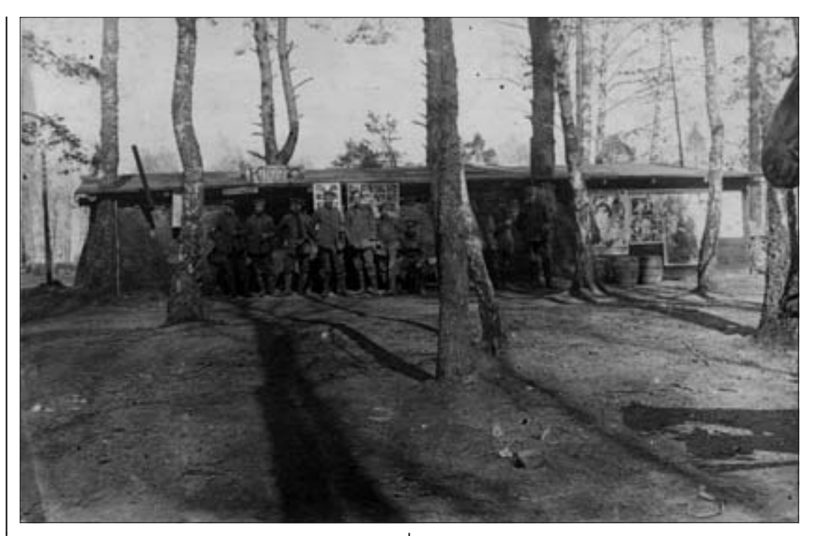
Fig. 4. Kino Ulrichplatz. A makeshift military cinema in the woods, unidentified location.

and from 1 August every print had to be accompanied by a Zensurkarte issued by the Filmprüfungsstelle. To Von Gayl's order assured the existence of the Filmprüfungsstelle until the end of the war.