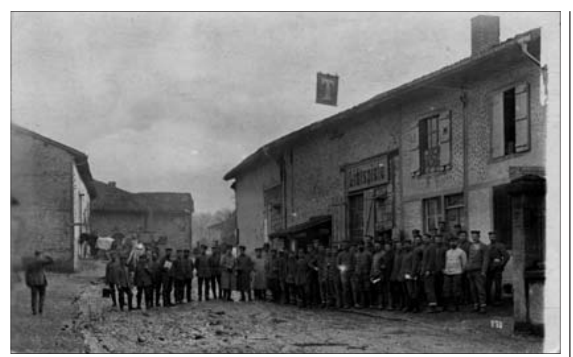
Fig. 1. Lichtspiel Feldkino, 1916, A military cinema in an occupied village. unidentified location.

had become part of everyday life. The infrastructure was not comparable to Berlin, where the local cinemas had to be supplied with prints first, and copies were then sent by train to regional centers such as Munich or Düsseldorf, from where smaller towns were served.