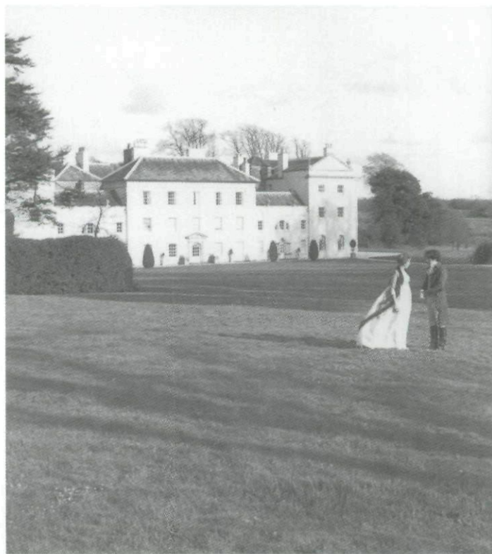
Edward (Hugh Grant) and Elinor (Emma Thompson) walk the Norland estate, Sense and Sensibility (Ang Lee, 1995).