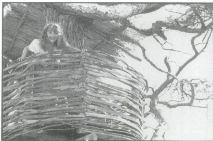
Margaret (Emilie François) rewritten as a tomboy, Sense and Sensibility (Ang Lee, 1995).

From a treatment of landscape, I now turn to questions of gendered and classed physical mobility raised implicitly in the reading of Elinor's and Edward's walk. From the static place of the woman at the window, this movement-image wishfully projects the female body into motion. A more dynamic audiovisual treatment of Austen's story, this subtle shift in emphasis also evokes a feminist craving for female physical and social mobility that is written directly into the