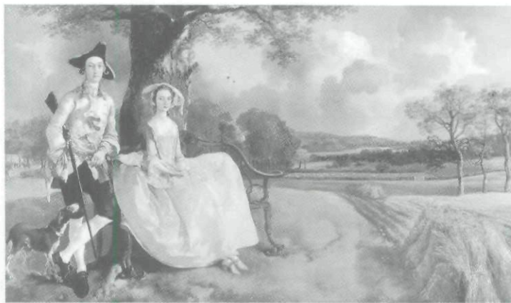
'Mr and Mrs Andrews' by Thomas Gainsborough.

blocking of the couple's walk. From the novel's more authoritarian exchange between mother and prospective son-in-law, Thompson's Elinor banters with Edward as they move 'freely' across the countryside, side by side. Through the characters' voices and physical trajectories, this sequence seeks both to include Elinor Dashwood visually in the proprietorial surveying of Norland's grounds and explicitly to record her exclusion from her apparent birthright through dialogue.