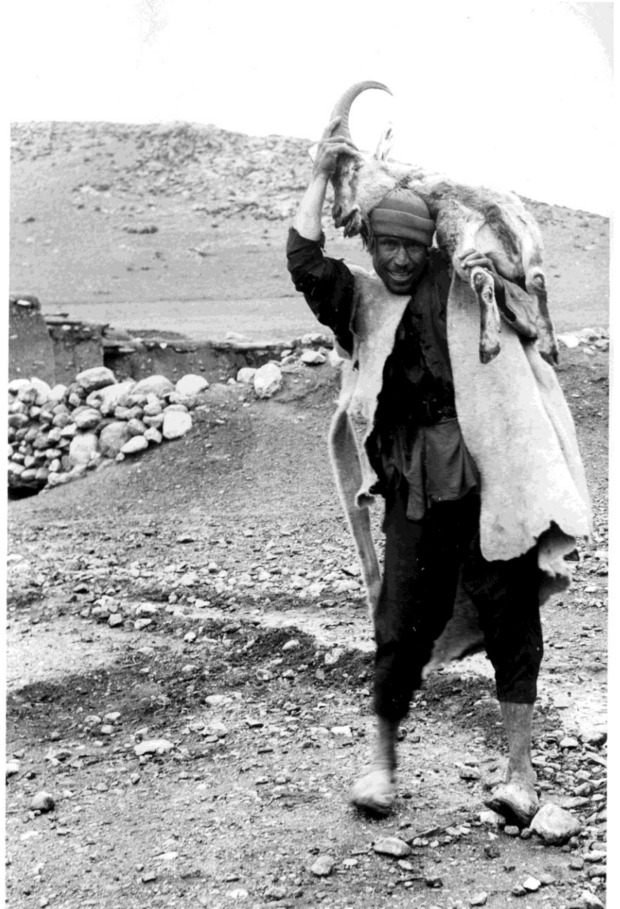
Mangalati with goat