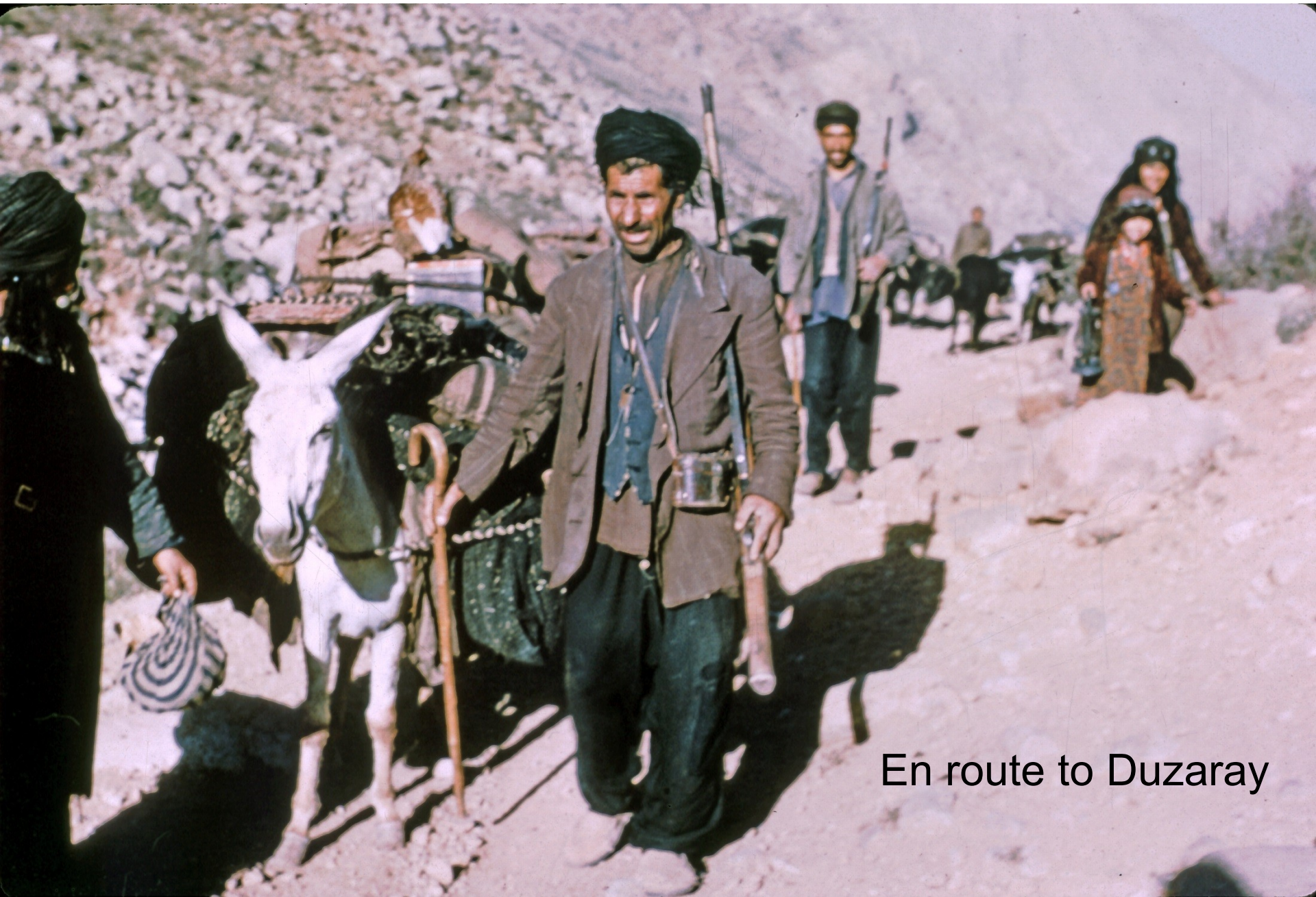
En route to Duzaray