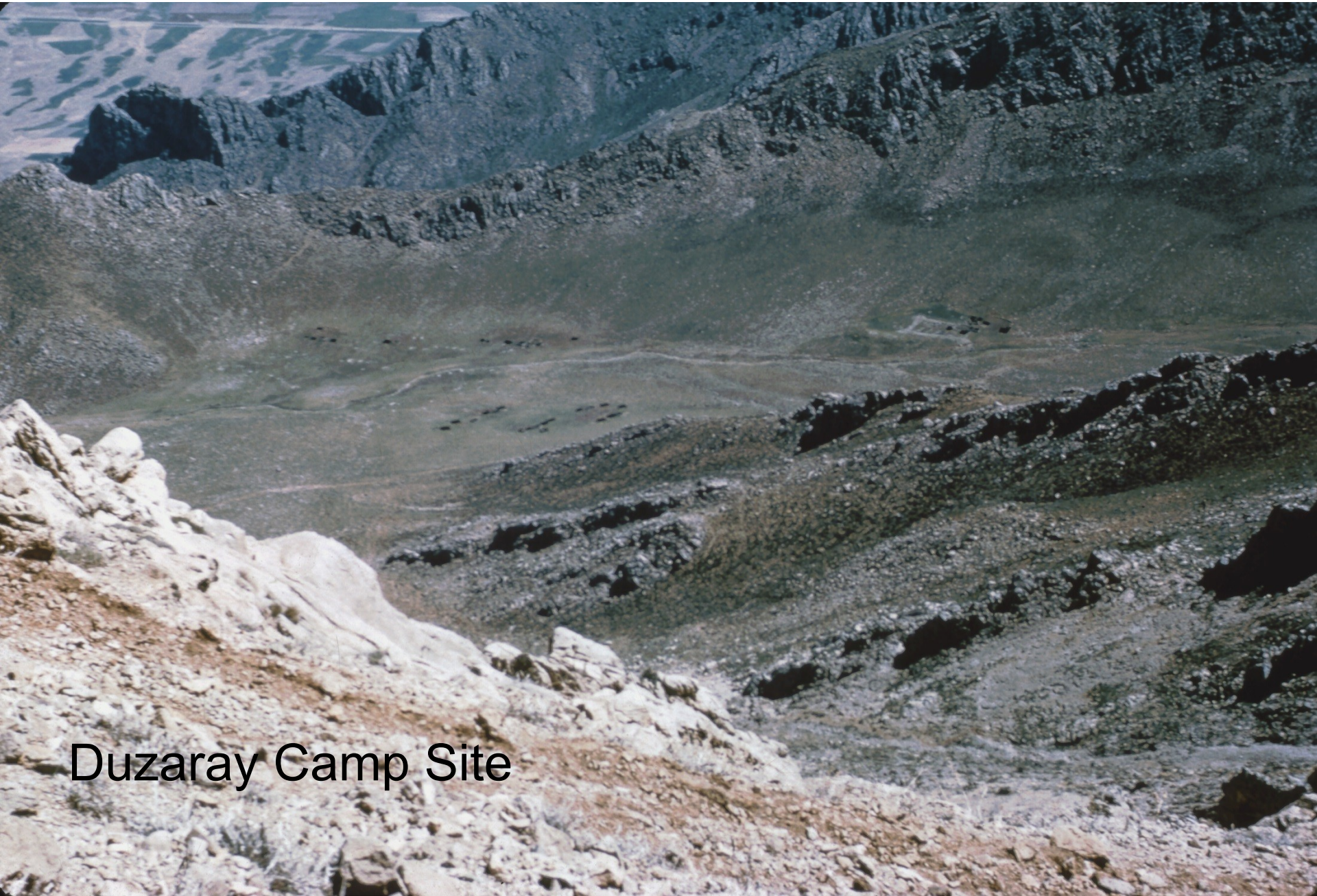
Duzaray Camp Site