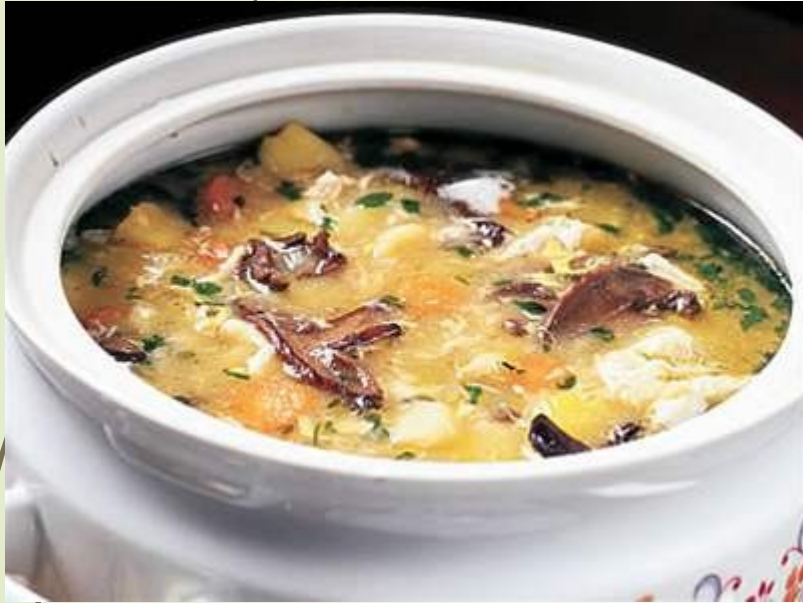
Bramboračka (Potato Soup)