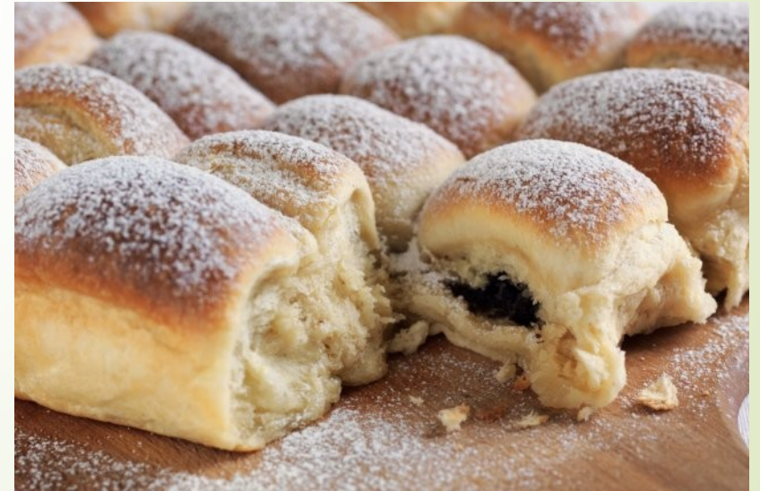
Buchtíky (Sweet rolls/buns)