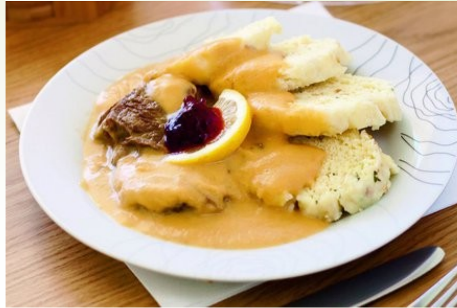
Svíčková na smetaně (Marinated sirloin with cream sauce and dumplings)