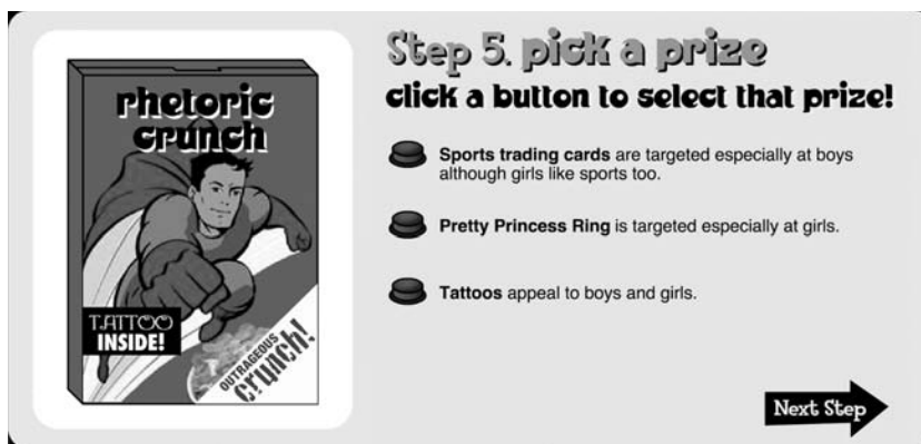
Figure 1.2 PBS’s Freaky Flakes offers a simple representation of practices of children’s advertising.

The argument Freaky Flakes mounts is more procedural than Retouch , but only incrementally so. The user recombines elements to configure a cereal box, but he chooses from a very small selection of individual configurations. Freaky Flakes is designed for younger users than Retouch , but the children who watch PBS Kids also likely play videogames much more complex than this simple program. Most importantly, Freaky Flakes fails to integrate the process of designing a cereal box with the supermarket where children might actually encounter it. The persuasion in Retouch reaches its apogee when the user sees the already attractive girl in the fake magazine ad turned into a spectacularly beautiful one. This gesture is a kind of visual enthymeme, in which the