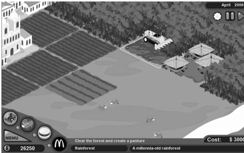
Figure 1.1 In Molleindustria's The McDonald's Game , players must use questionable business practices to increase profits.

grazing (see figure 1.1). These tactics correspond with the questionable business practices the developers want to critique. To enforce the corrupt nature of these tactics, public interest groups can censure or sue the player for violations. For example, bulldozing indigenous rainforest settlements yields complaints from antiglobalization groups. Overusing fields reduces their effectiveness as soil or pasture; creating dead earth also angers environmentalists. However, those groups can be managed through PR and lobbying in the corporate sector. Corrupting a climatologist may dig into profits, but it ensures fewer complaints in the future. Regular subornation of this kind is required to maintain allegiance. Likewise, in the slaughterhouse players can use growth hormones to fatten cows faster, and they can choose whether to kill diseased cows or let them go through the slaughter process. Removing cattle from the production process reduces material product, thereby reducing supply and thereby again reducing profit. Growth hormones offend health critics, but they also allow the rapid production necessary to meet demand in the restaurant sector. Feeding cattle animal by-products cheapens the fattening process, but is more likely to cause disease. Allowing diseased meat to be made into burgers may spawn complaints and fines from health officers, but those groups too can be bribed through lobbying. The restaurant sector