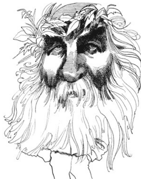
Walt Whitman; drawing by David Levine

thought—where they would not have been seen or acknowledged in earlier generations. The old humanist joy in what people are still abides in Tocqueville, and he draws a humanist conclusion about the brilliance of people simply as such. Walt Whitman wrote, “I celebrate myself, and sing myself,/and what I assume you shall assume,/For every atom belonging to me as good belongs to you.” Any excellence, while it is given by heaven, more or less at random from the world’s perspective, is testimony to the fact that human beings are endowed with a capacity for excellence, whatever form it takes in any individual case. Their natural grandeur, which is overturning the old order, is not a matter of political or economic power, which according to Tocqueville are a consequence of the emergence of these gifts and secondary to them. The splendor of the gifts themselves, as they are liberated by new areas of knowledge, by fresh ideas, makes the case for democracy.