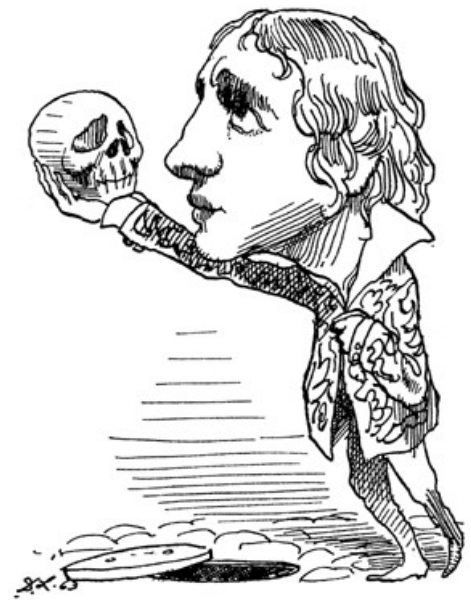
John Keats; drawing by David Levine

Competitive with whom? On what terms? To what end? With anyone whose vigor and good fortune allows her to prosper, apparently. With anyone who has done a clever thing we did not think of first. And will these competitors of ours be left to enjoy the miserable advantage of low wages and compromised health? And is there any particular reason to debase human life in order to produce more, faster, without reference to the worth of the product, or to the value of the things sacrificed to its manufacture? Wouldn't most people, given an hour or two to reflect, consider this an intolerably trivial use to be put to, for them and their children? Life is brief and fragile, after all. Then what is this new economy whose demands we must always be ready to fill? We may assume it will be driven by innovation, and by what are called market forces, which can be fads or speculation or chicanery. Oh, yes, rowdy old capitalism. Let it ply its music.