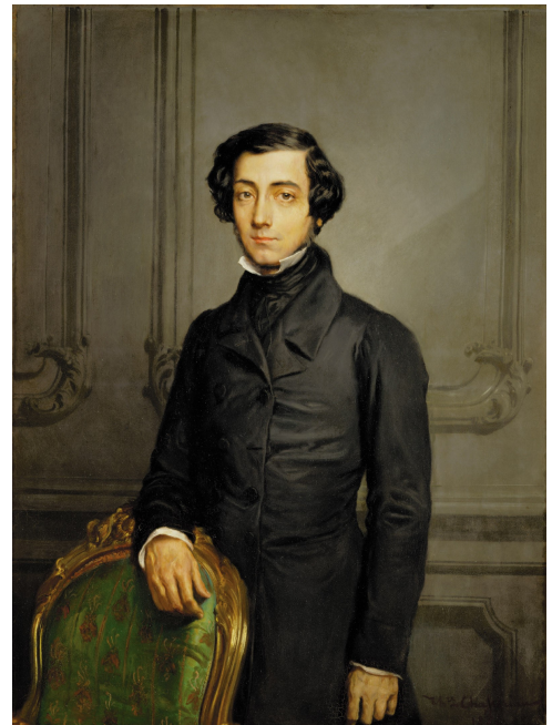
Châteaux de Versailles et de Trianon/Erich Lessing/Art Resource

To put books into English, the vulgar tongue, the language of the masses, was once radical. Teaching literature written in English is a recent innovation, historically speaking, and was long regarded in the more renowned institutions as a lowering of standards. It is still the case in some countries that the work of living writers is excluded from the curriculum, perhaps a sign of lingering prejudice against the vernacular, against what people say and think now, in the always disparaged present. In America this scruple is gone and forgotten. Writers not yet dead, in many cases only emerging, are read and pondered, usually under a rubric of some kind that makes them representative of gender or ethnicity or region, therefore instances of some perspective or trend often of greater interest to the professor than to any of the writers.