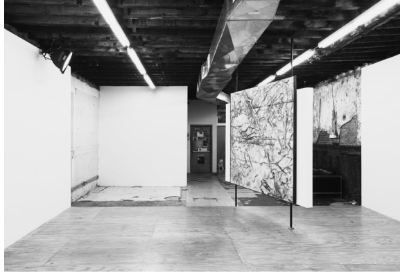
Koether. Lux Interior. 2009. Installation view, Reena Spaulings Fine Art, 2009.