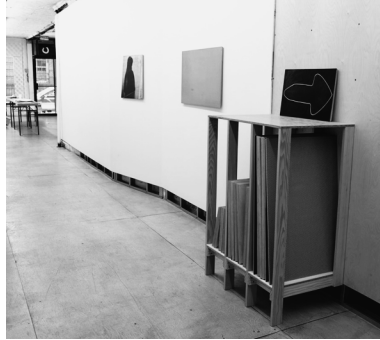
Above: R. H. Quaytman. Chapter 10: Ark. 2008. Installation view, Orchard, 2008.