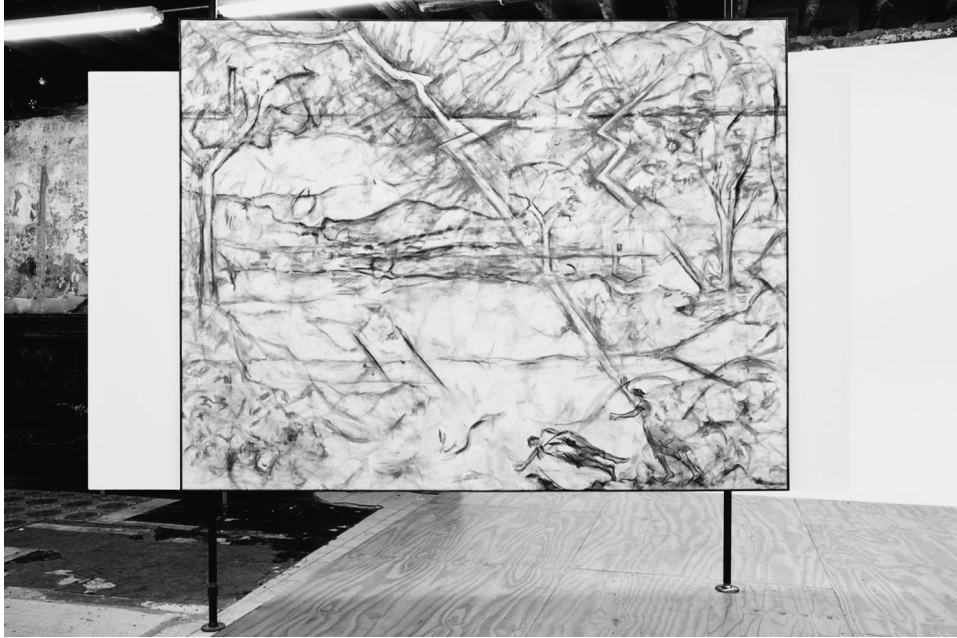
Jutta Koether. Hot Rod (after Poussin). 2009.

Reena Spaulings Gallery in New York, for instance, painting functioned as a cynosure of performance, installation, and painted canvas. The exhibition centered on a single work mounted on an angled floating wall—much like a screen—which, as Koether put it, had one foot on and one foot off the raised platform that delineates the gallery’s exhibition area, as though caught in the act of stepping onstage. 2 This effect was enhanced by a vintage scoop light trained on the painting that had been salvaged from The Saint , a famous gay nightclub that officially closed in 1988 largely as a consequence of the AIDS crisis. The canvas itself, Hot Rod (after Poussin) (2009), is a nearly monochromatic reworking of Poussin’s Landscape with Pyramus and Thisbe (1651), representing a Roman myth centered on the extinction of love—and life—caused by the misreading of visual cues (Pyramus sees Thisbe’s ruined veil and assumes she has been murdered by a lioness, leading to his suicide, and then, upon finding him dead, Thisbe’s own). The painting is predominantly red—the color of blood and anger (and by extension AIDS)—and it centers on a scaled-up motif—a giant bolt of lightning that