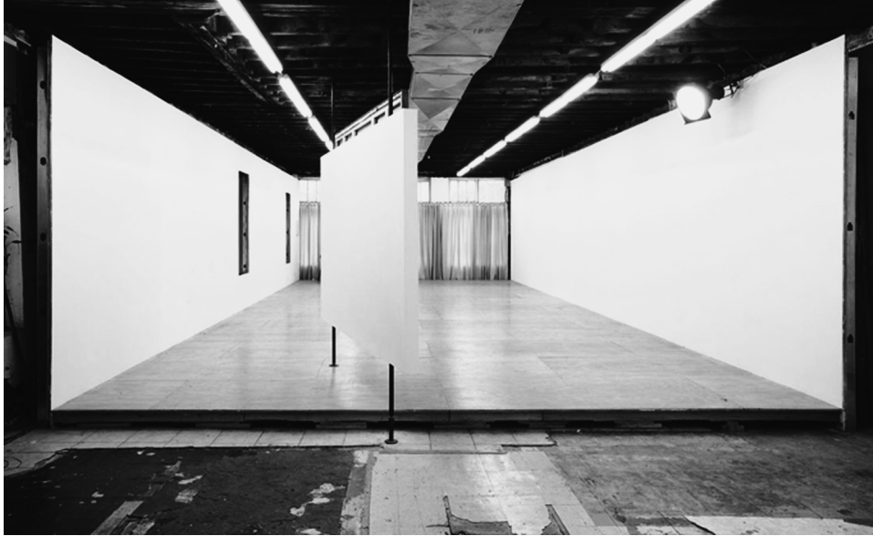
Koether. Lux Interior. 2009. Installation view, Reena Spaulings Fine Art, 2009.

had played a much less prominent role in Poussin's canvas. This jagged form divides the composition like a scar, around which brushstrokes coagulate. The marks are by turns tentative and assertive, something like a caress before a slap. Indeed, inspired by T. J. Clark's extended reading of Poussin in The Sight of Death (2006), Koether develops a gesture that is deeply ambivalent: equally composed of self-assertion and interpretation, her strokes are depleted of expressive urgency by marking the elapsed time between Poussin's 1651 and her 2009. 3 Three lecture performances accompanied the exhibition in which Koether moved around and even under the wall that supported her canvas—her body and the bright anger of her recitation of collaged text furnished a frame for the canvas. The painting's own presence as a personage—or interlocutor—was further enhanced by strobe lights flashing onto it in different configurations during these live events as if painting and painter had encountered one another in a club. 4