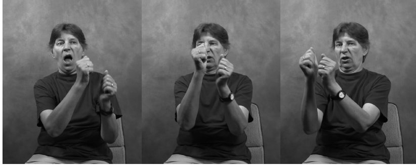
Figure 9.4: EVERY_{DISTR} . The sign EVERY is repeated in several locations.

(8) MAN BUY BEER ONE_{DISTR} [RSL] ‘Every man bought a beer.’