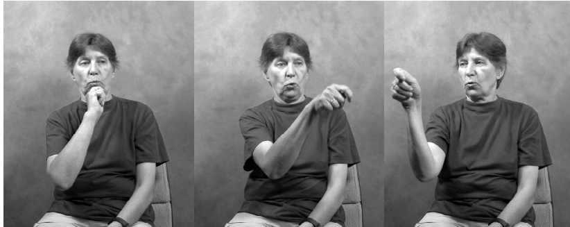
Figure 9.1: Stills for example (5). Movement from the signer towards several (four) locations.

Similar marking clearly also exists in RSL. The verbal sign moves towards the locations of the objects distributed over ( the distributive key ). Interestingly, distributive agreement can apply both to objects and subjects: see (5) and figure 9.1, and (6) and figure 9.2. In addition, similar to other sign languages, RSL also has the form of non-distributive plural agreement, when the hand follows an arc shape to denote a plurality of objects.