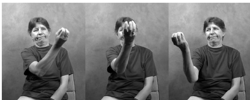
Figure 9.3: Stills for example (9). Sign FLOWER-DISTR.

However, distributed share can be marked in RSL as well, and the marking is again the same spatial strategy, but this time the noun is modified. Example (8) shows that the sign ONE-DISTR is repeated in several locations thereby producing the distributive interpretation 'one each'. However, it is not correct to say that RSL has a special morphological class of distributive numerals similar to some spoken languages (Balusu 2006), as nouns can be forced distributive interpretation through the same spatial strategy: see (9) and figure 9.3.