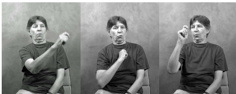
Figure 9.2: Stills for example (6). Movement from several (four) locations towards the signer.