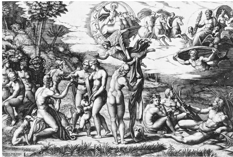
Figure 5 Marcantonio Raimondi, The Judgment of Paris, 1513-14, Copper engraving after Raphael. The Metropolitan Museum of Art, Rogers Fund, 1919 (19.74.1)