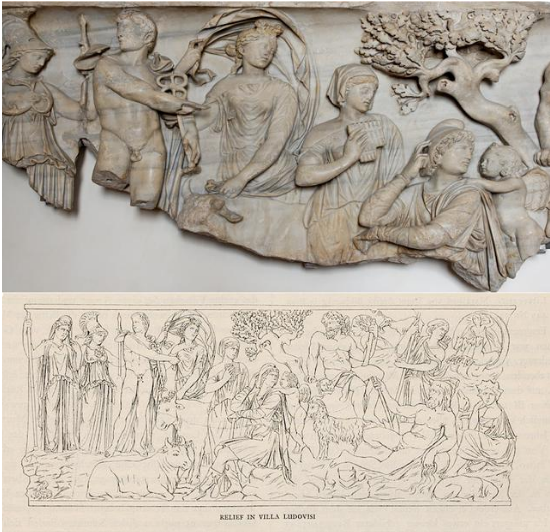
Figure 8 (above) The Judgment of Paris , bas-relief of the sarcophagus at the Villa Ludovisi in Rome and (below) graphic reconstruction in A. von Bartsch, Le peintre graveur , vol XIV (1867), 245.

distance [Entfernungswillen] 48 pertaining to the life represented in art. The mission of a historical and artistic science of civilization [kunstgeschichtlichen Kulturwissenschaft] – which has yet to see the light of day – would be to investigate the phases of this will through original iconographic and textual documents.