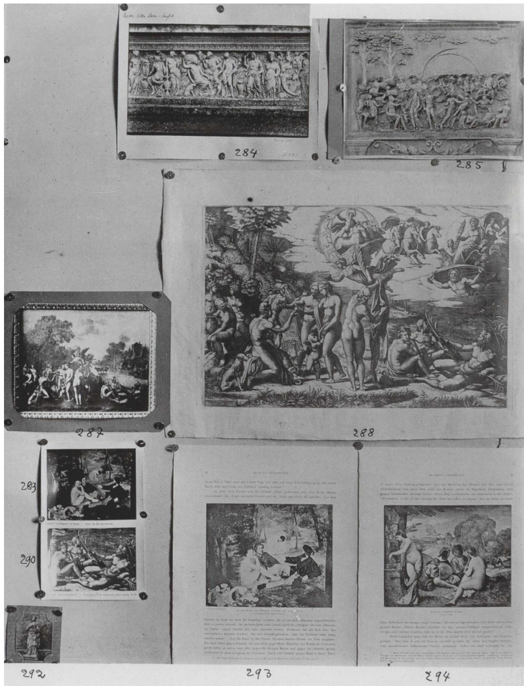
Figure 1 (detail) Plate 20 from Warburg's 1929 Exhibition The Roman Antiquity in the work of Domenico Ghirlandaio for the Biblioteca Heriziana in Rome , courtesy of the Warburg Institute, London (WIA III, 115.6). Note: 284 corresponds to Fig. 6 below, 285 to Fig. 4, 287 to Fig. 9, 288 to Fig. 5, 289 and 293 to Fig. 3 and 290 is a detail of Fig. 5.

Warburg, Miroirs de faille: à Rome avec Giordano Bruno et Édouard Manet, 1928-9 , Paris: Les presses du reel, 2011, 19-22.