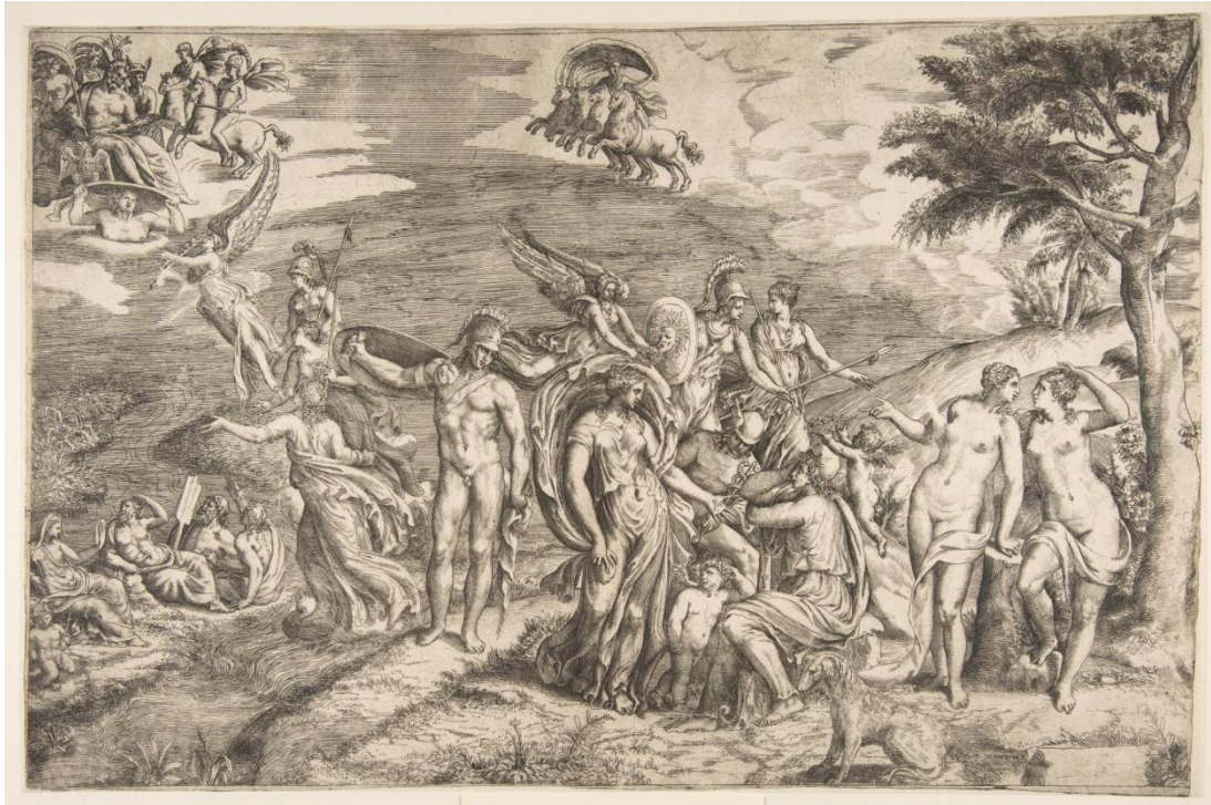
Figure 7 Giulio di Antonio Bonasone, The Judgment of Paris, mid 16 th cent, etching and engraving. The Metropolitan Museum of Art, Harris Brisbane Dick Fund, 1953 (53.600.4232)

But we cannot appreciate the crucial difference between the two Italian engravings unless we compare in great detail the poses assumed by the crowd of the demi-gods. In Bonasone, in accordance with the sarcophagi, the terrestrial demi-gods are represented by four characters. Tellus, 38 the ruler of the Earth, appears on her throne, with three genii 39 lying by her side, their bodies attached to the ground; their efforts to straighten their upper torsos betray their sudden commotion on view of the celestial apparition.