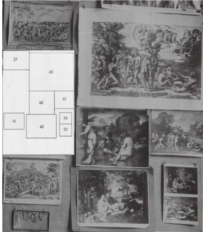
Figure 2 (detail of) Plate 3 from Warburg’s iconographic apparatus for “Manet and Italian Antiquity,” Courtesy of the Warburg Institute, London (WIA III, 116.1.1). Note: 37 corresponds to Fig. 4, 41 to Fig. 7, 45 to Fig. 5, 46 is Giorgione’s Il concerto campestre (now attributed to Titian), 47 to Fig. 9, 48 and 49 to Fig. 3 and 50 is a detail of Fig. 5.