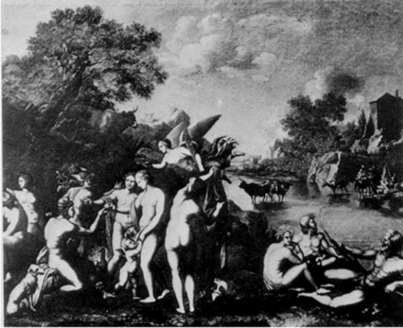
Figure 9 Anonymous (poss. Dutch), The Judgment of Paris , 17 th cent., Villa d'Este Tivoli.

who is captive to a restrictive social life, demands the satisfaction of its archetypal right [Urrechts]: Manet had read his Rousseau (fig. 10).