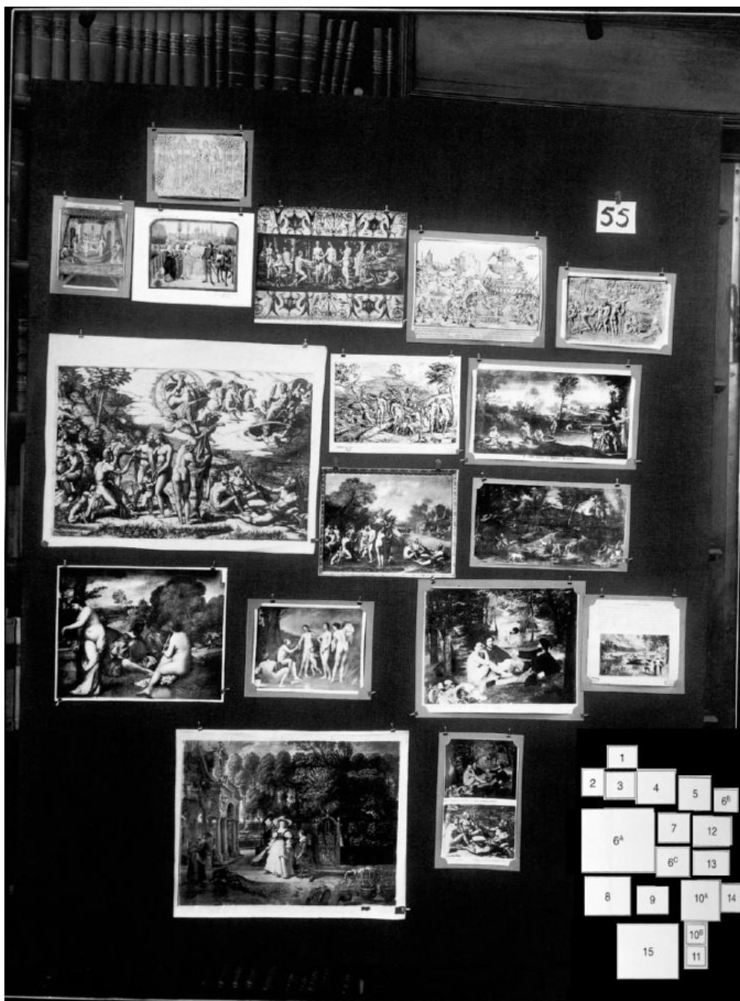
Figure 10 Plate 55 of Warburg's Atlas Mnemosyne , [The Judgment of Paris], (photographed in Hamburg, 1929). (6 A corresponds to the Raimondi engraving, 6 B to the relief of the sarcophagus in the Villa Ludovisi, 6 C to the Dutch landscape painting, 8 is Giorgione's Il concerto campestre (now attributed to Titian), 11 to a detail of the Raimondi engraving, 7 to the Bonasone engraving, 10 A and 10 B to Manet's painting).