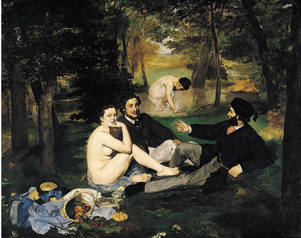
Figure 3 Édouard Manet, Le Déjeuner sur l'herbe , 1863, Oil on Canvas. Musée d'Orsay.

(Warburg Institute Archive [WIA] III, 116.1.1, 23 1929)