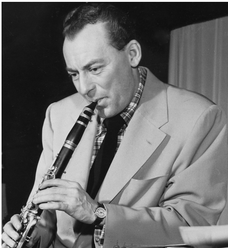
Woody Herman (1913 – 1987)