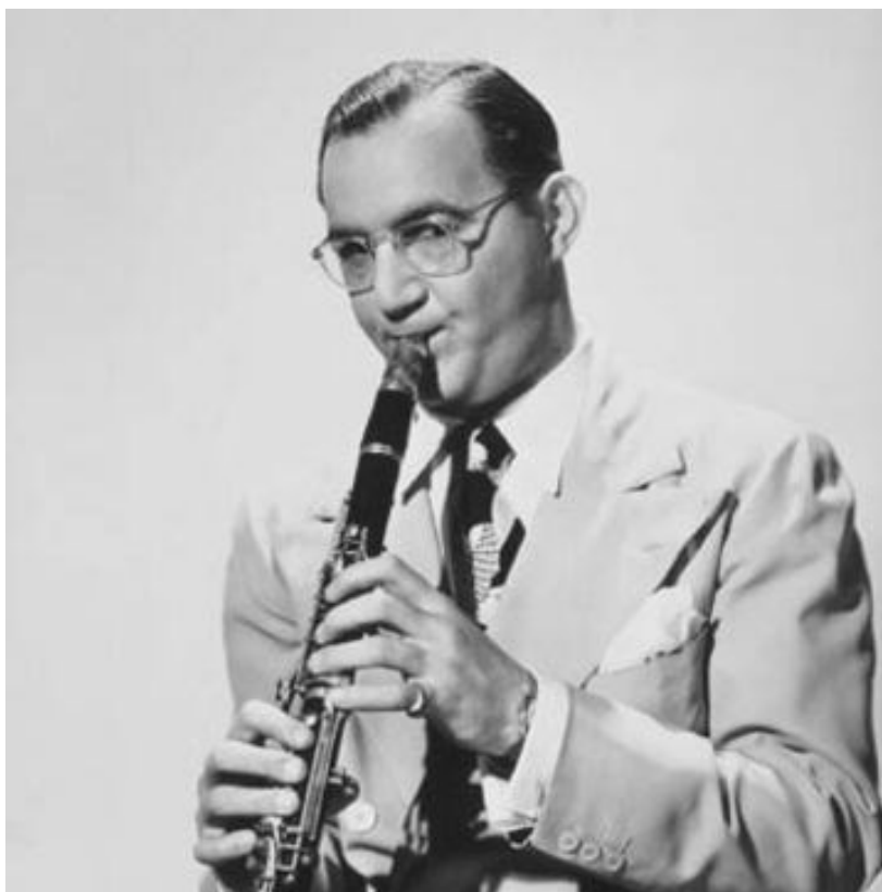
Benny Goodman (1909 – 1986)