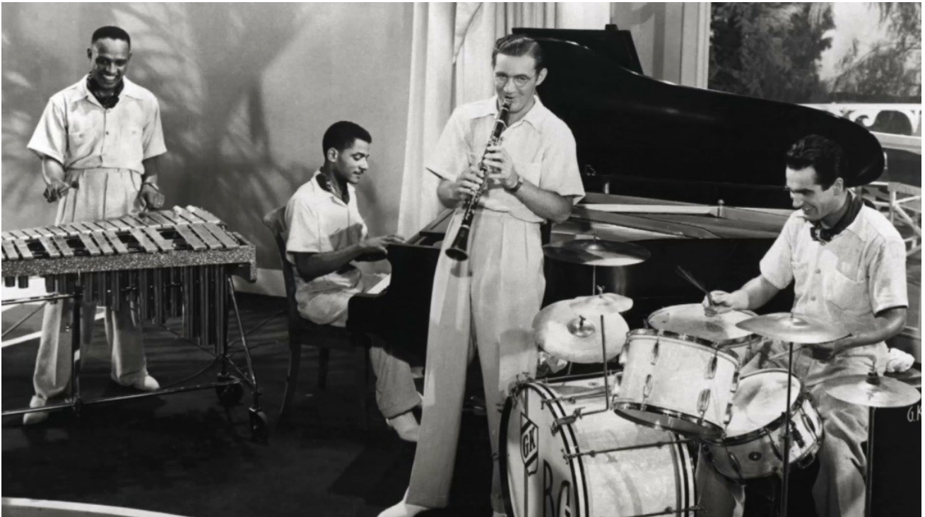
Lionel Hampton (1908-2002) Teddy Wilson (1912-1986) BG, Gene Krupa (1909-1973)

Benny Goodman Quartet: Benny Goodman-cl; Lionel Hampton-vib; Teddy Wilson-p; Gene Krupa-dr. Hollywood, July 30, 1937. Victor 25644 / 09627-2.