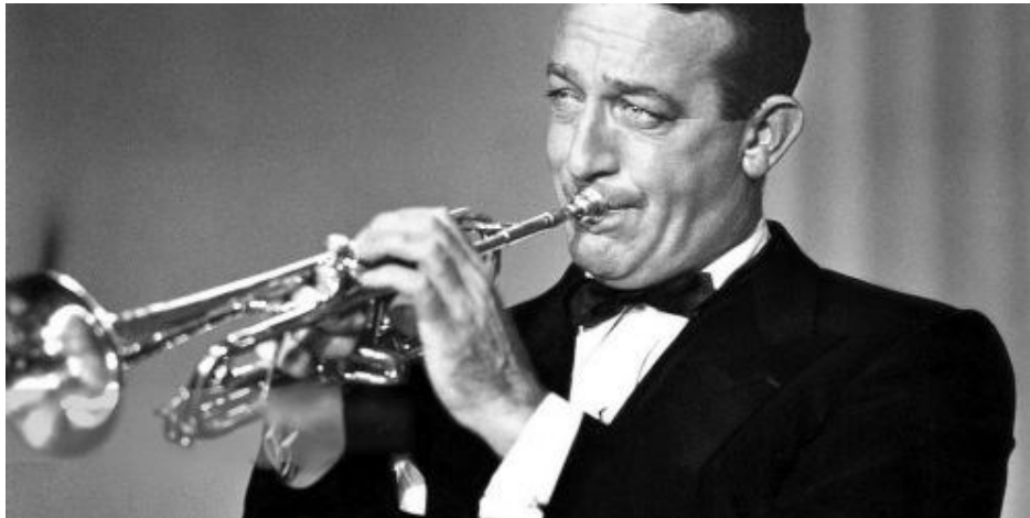
Harry James (1916 – 1983)