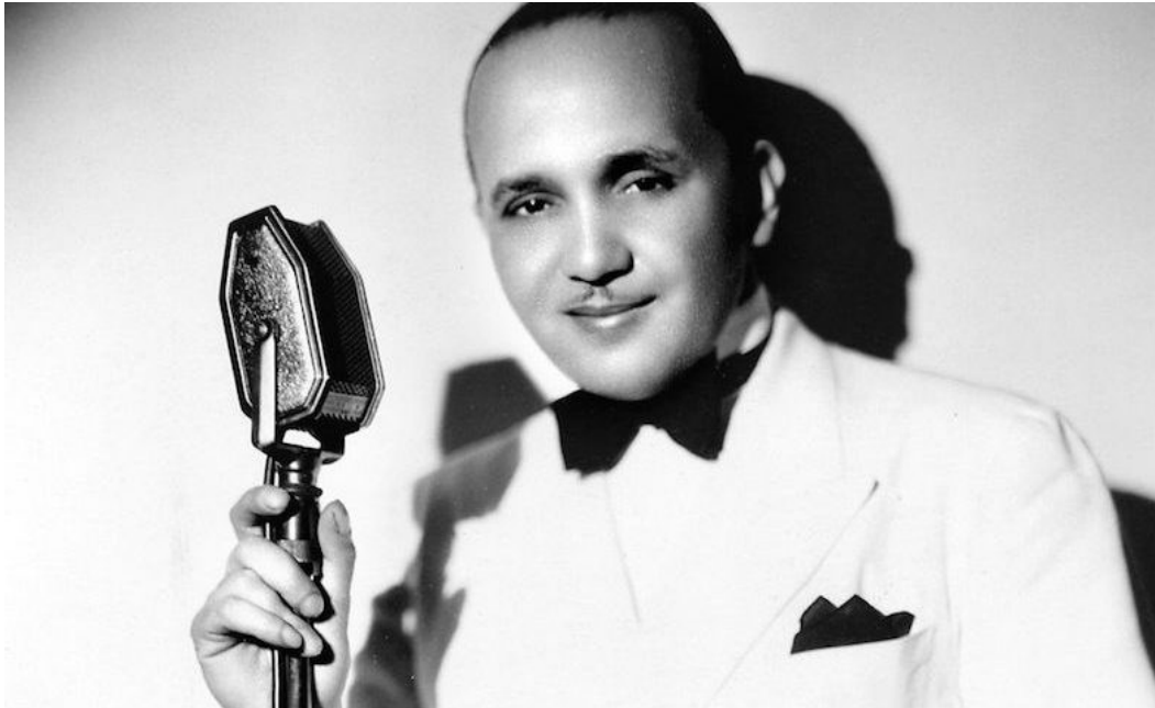
Fletcher Henderson (1897 – 1952)