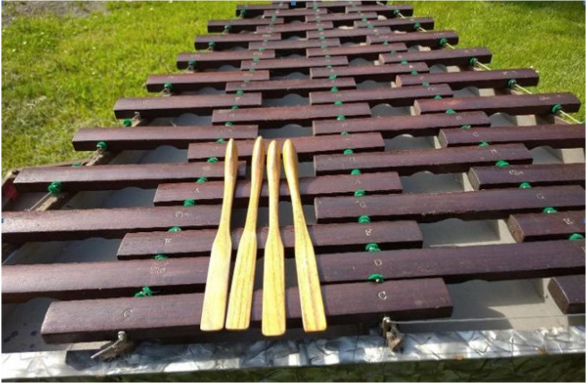
Xylophone (old model)