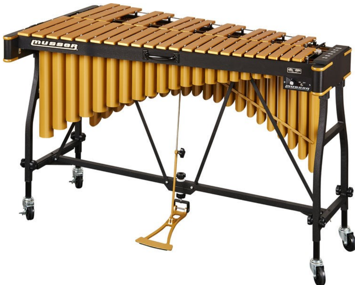
Vibraphone, Vibraharp, Vibes (čes. vibrafon)