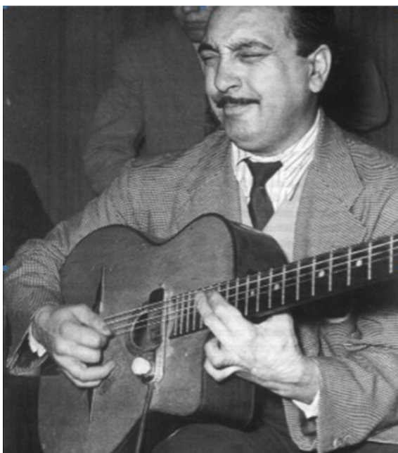
Django Reinhardt (1910 – 1953)