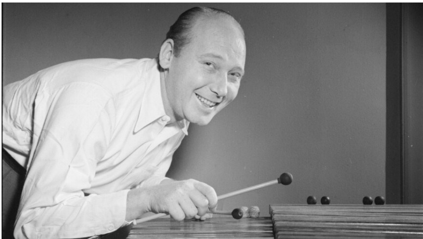
Red Norvo (1908 – 1999)