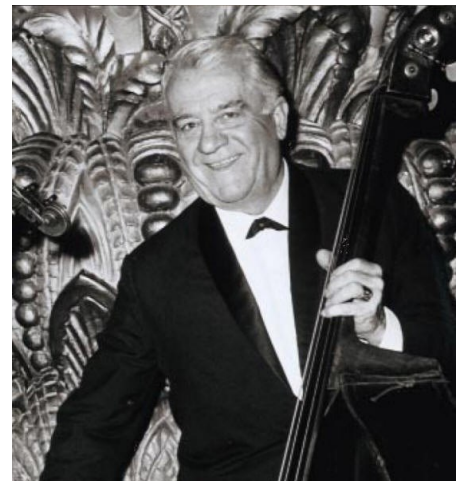
Louis Vola (1902-1990)