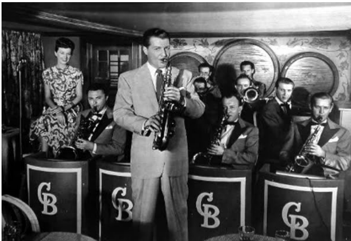
Charlie Barnet (1913 – 1991)