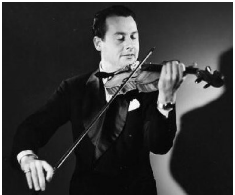
Stéphane Grappelly (1908 – 1997)