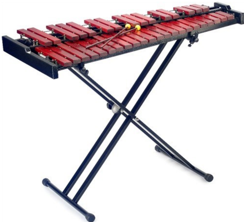
Xylophone (new model)