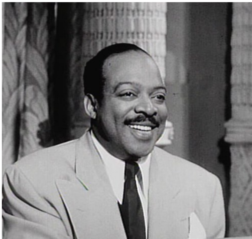
William James „Count“ Basie (1904 – 1984)