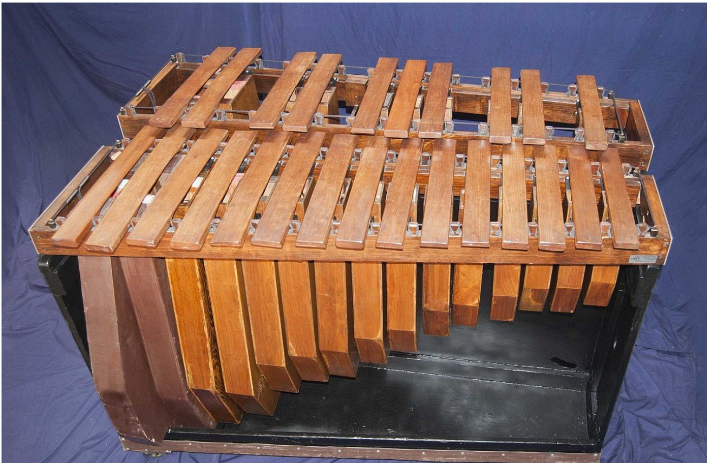
Contra Bass Marimba