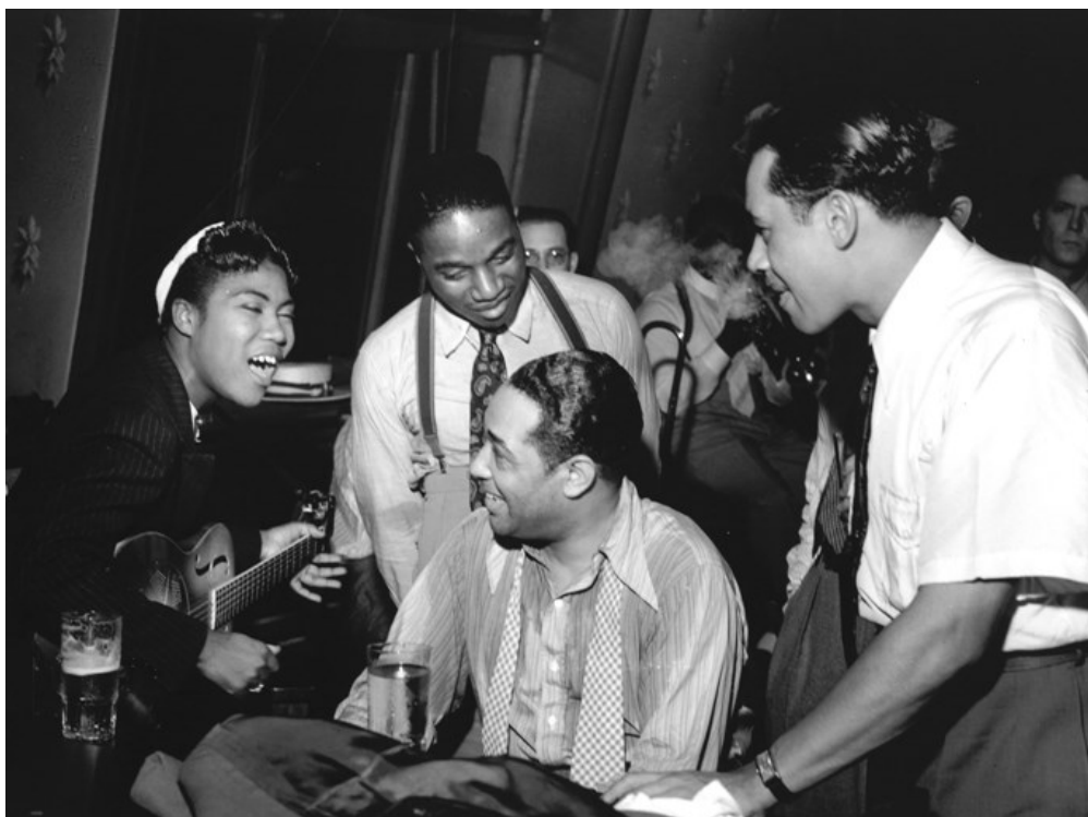
Ivie Anderson (1904 – 1949) & Duke Ellington (1899 – 1974)

Original issue Brunswick 6265 / matrix number B-11204-A.