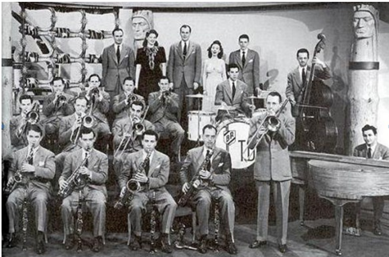
Tommy Dorsey (1905 – 1956)