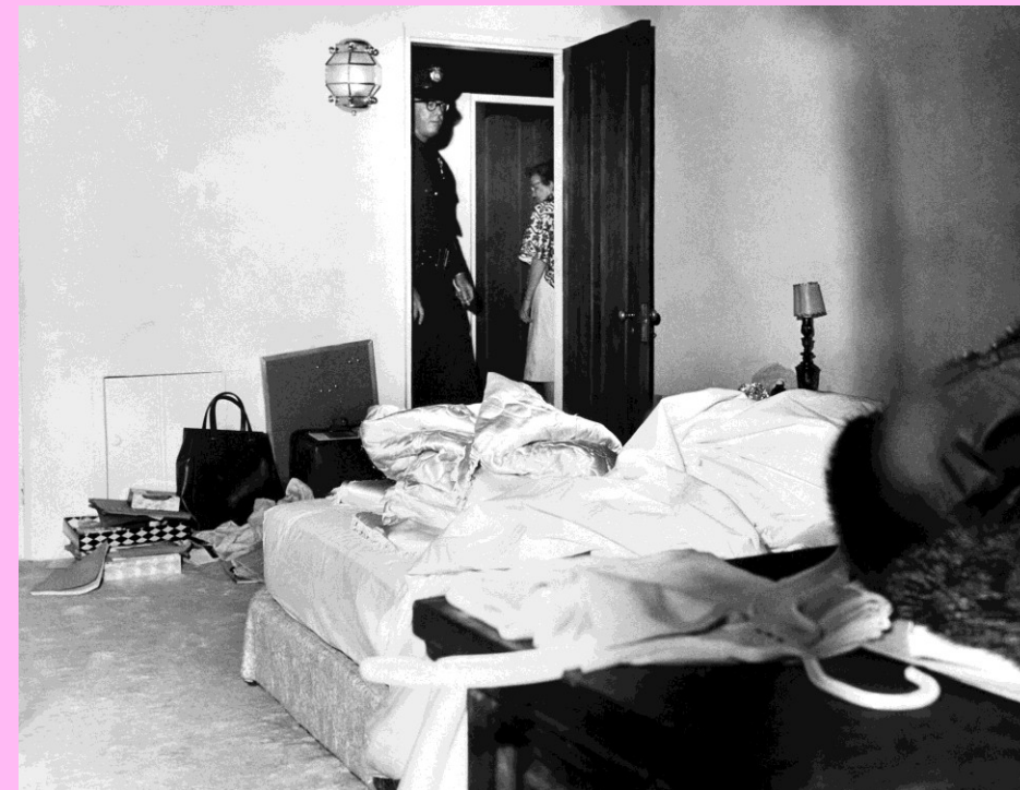
Police photographs from MM's bedroom where her dead body was found