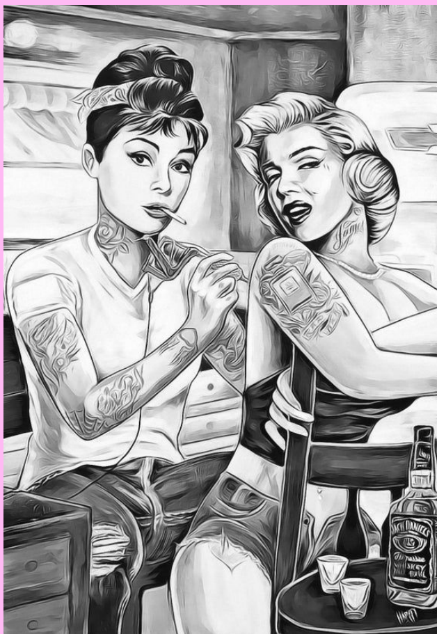
Campy reinterpretations of famous stars YES