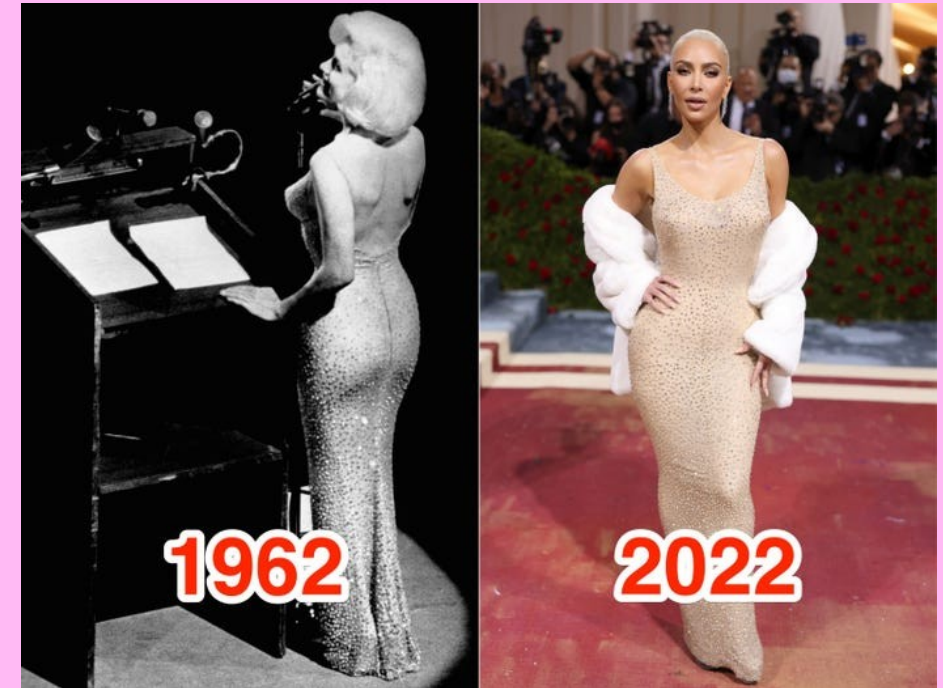
A Jean Louis gown worn by MM in 1962 As a material object – NO As a piece of cultural heritage worn previously by MM - YES