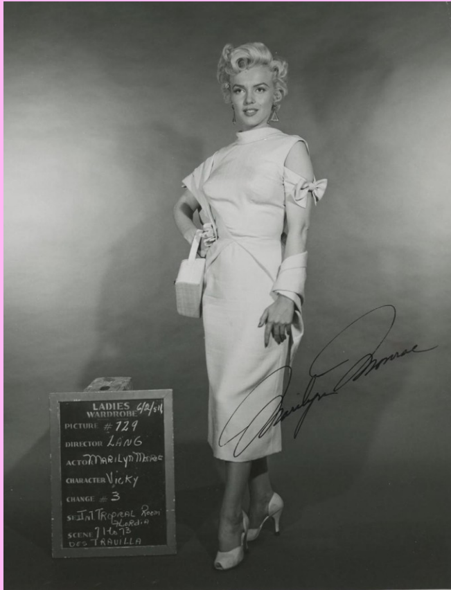
A signed photograph (a collector's item) Probably not