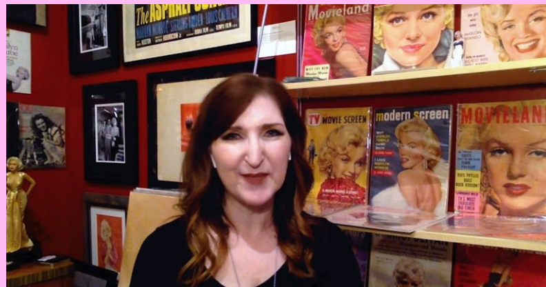
Interview with a memorabilia collector Probably not