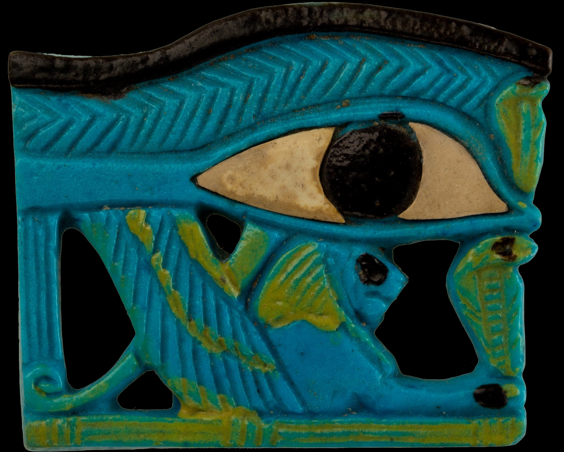
Wedjat Eye Amulet, c. 1,070–664 BCE, Egypt, faience and aragonite, 6,5 cm large /Metropolitan Museum, New York