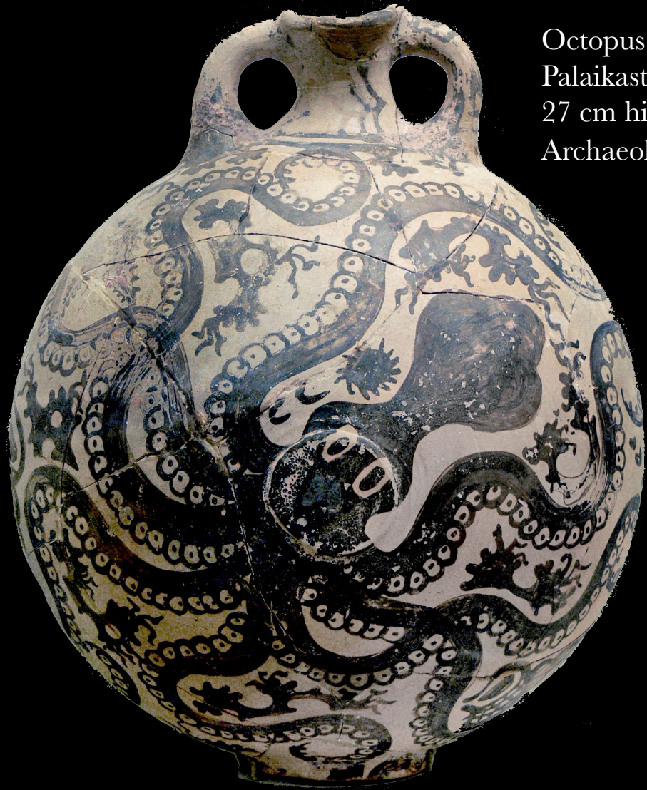
Octopus amphora, from Palaikastro (Crete), c. 1500 BCE, 27 cm high / Heraklion, Archaeological Museum