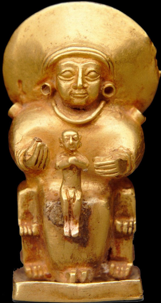
Seated goddess with a child, Hittite Empire (Central Anatolia), 1300–1200 BCE, gold, 4,3 x 1,7 x 1,9 cm / Metropolitan Museum, New York