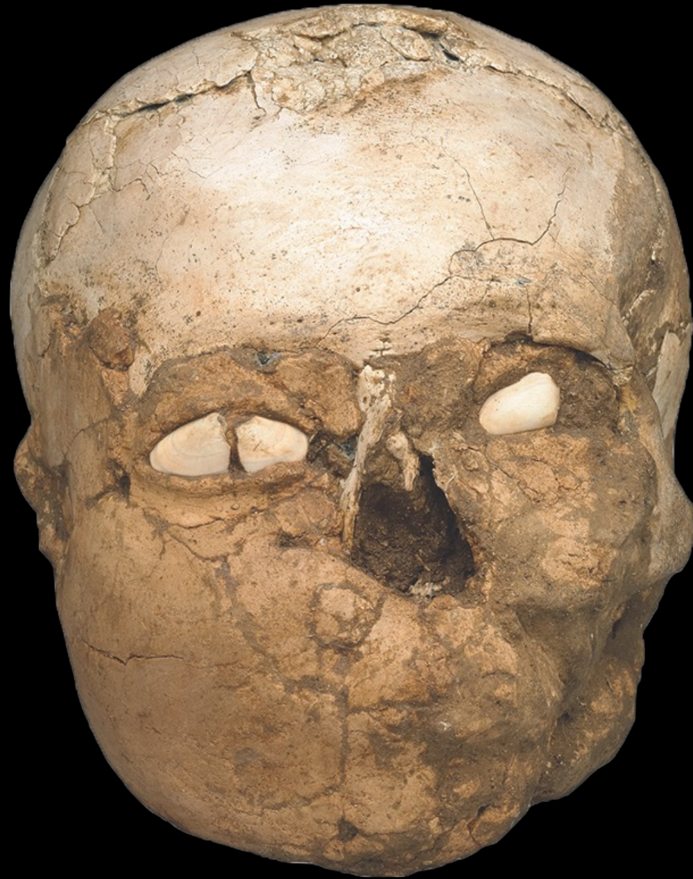
Jericho skull, humans skull decorated with plaster and shells, found near Jericho (Palestine), c. 8,200–7,500 BCE / British Museum, London