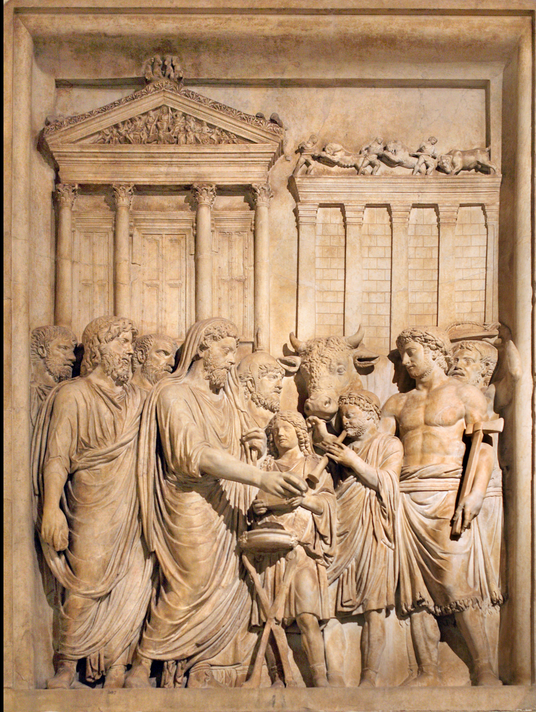
Marcus Aurelius sacrificing to the Gods, from the Arch of Marcus Aurelius, c. 176 CE / Rome, Musei Capitolini