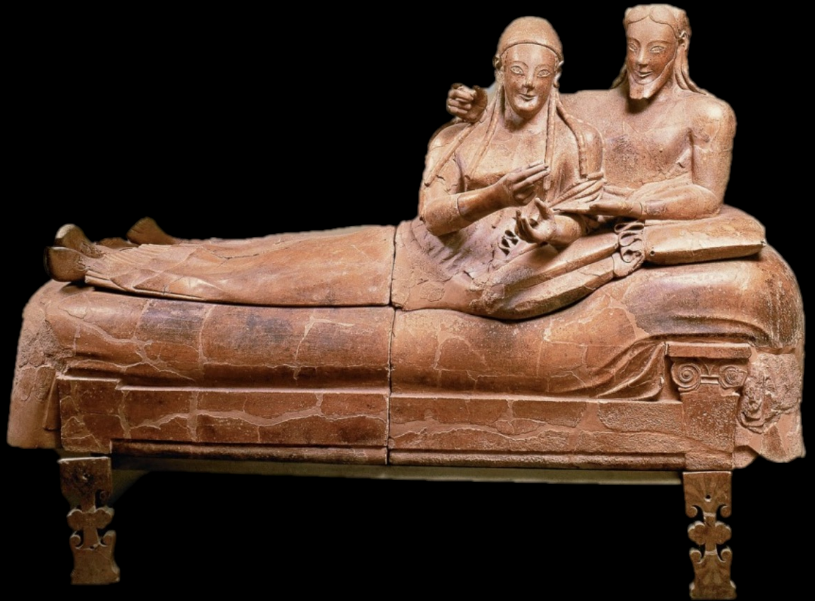
Sarcophagus of the Spouses, c. 550–580 BCE, terracotta, with traces of polychromy / Villa Giulia, Museo Nazionale Etrusco, Rome