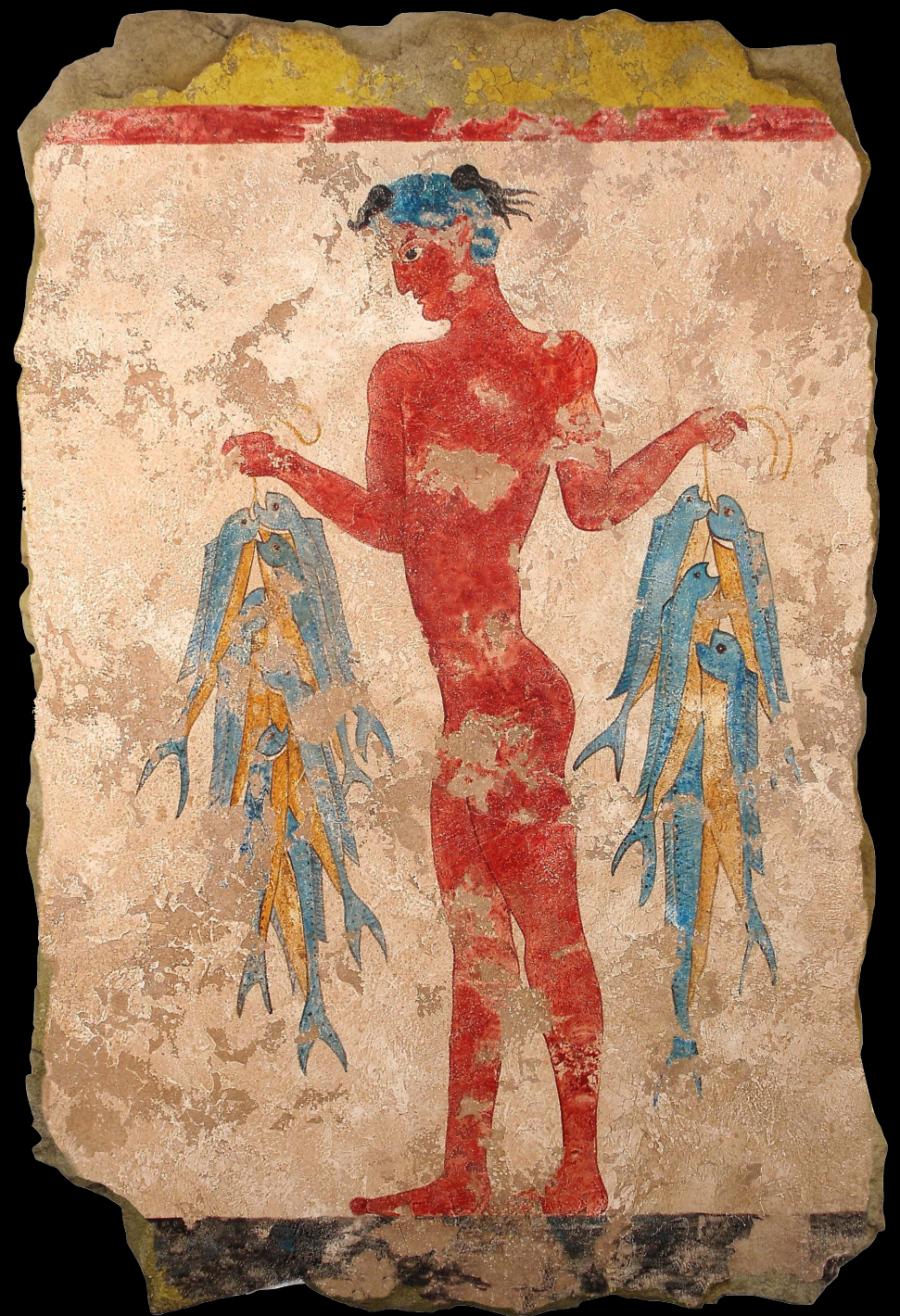
Fisherman fresco, from the Island of Thera (Santorini), West House, Room 5, c. 1,600 BCE / Athens, National Archeological Museum