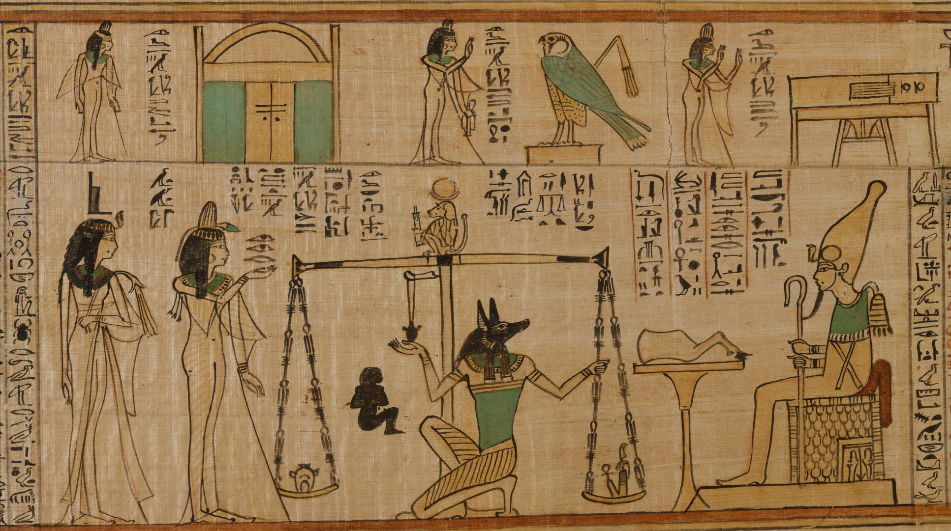
Book of the Dead for the Chantress of Amun, Nany From Egypt, Upper Egypt, Thebes, Deir el-Bahri, Tomb of Meritamun ca. 1050 B.C. Metropolitan Museum, New York