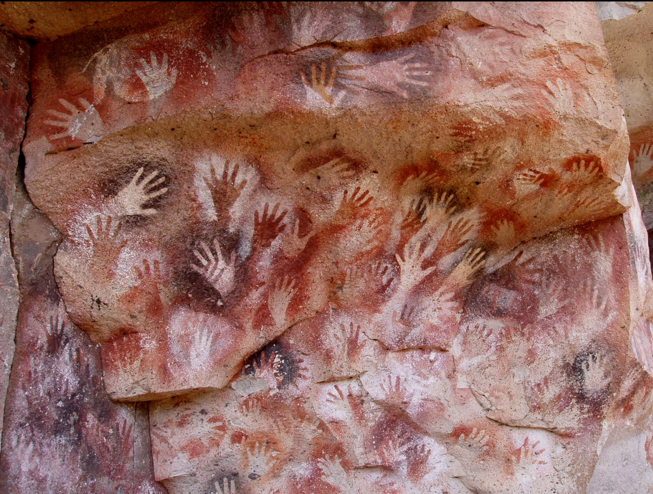
Cuevas de la Manos (Cave of the Hands), 2 periods: 13,000–9,000 BCE and 7,000–3,300 BCE, Argentina, province of Santa Cruz, Patagonia