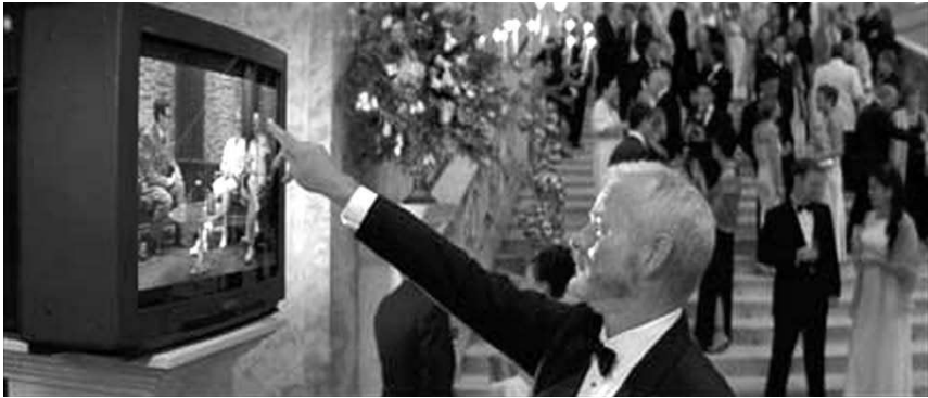
Steve's desire but inability to mourn the death of his friend Esteban in The Life Aquatic .

Steve is unable to properly mourn the loss of his friend, since his own life has become a hyperreal masculine performance. This is shown early on in the film. After screening his most recent film that recounts Esteban's death by shark attack, Steve watches an old televised interview with him and Esteban. In the interview Steve is asked, "People say Eleanor is the brains behind Team Zissou. What is Steve?" Steve chuckles yet remains at a loss to explain his purpose. He begins to look despondent, but Esteban then responds, "He's the Zissou," and touches Steve's arm, causing Steve to look back and smile. While watching the interview, Steve is visibly moved by Esteban's support and raises a finger to the television screen to Esteban's face. Static electricity zaps between Steve's flesh and the screen, revealing both an emotional connection between the two men and an incredible distance as Esteban's memory remains locked within these images. Both men's feelings are mediated by their hyperreal performances, restricting their emotions into tiny gestures of affection both on and off the screen.