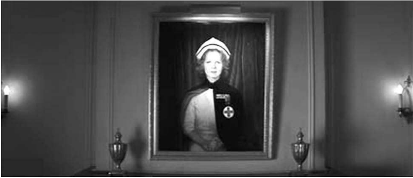
The looming presence of Royal's mother, Helen, in The Royal Tenenbaums .

embodies this unconscious melancholic loss that Royal suffers from in its refusal to visualize his father. Nonetheless, the impact of his father's neglectful influence in Royal's own twenty-two-year absence and dysfunctional familial interactions is obvious. The cyclical nature of patriarchal estrangement becomes apparent as we watch Chas, one of Royal's sons, alienate his own two boys. Just as Royal's actions have been affected by the death of his mother and the absence of his father, Chas's actions have been partially affected by the unexpected death of his wife. Afraid of losing his children, Chas becomes an overly protective father, keeping them underneath constant surveillance by making them incessantly crunch numbers for his business and exercise fifteen times a week. Ironically, in his attempts to avoid being physically and emotionally absent in his kids' lives, Chas smothers them with an overbearing presence that alienates them from him just as effectively as his own father did to him. Lurking beneath both Royal's and Chas's grief for the loss of an important woman in their lives is the figure of the father they never had.