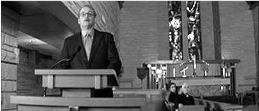
Blume's off-center framing mimics the placement of the family painting found at the beginning of Rushmore .

Max's repressed desires to claim and express their working-class inheritances that places such as Rushmore and Blume's factory dismiss. Music within the film functions much the same way as excess emotion operates within melodrama: "The undischarged emotion which cannot be accommodated within the [narrative] action . . . is traditionally expressed in the music and, in the case of film, in certain elements of the mise-en-scène . That is to say, music and mise-en-scène do not just heighten the emotionality of an element of the action: to some extent they substitute for it." 23 Because Rushmore Academy and Blume's factory psychically limit Max's and Blume's ability to express their working-class anger, these emotions are sublimated into the film's soundtrack.