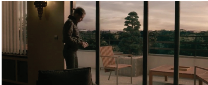
Figure 1: Paris is unrecognizable as the artificial-looking, delocalized backdrop to Kyra's apartment in Personal Shopper.

Happy End is in dialogue with France's former colonies, through the secondary but important presence of a family of North African domestic