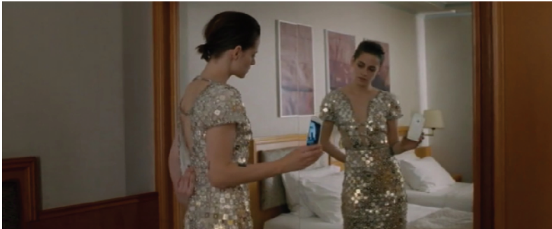
Figures 4 and 5: Like technology, clothes prosthetically reinvent the self in Personal Shopper.