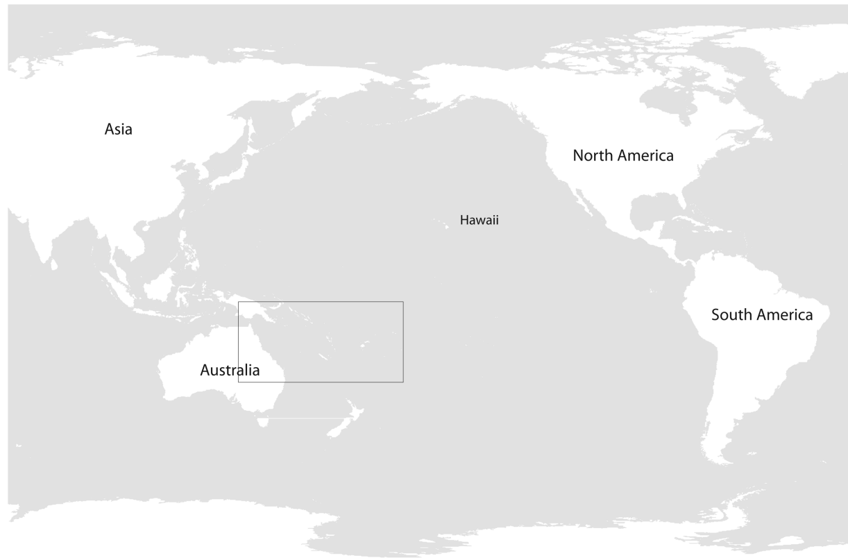
Figure 1. Map of the Pacific Ocean showing the central location of the Hawaiian Islands and the insert area for figure 2. Prepared by Mark Hauser.

of prestige goods. From archaeological evidence and ethnographic parallels among descendant communities, socially meaningful artifacts probably included many symbolic objects. Lapita prestige goods include the impressive Lapita pottery elaborated with beautifully executed geometric dentate-stamped decoration, sometimes on quite large forms; personal decorative items of shell; probably bird feather and woven products; and perhaps obsidian and stone adzes.