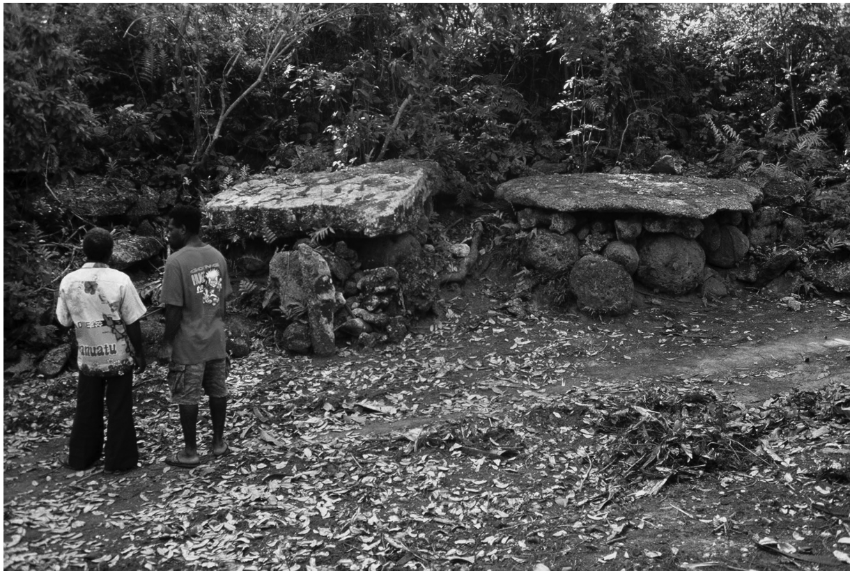
Figure 4. Stone pig-killing tables, Peterhul nasara (ceremonial ground), Vao Island, Malakula, 2003. A color version of this figure is available online.

ory of display events as a means to institutionalize the interpersonal labor and land relationships, on which an elemental staple finance system became based. Polity sizes of these societies would have rarely reached a thousand. They were unstable and difficult to maintain, and hierarchy was often challenged. In some parts of northern Malakula, the entire male community of a particular generation took a grade at the same time, seemingly to deny hierarchy based on anything but age (Layard 1942). Women too could take grades in many parts of northern Vanuatu. There were also areas of Vanuatu where intensified agricultural systems did not develop because of ecological constraints. Here, no strategic points of chiefly control existed, and more egalitarian political structures were prevalent.