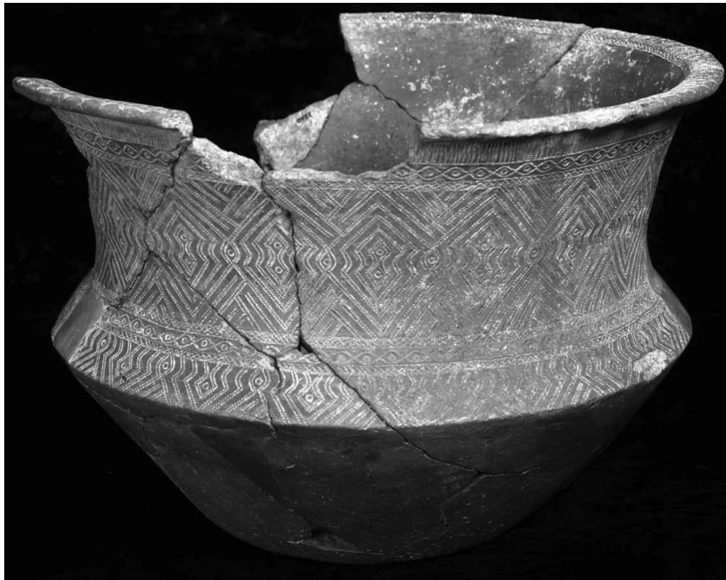
Figure 3. Example of a decorated Lapita vessel (full height, 21.5 cm). A color version of this figure is available online.

decoration is known ethnographically among descendant Pacific groups, and trade in feathers was common historically (Swadling 1996). In light of the iconography on the Lapita pots and the faunal remains of nonfood bird species (Stuart Hawkins, personal communication), brightly colored feathers probably served for headdresses and other personal ornaments. Many dramatic bird species were distributed across the region, and their colorful and exuberant feathers were probably highly valued. On the basis of ethnographic analogy and linguistic reconstruction, fine ceremonial mats and bark cloth could also have served as prestige goods, although they are unlikely to have survived archaeologically. Many sources for the feathers and mats would have precluded effective restrictions to flows.