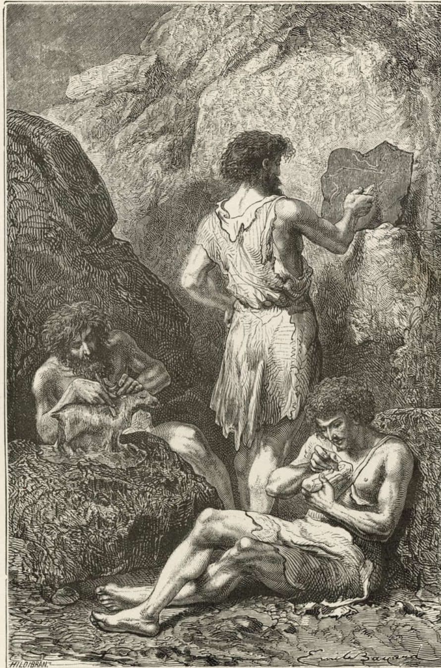
Émile Bayard, engraving, for Louis Figuier, L'Homme Primitif , Paris 1870

“The precursors of Raphael and Michelangelo, or the Birth of the Arts of Drawing and Sculpture in the Age of the Reindeer”