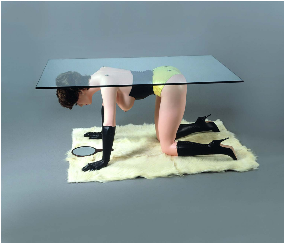
Top: Ed Atkins, Ribbons , 2014. © The artist and Cabinet, London.