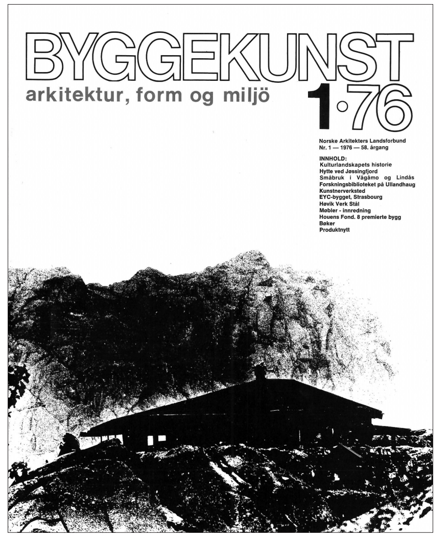
Front cover of Byggekunst (no. 1, 1976) featuring Robert Esdaile's DIY cabin on top of a cliff above the Jøssingfjord in south-western Norway.

Norway. The simple, un-intrusive structure consisted of a low wooden roof raised on top of the artillery emplacement, which was built in 1942 as part of Hitler's Atlantic Wall. Reclaiming a remote, spectacular site from the destructive forces of military technology and, by the smallest means possible, turning it into a sanctuary for the appreciation of the natural landscape, the project constitutes a highly symbolic gesture – a three-dimensional manifesto of ecological design. The location of the site made