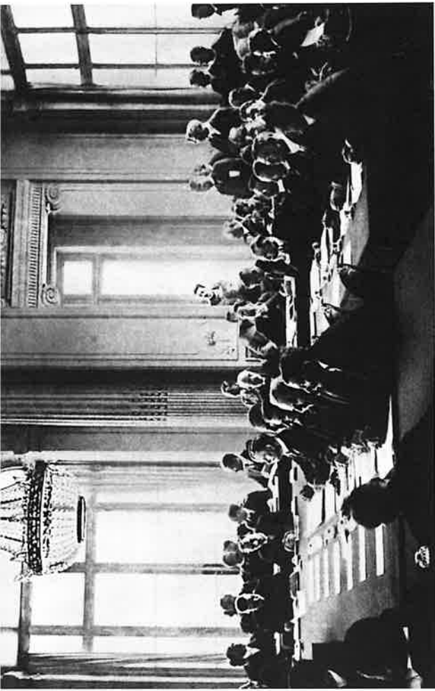
1 Edvard Beneš, a Czech nationalist, representing Czecho-Slovak interests at Versailles in 1919.