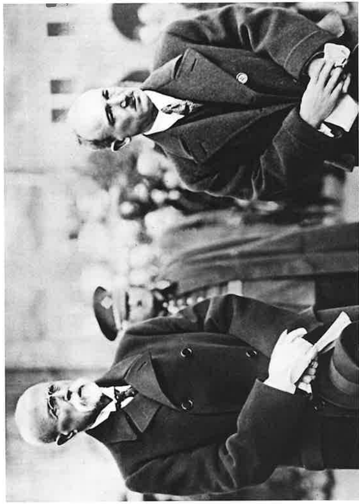
2 President-Liberator T.G. Masaryk and Foreign Minister Edvard Beneš in the 1920s. Beneš succeeded Masaryk as Czechoslovakia's second President in 1935.