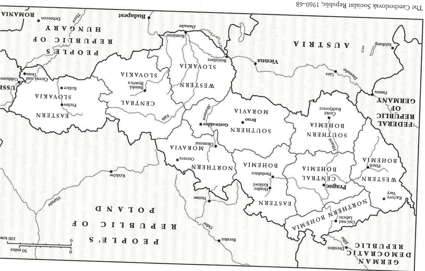
The Czechoslovak Socialist Republic, 1960-68

Article 4 of the constitution made explicit that 'the guiding force in society and in the state is the vanguard of the working class, the Communist Party of Czechoslovakia', which was defined as 'a voluntary militant alliance of the most active and most politically conscious citizens from the ranks of the workers, peasants and intelligentsia'. 107 The 'entire national economy' was to be 'directed by the state plan for the development of the national economy', a plan that was 'usually to be worked out for a period of five years' and, together with the annual state budget, promulgated by law. 108 The place of ideology was assured in Article 16, which stated that the 'entire cultural policy