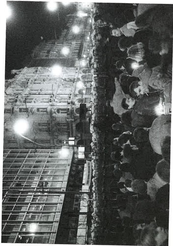
18 An approved student demonstration, held in Prague on 17 November 1989, was unexpectedly met by a wall of riot police. The rumour that a student had been killed galvanized public opinion and quickly led to revolution.

mentally different kind from the tens of thousands of other, far more obscure Czechoslovak political trials – of National Socialists, Slovak Democrats, priests, nuns, monks, scout leaders, members of Sokol , army recruits, 'kulaks' and countless other 'class enemies', to say nothing of hundreds of thousands of alleged 'traitors', wartime 'collaborators', 'saboteurs' and 'black marketers' – that preceded or accompanied this most sensational of trials. But there were two important differences. Unlike the other trials, which were a purely Czechoslovak affair, the quest for 'the Czechoslovak Rajk' was prompted by 'fraternal' pressure from other socialist countries, particularly Hungary, and included some direct Soviet involvement. Pressure and advice were not, however, the same thing as compulsion; and while contemporary Hungarian and East German political trials bore an uncanny resemblance to the Czechoslovak ones, the Polish Communist Party appears to have managed successfully to ignore the hints and requests from Moscow to conform.