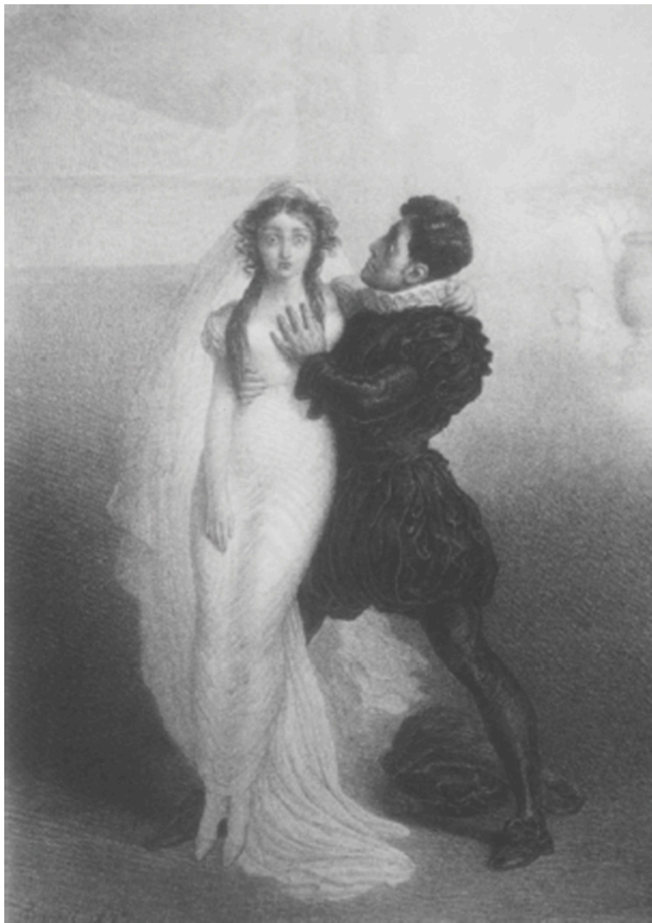
fig. 6-9 Harriet Smithson as Juliet to Charles Kemble's Romeo, Paris, Odéon Theater, September 1827.

Shakespeare was available for immediate possession: over the course of his career Berlioz composed three major works on Shakespearean subjects—a concert overture, Le roi Lear (King Lear, 1831); a “dramatic symphony,” Roméo et Juliette , actually a sort of secular oratorio for soloists, chorus, and orchestra, in which all the love music, significantly, is wordless (1839); and finally a comic opera, Béatrice et Bénédict (1862), after Much Ado About Nothing . Miss Smithson was not available. Berlioz spent the next two years in vain and hopeless pursuit, which culminated (just as it had with Schumann) in a temporary embittered renunciation that bore immediate musical fruit, in Berlioz's case the Symphonie fantastique .