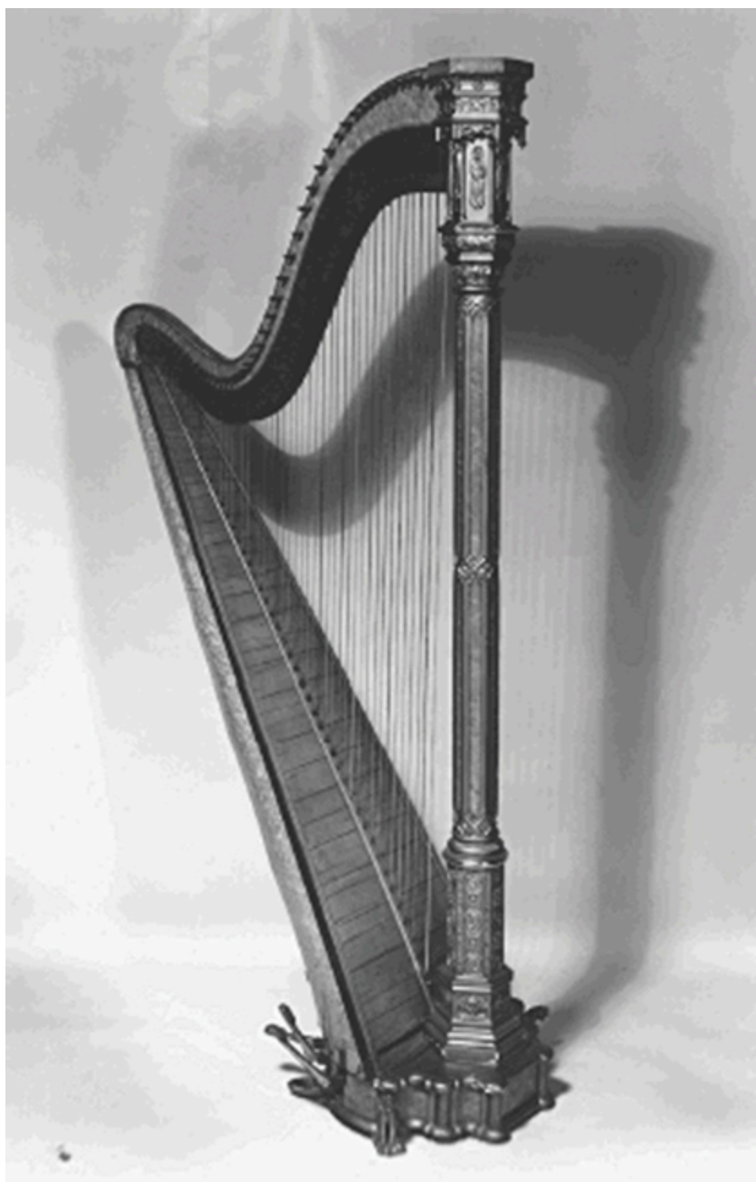
fig. 6-10 Double-action harp by Erard, ca. 1860.

Thus, in the second movement or “act,” the ball scene is evoked in the most direct way possible, by the use of actual ballroom music, in this case a waltz (by then a commonplace in operatic ballets). The harp music, too, is an element of characteristic “setting.” A ubiquitous instrument at domestic soirées and parties (especially in France), and lately a standard presence in the theater, the harp was making its symphonic debut in this movement. (As a concerto soloist it had a minor eighteenth-century history, again mainly French.) As late as 1886, César Franck's use of the harp in a nonprogrammatic symphony gave rise to controversy.