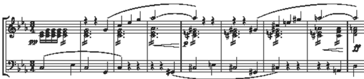
ex. 6-7a Ludwig van Beethoven, Symphony no. 3, I , mm. 182-90

beginning of the development section in the first movement of Beethoven's Eroica Symphony, first performed in Paris under Habeneck only two years earlier: compare Berlioz's modulations by ascending half steps at measures 168 ff, each stage prepared by a flat submediant, with Beethoven's right after the first movement's double bar (Ex. 6-7). The technique of modulation by half step, only a starting point for Beethoven, is maintained by Berlioz through the development section with unprecedented consistency. Rarely if ever had a stretch of music of comparable length so relied on half-step rather than fifth relations for its harmonic coherence.