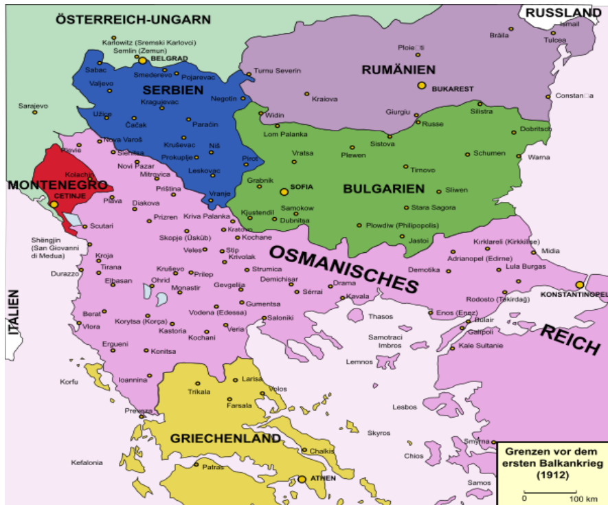
Political Boundaries in the Balkans before First Balkan War